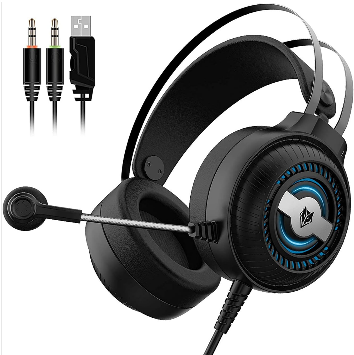
Image 1.1: Nubwo N1 Pro Gaming Headphones with their 3.5mm audio jack, microphone jack, and USB connector for LED lighting.