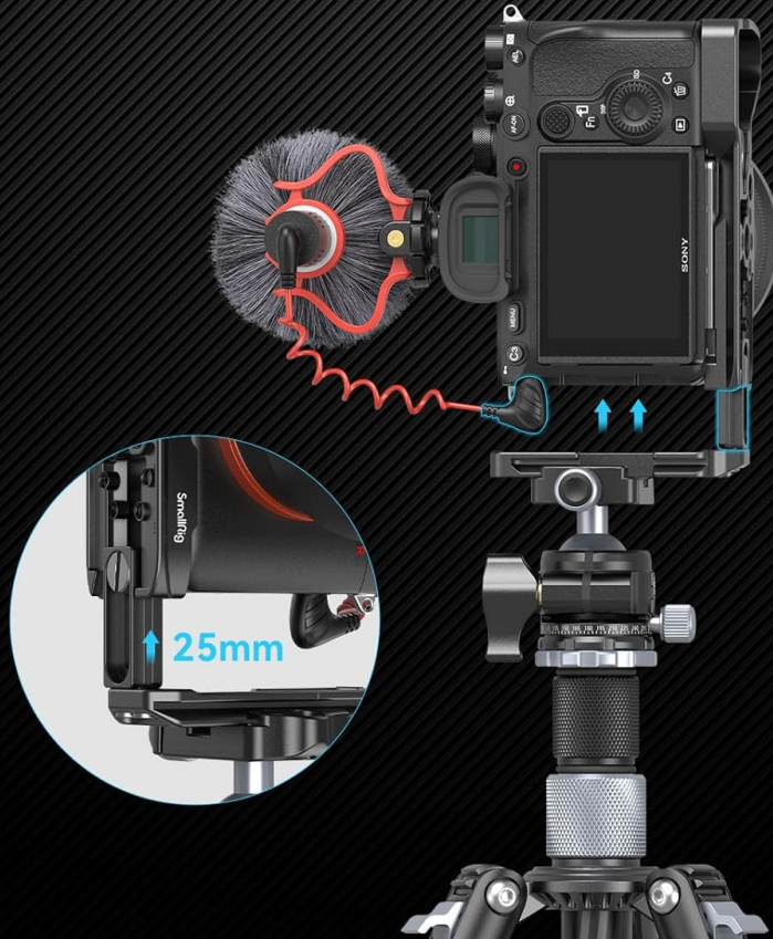
Image 5.2: The extendable side plate feature for improved cable management.

The baseplate can be stretched up to 25mm during vertical shooting to allow cable access