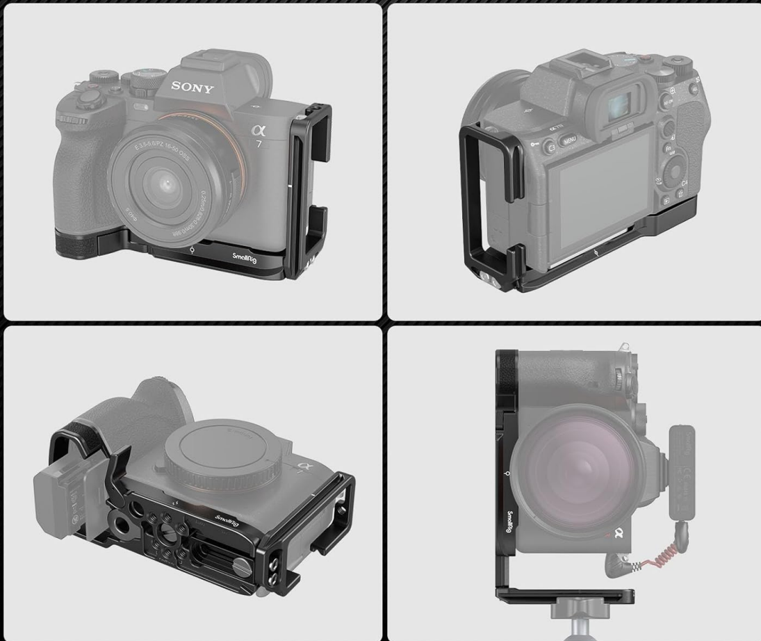
Image 5.3: Visual confirmation of full access to camera interfaces.