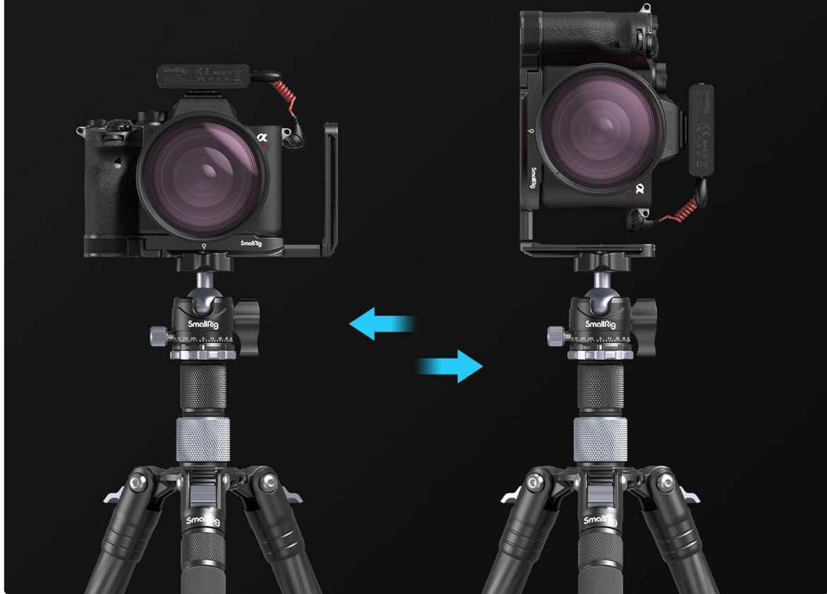
Image 5.1: Demonstrating the quick switch functionality for shooting orientation.

Designed with quick release plate for Arca-style for quickly switching between horizontal and vertical