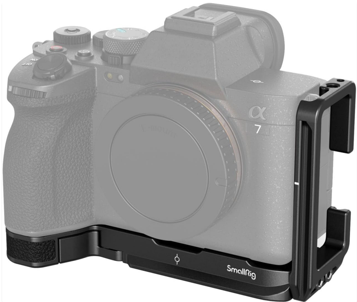
Image 1.1: SmallRig L-Bracket 3660B mounted on a Sony Alpha camera.