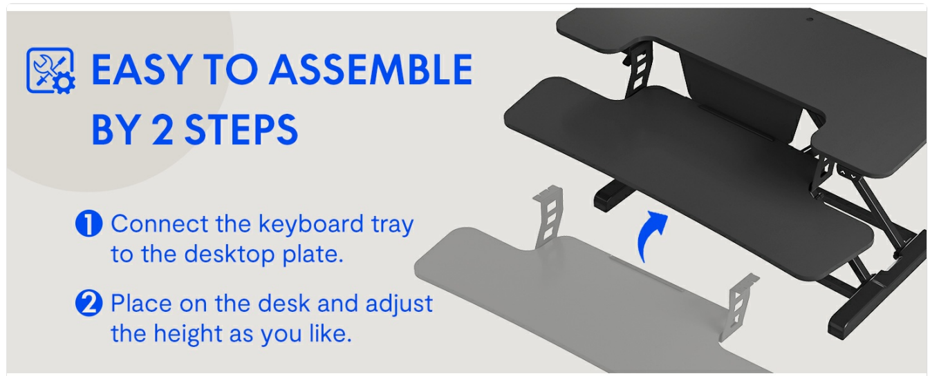
Figure 2: Simple two-step assembly process for the desk converter.