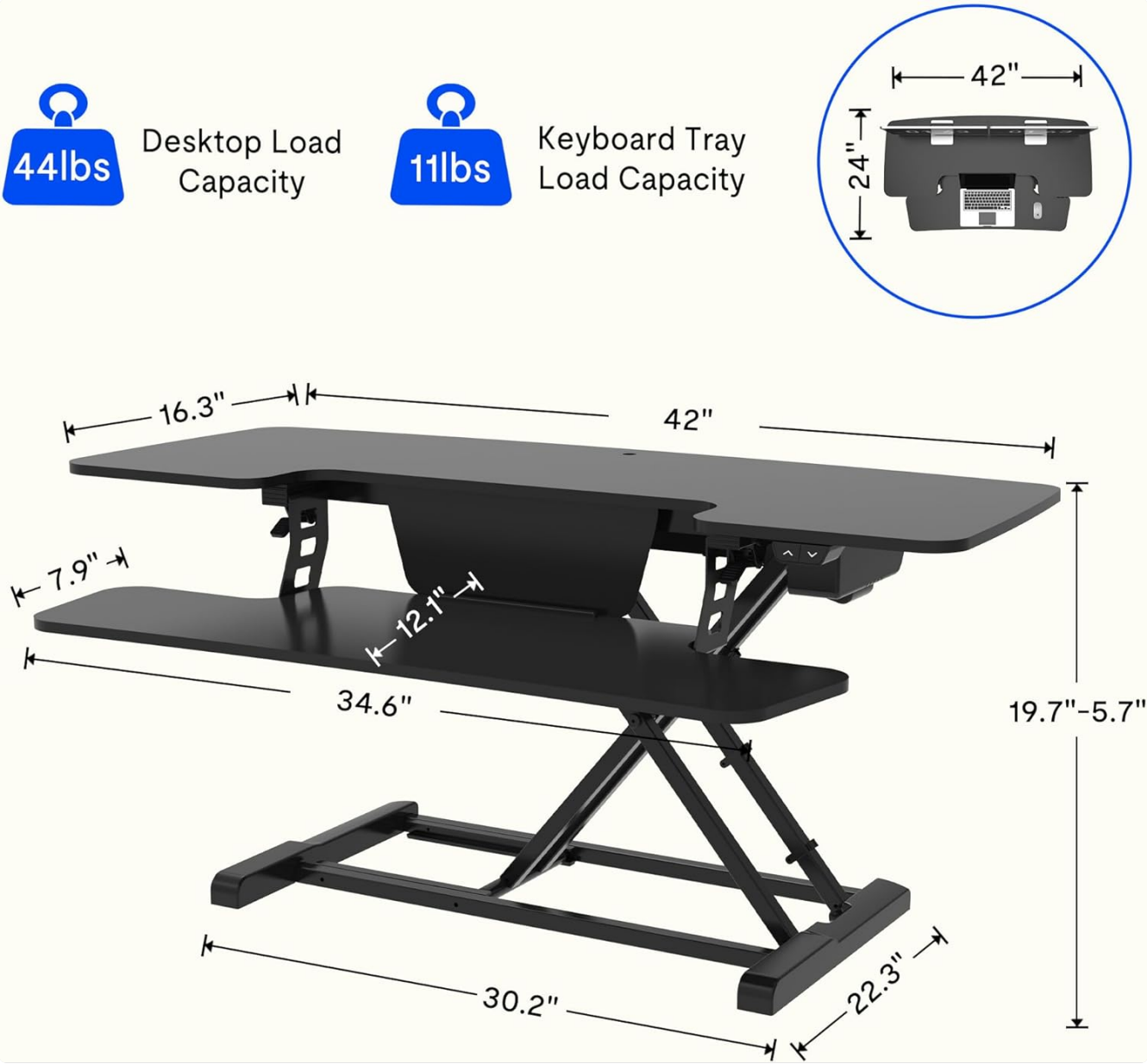
Figure 6: Detailed dimensions and load capacities of the desk converter.