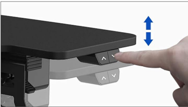
Button for sit-stand transitions