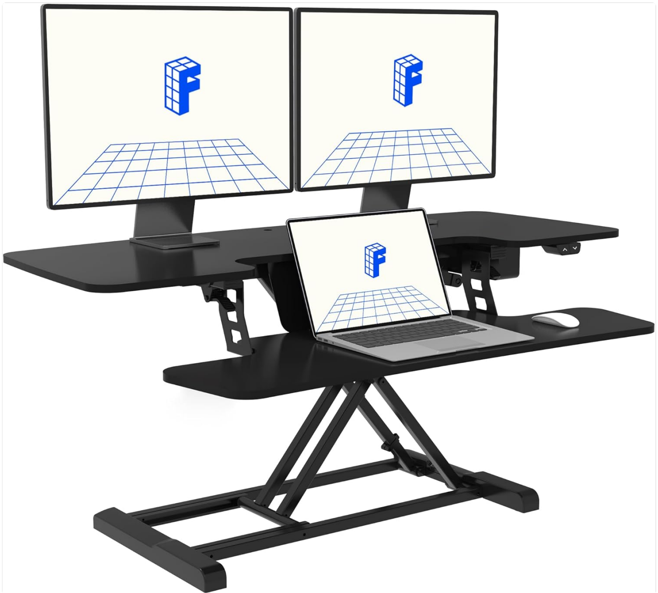
Figure 1: The FLEXISPOT 42-inch Electric Standing Desk Converter in a typical office setup, supporting two external monitors and a laptop.