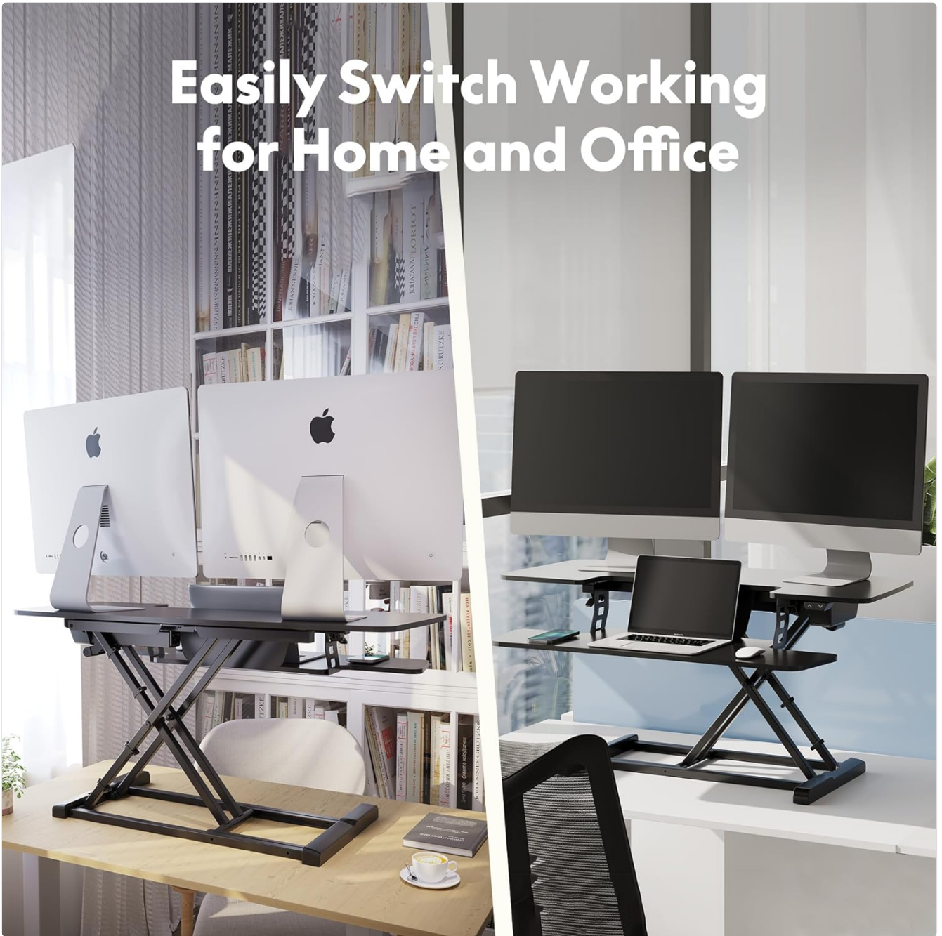
Figure 4: The spacious and removable keyboard tray provides ample room for a keyboard and mouse.