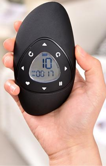
Figure 5: 15-Channel Timing Remote Control