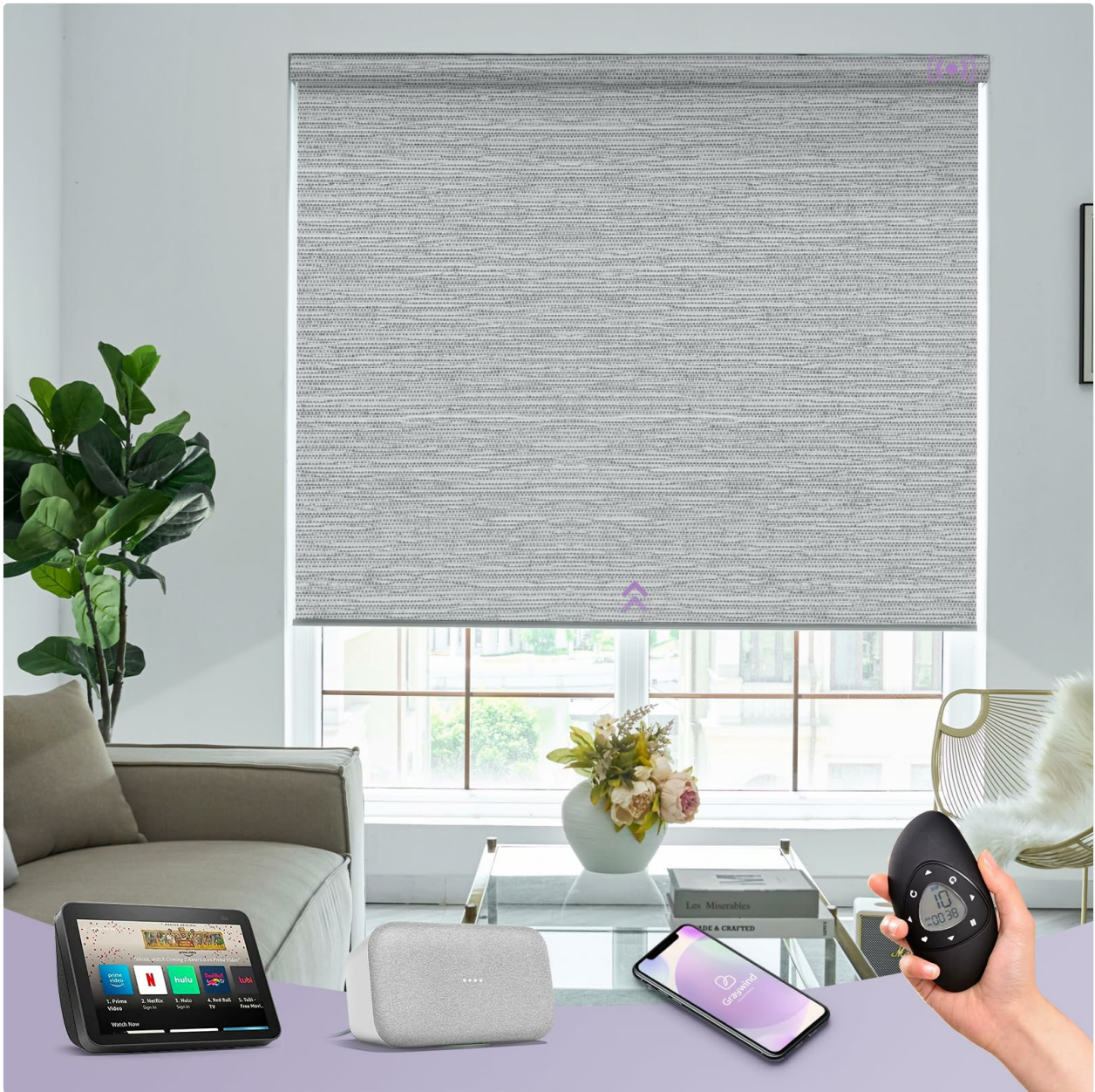
Figure 1: Graywind Motorized Blackout Roller Shade