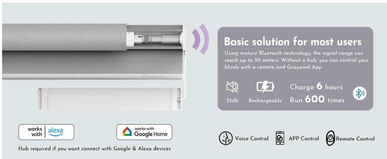
Figure 4: Smart Home Integration Overview

Video 3: Zigbee Motor Direct Connection With Alexa. This video guides you through the process of connecting your Zigbee-enabled Graywind shades directly to compatible Alexa devices for voice control.