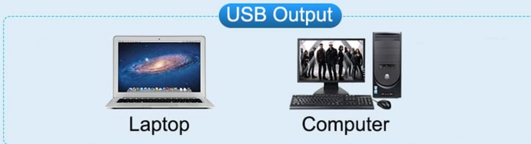
Diagram showing how to connect the video capture card. HDMI input sources (DV, Projector, PlayStation 4, Xbox) connect to the capture card, which then connects via USB output to a Laptop or Computer.