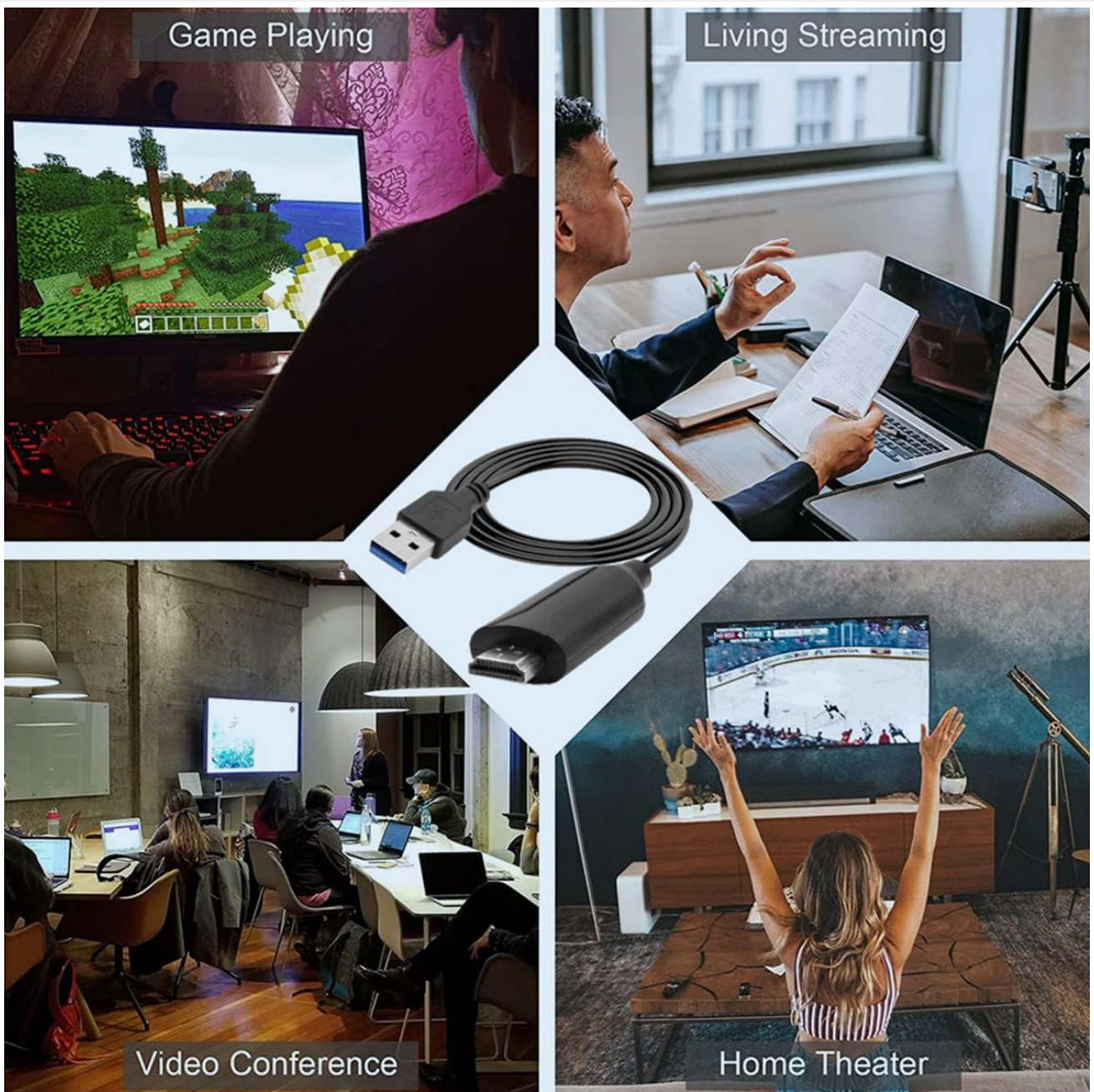
Collage of images demonstrating various applications of the video capture card, including game playing, live streaming, video conferencing, and home theater setups.