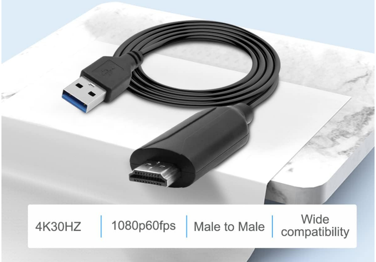
Image showing the HDSUNWSTD 4K HDMI to USB Video Capture Card, featuring a male HDMI connector on one end and a male USB connector on the other. The cable is black and coiled.