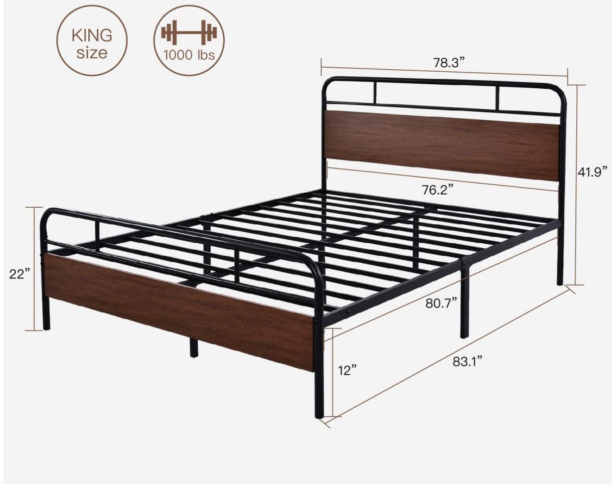
Image: Detailed product size diagram for the Ikalido King Size Bed Frame, including length, width, and height measurements.