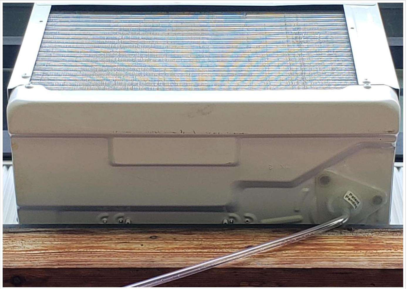
Image: The magnetic drain funnel adapter and the included 10-foot clear tubing.