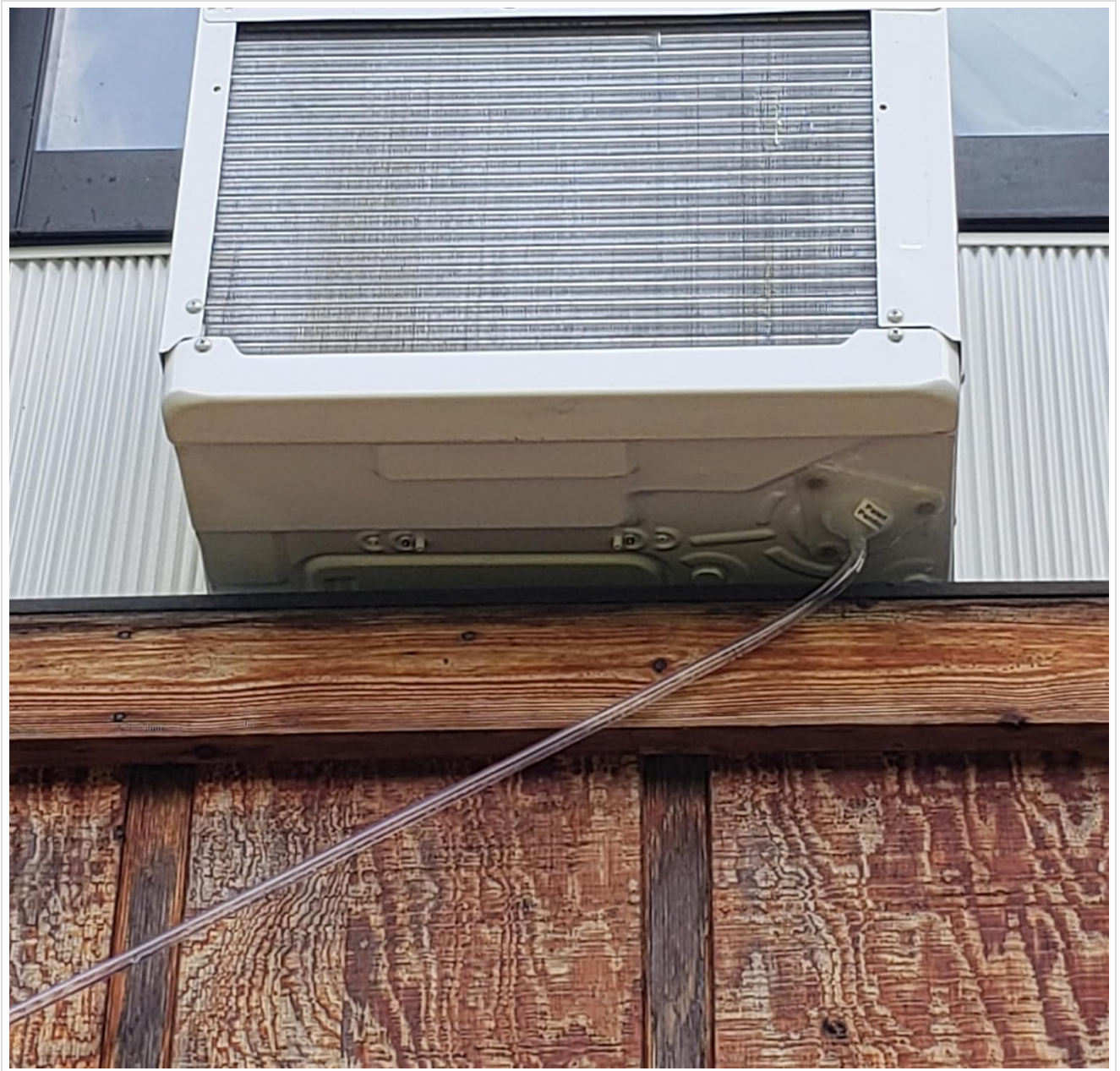
Image: A window air conditioner unit with the clear drain hose already connected and directing water away.