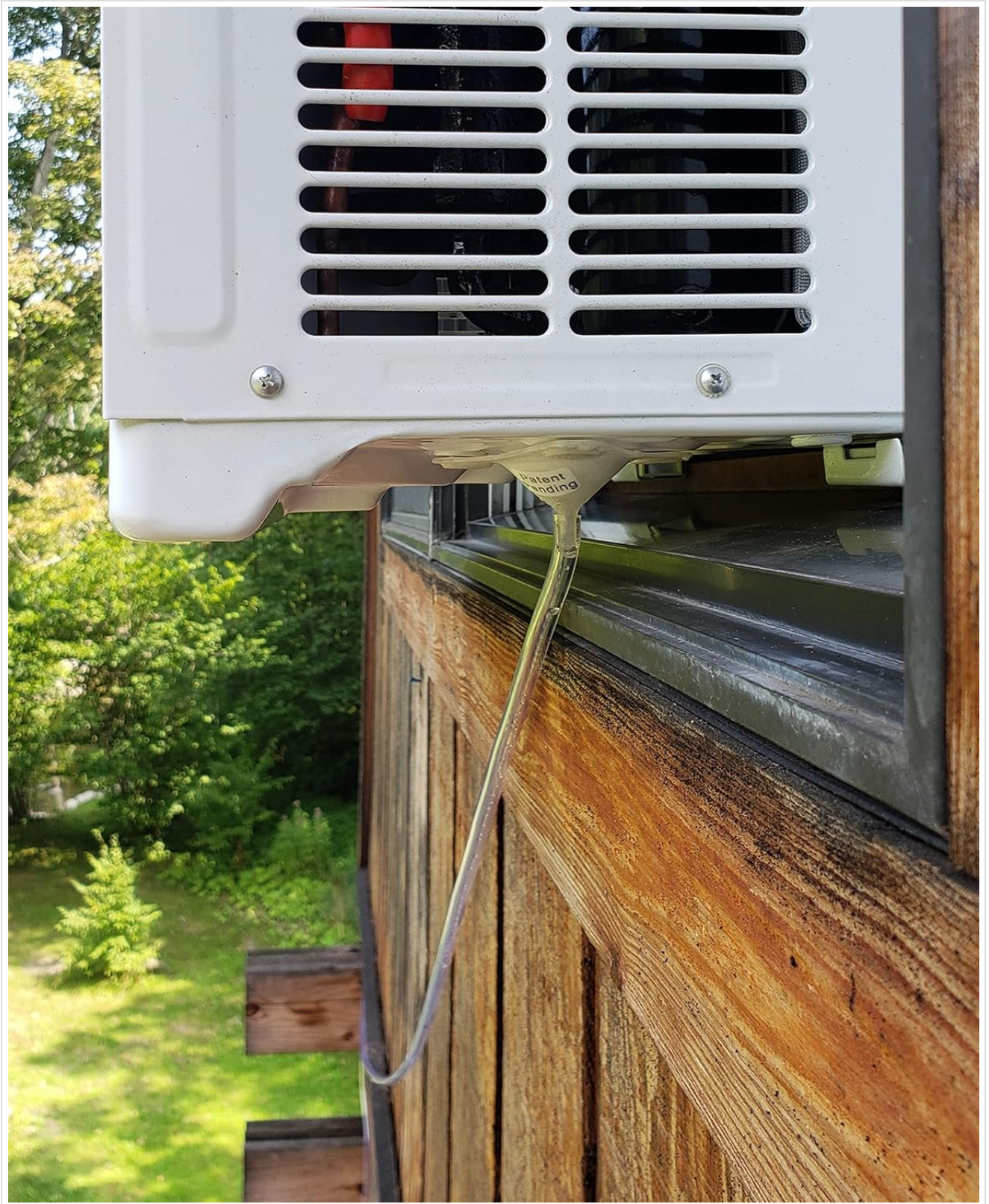
Image: A side view of an air conditioner unit showing the clear drain hose extending downwards from the magnetic adapter, directing water away from the building.