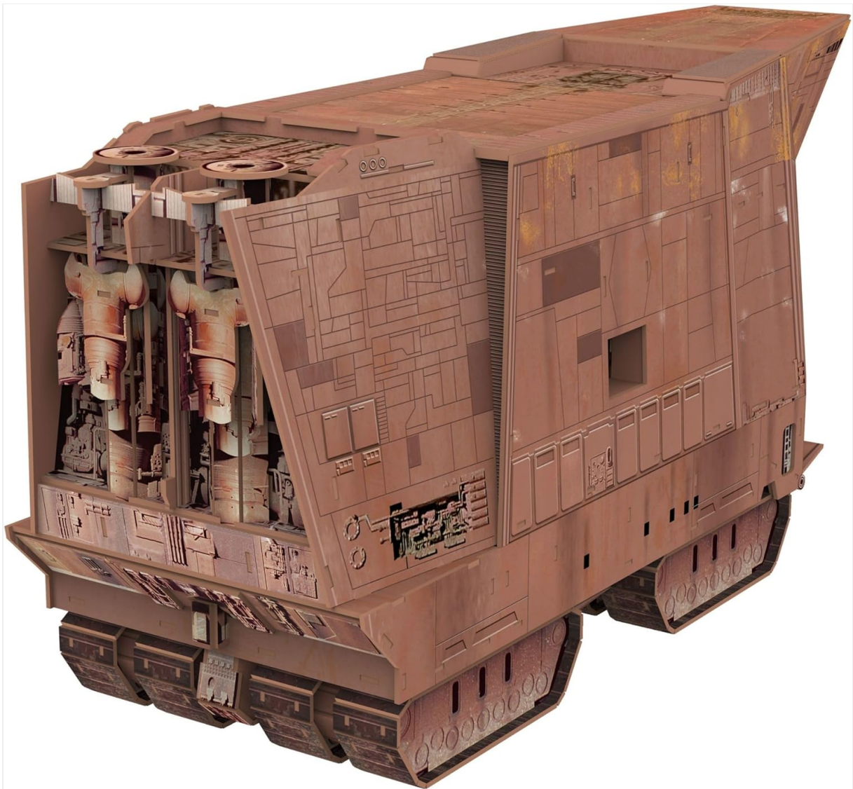
An aerial view of the assembled Mandalorian Sandcrawler, highlighting the open engine bay and the overall structure from above.