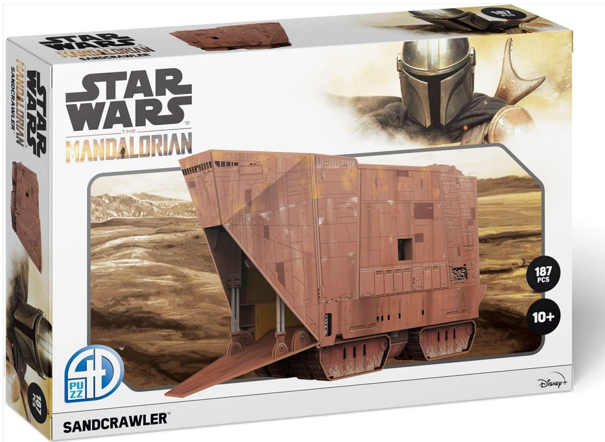
The product packaging for the 4D Cityscape Star Wars Mandalorian Sandcrawler 3D Paper Model Kit, showing the completed model and key features.