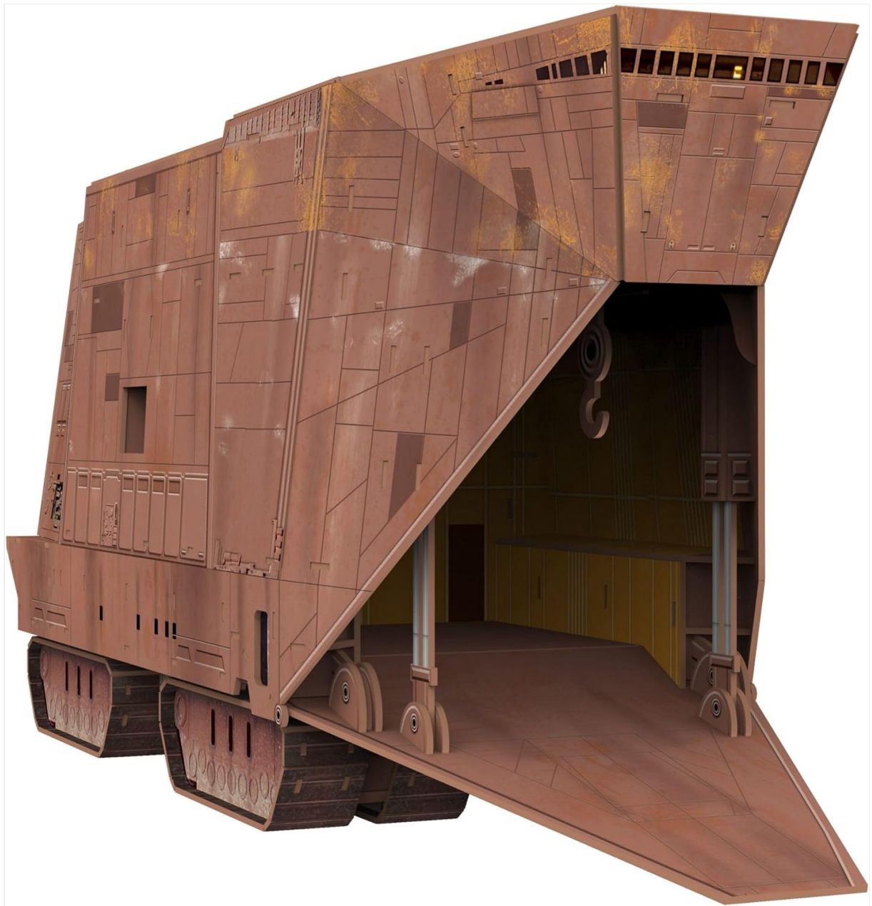
The assembled Mandalorian Sandcrawler model from a rear-side perspective, with its loading ramp extended, revealing interior details.