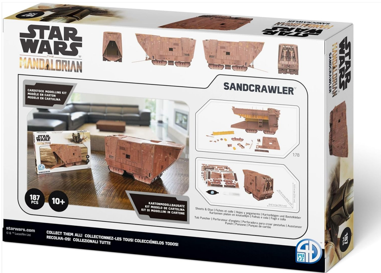
The reverse side of the product box, illustrating the various paper sheets and components included in the kit, along with assembly diagrams.