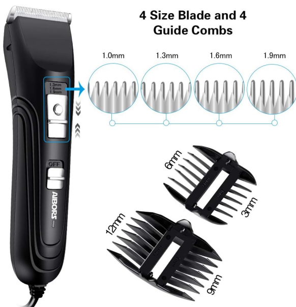
Figure 5: Adjustable Blade and Guide Combs.