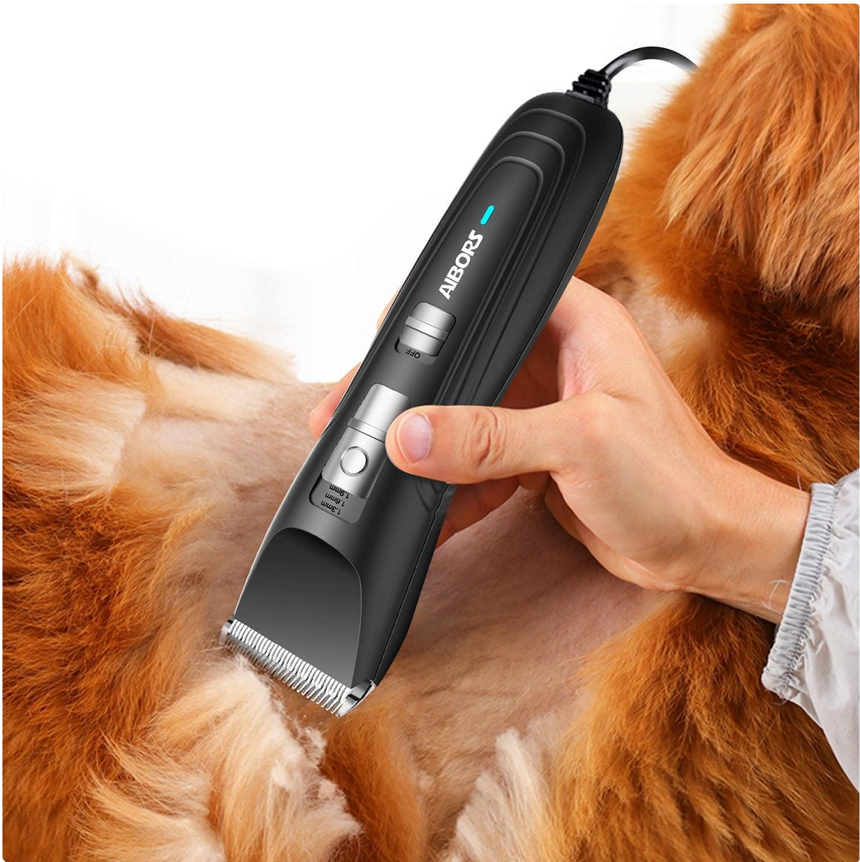
Figure 1: AIBORS 12V High Power Pet Grooming Clippers in use.