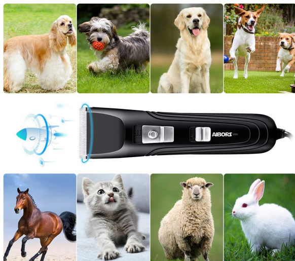
Figure 6: Suitable for various animals.