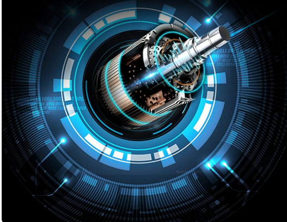
Figure 4: 12V Powerful Motor.

Stable & Low Noise Professional Copper-Axis