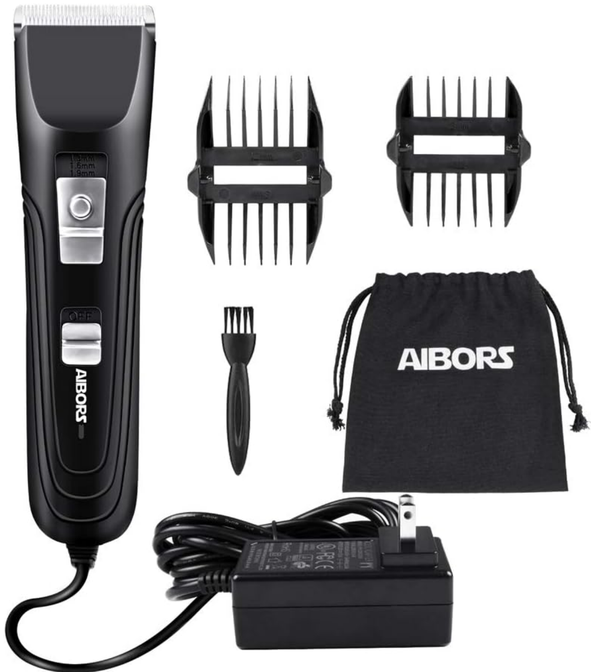
Figure 2: Contents of the AIBORS Pet Grooming Kit.