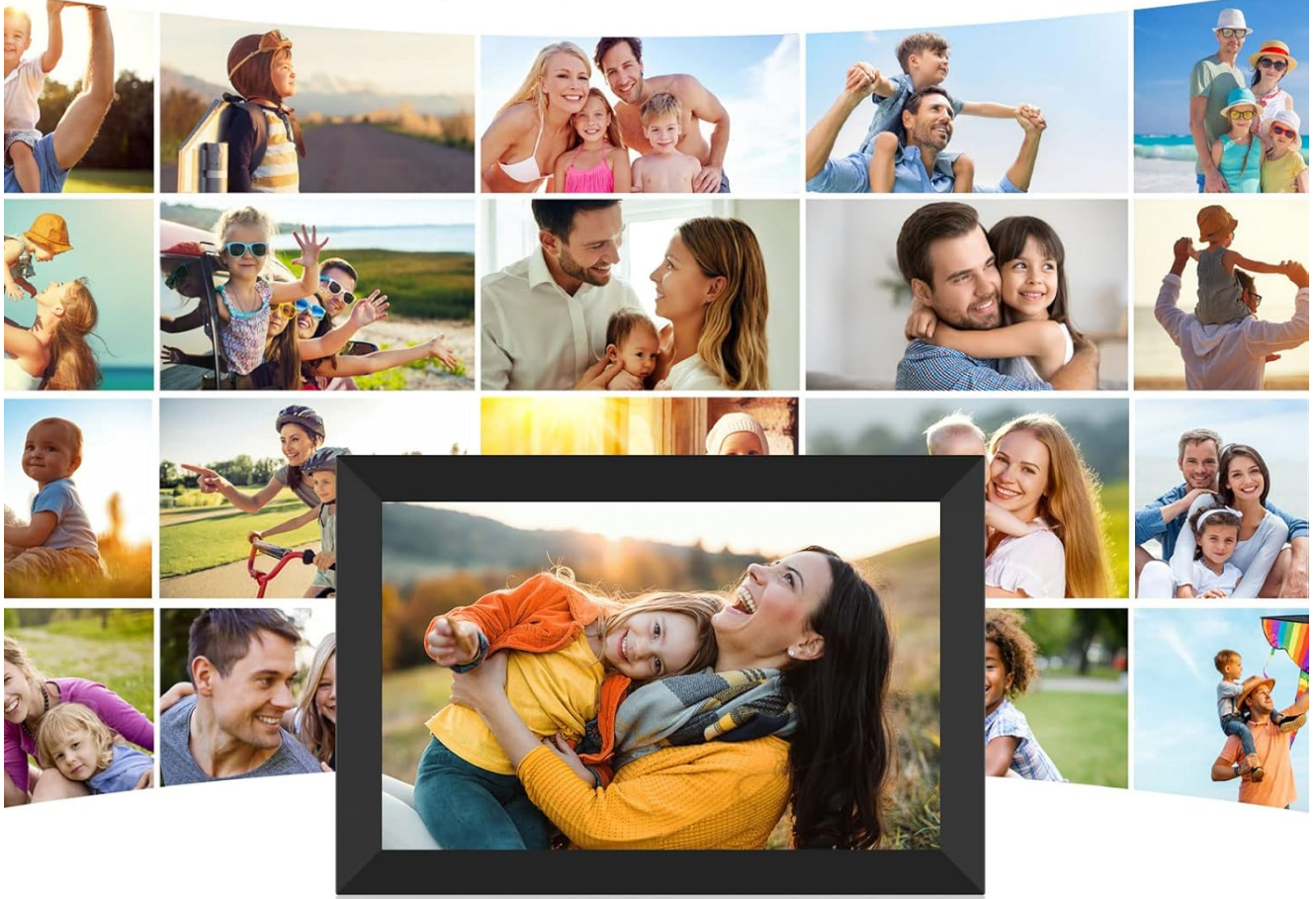
Key features and specifications of the 10.1 inch WiFi Digital Picture Frame.