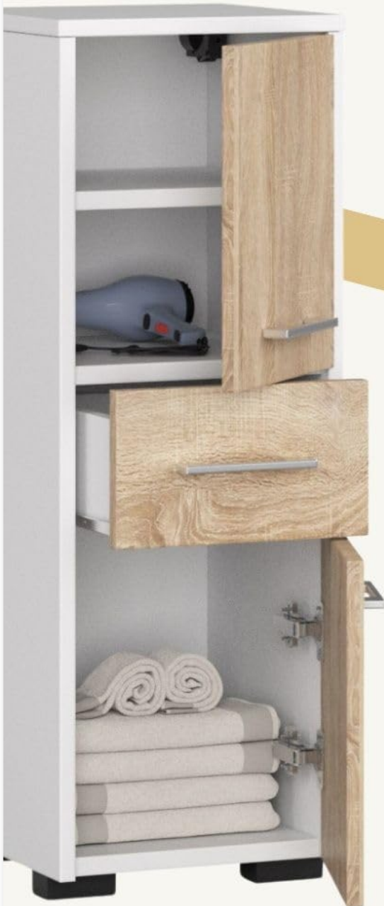
Image 3.1: An open view of the cabinet's interior, displaying the upper and lower door-accessed compartments and the central drawer, suitable for organizing various bathroom items.

Le placage sur les bords ajoute un aspect esthétique au meuble de salle de bain