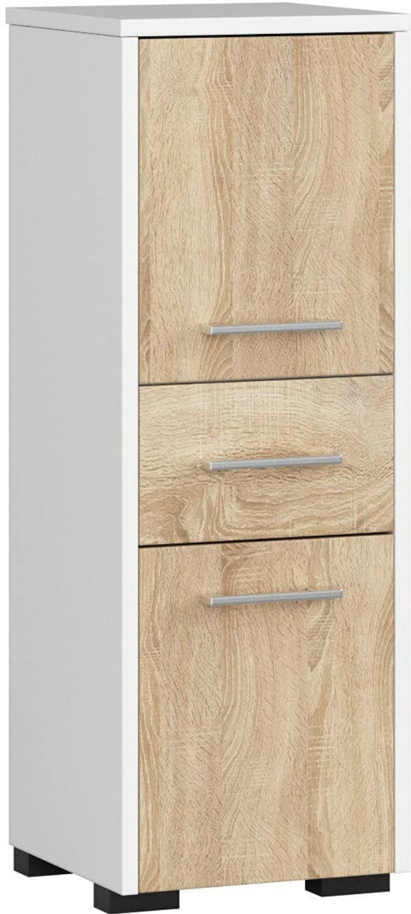
Image 1.1: The AKORD Bathroom Cabinet 85 2D1SZ, showcasing its two doors and central drawer in a Blanc / Chêne Sonoma finish.

Constructed from 16 mm thick laminated engineered wood, the cabinet features ABS veneer edges for enhanced