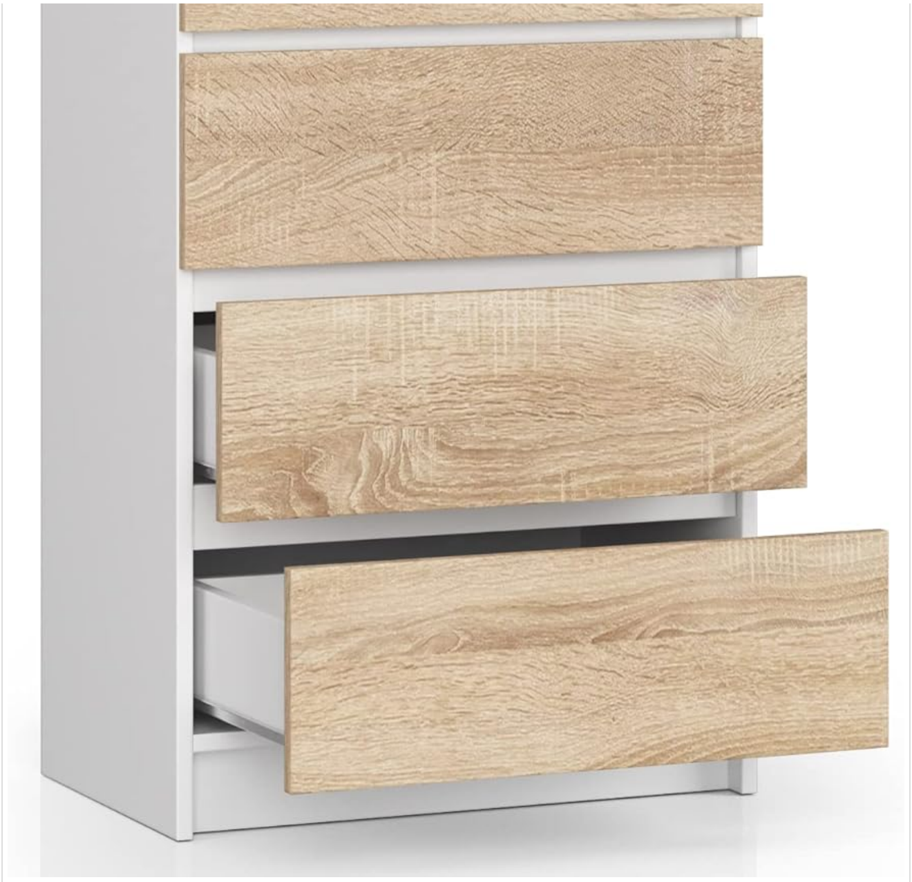
Image 1: AKORD K60 6-Drawer Chest of Drawers (White / Sonoma Oak finish).