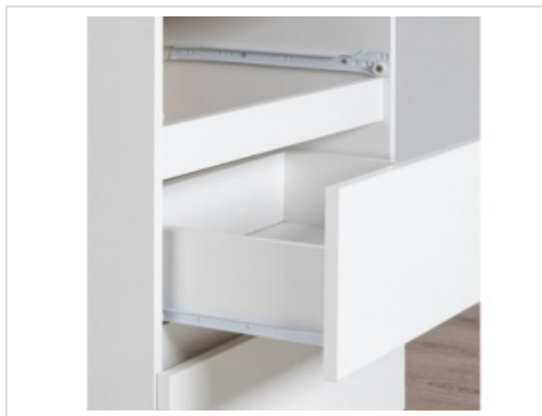
Image 4: Securing the outer part of the drawer slide to the cabinet's side panel.

Attach the outer part of the metal slides to the pre-drilled holes on the inner sides of the cabinet frame. Ensure they are level and correctly aligned for smooth drawer operation.