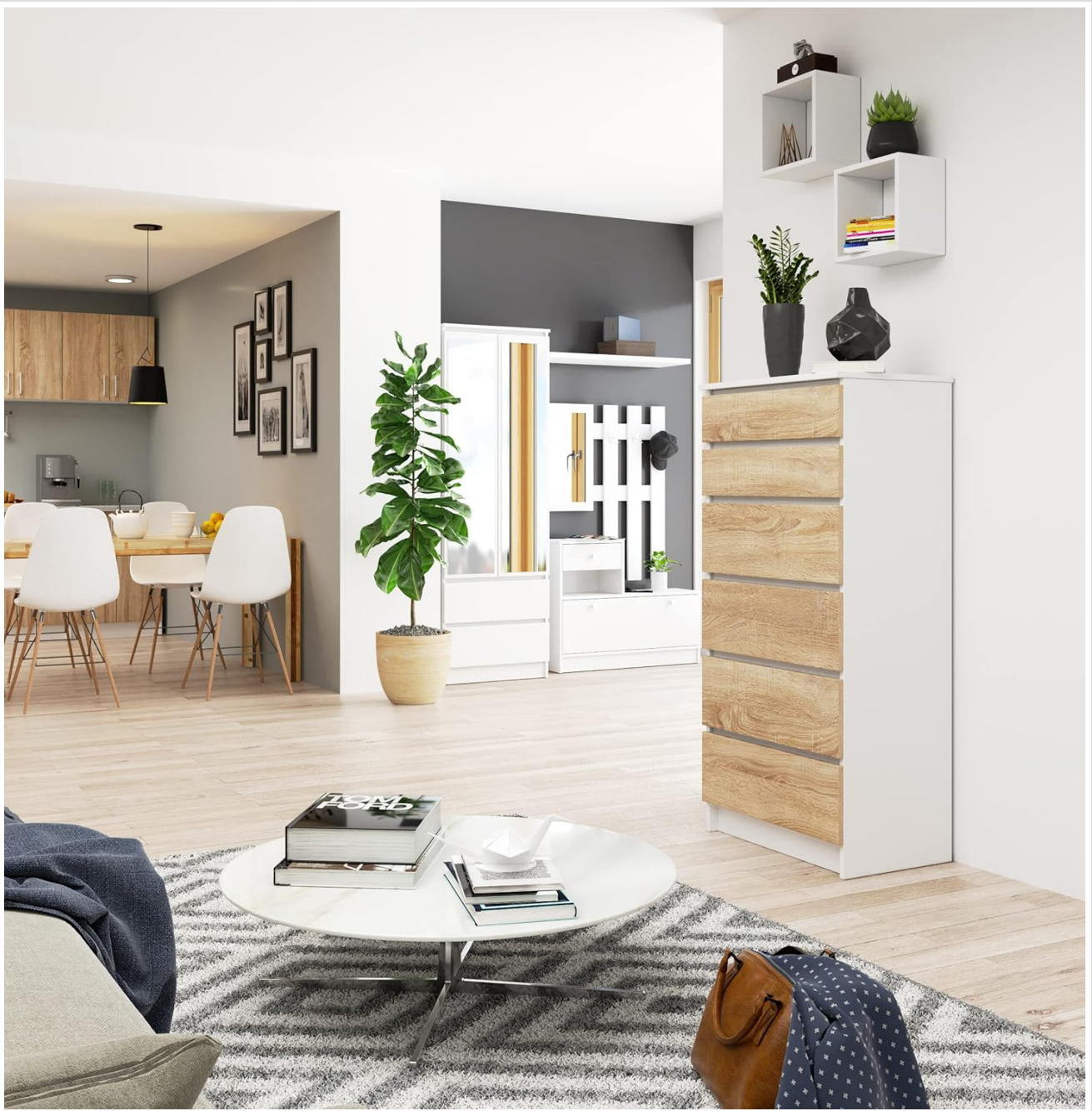
Image 5: The fully assembled AKORD K60 chest of drawers, ready for use.