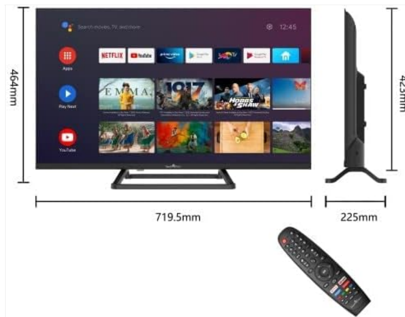
Image 5.1: TV dimensions and an illustration of the remote control.