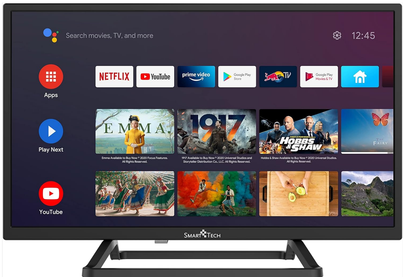
Image 1.1: Front view of the Smart Tech 32HA10V3 TV displaying the Android TV home screen with various streaming applications.