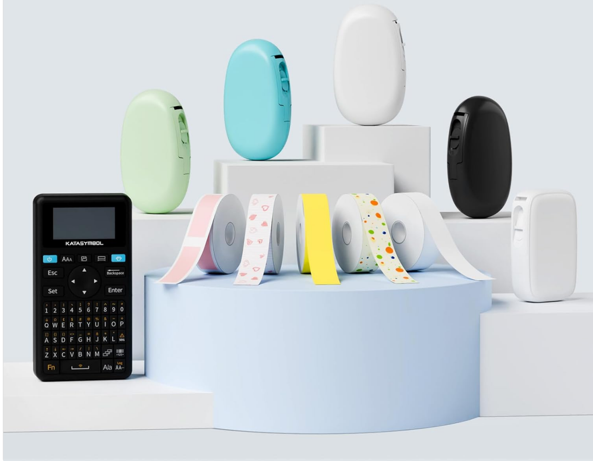
Image: Displays several SUPVAN label makers and a variety of label tape rolls, illustrating product compatibility.