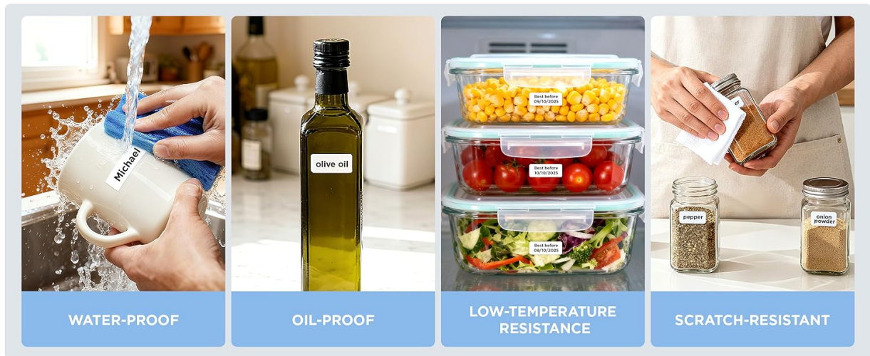
Image: Demonstrates the tape's resistance to water, oil, low temperatures, and scratches, highlighting its robust design.