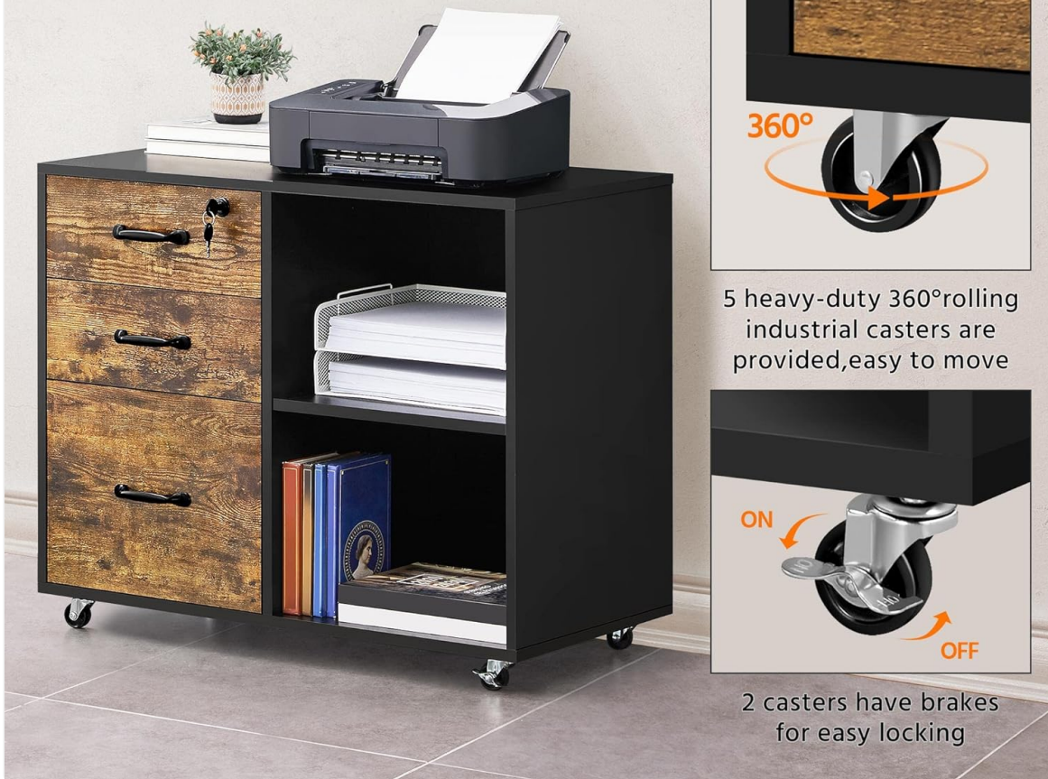
Figure 4: The cabinet features 360-degree rotating industrial casters, two of which are lockable for stability.