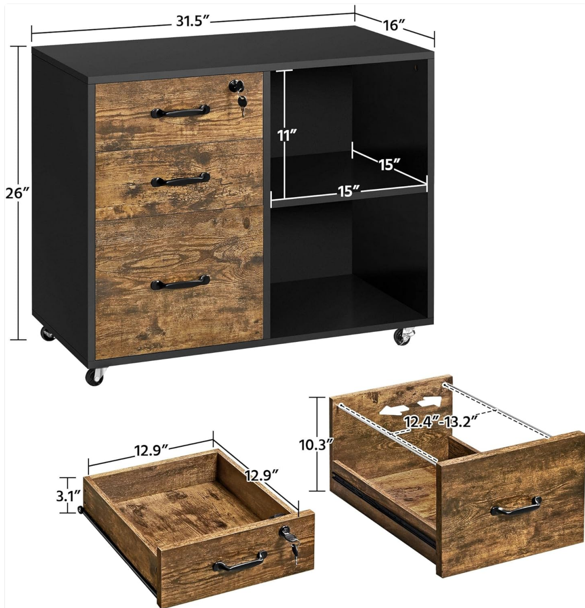
Figure 3: Detailed dimensions of the cabinet and drawers.