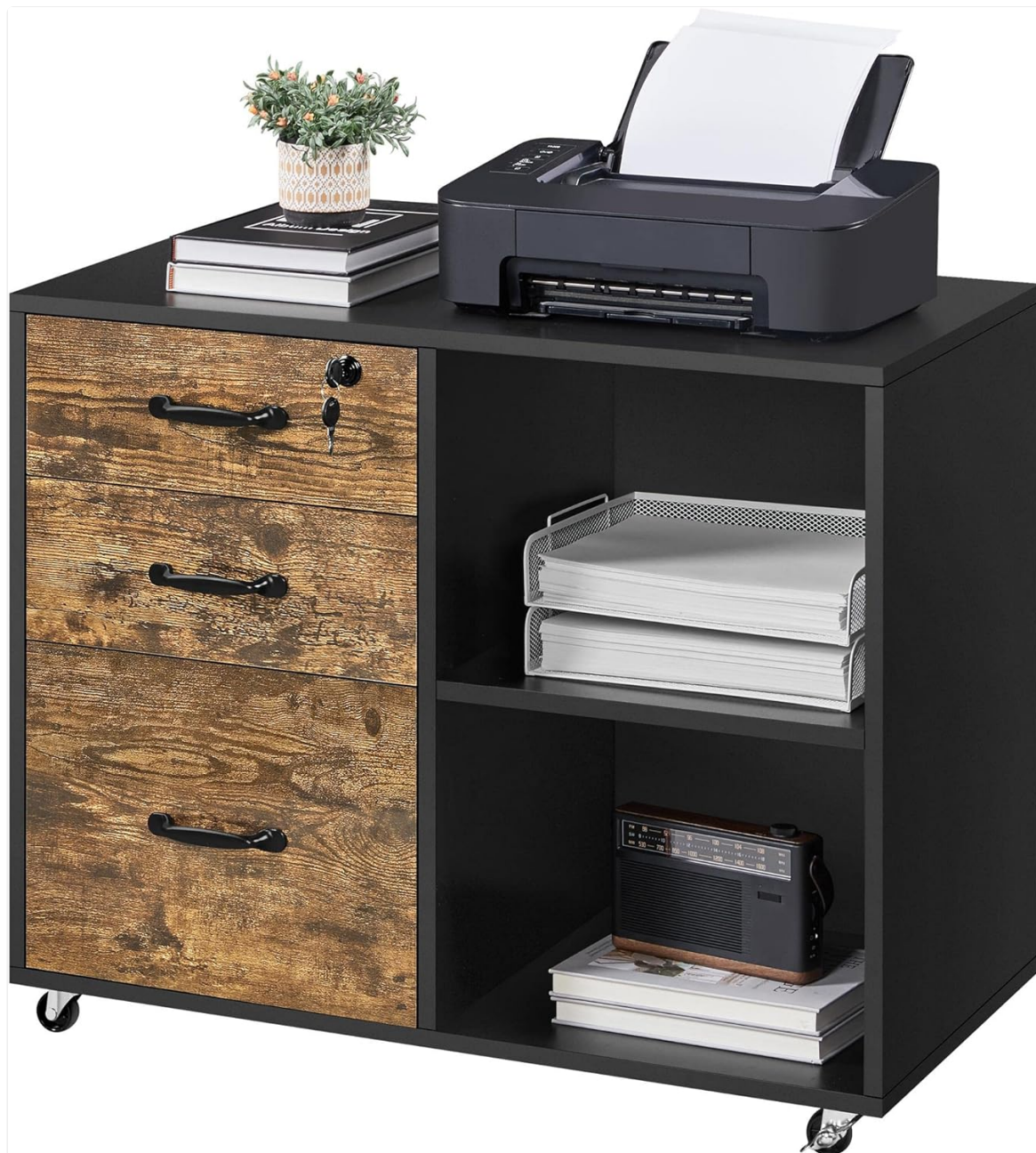
Figure 1: Yaheetech Lateral File Cabinet in a typical office environment.