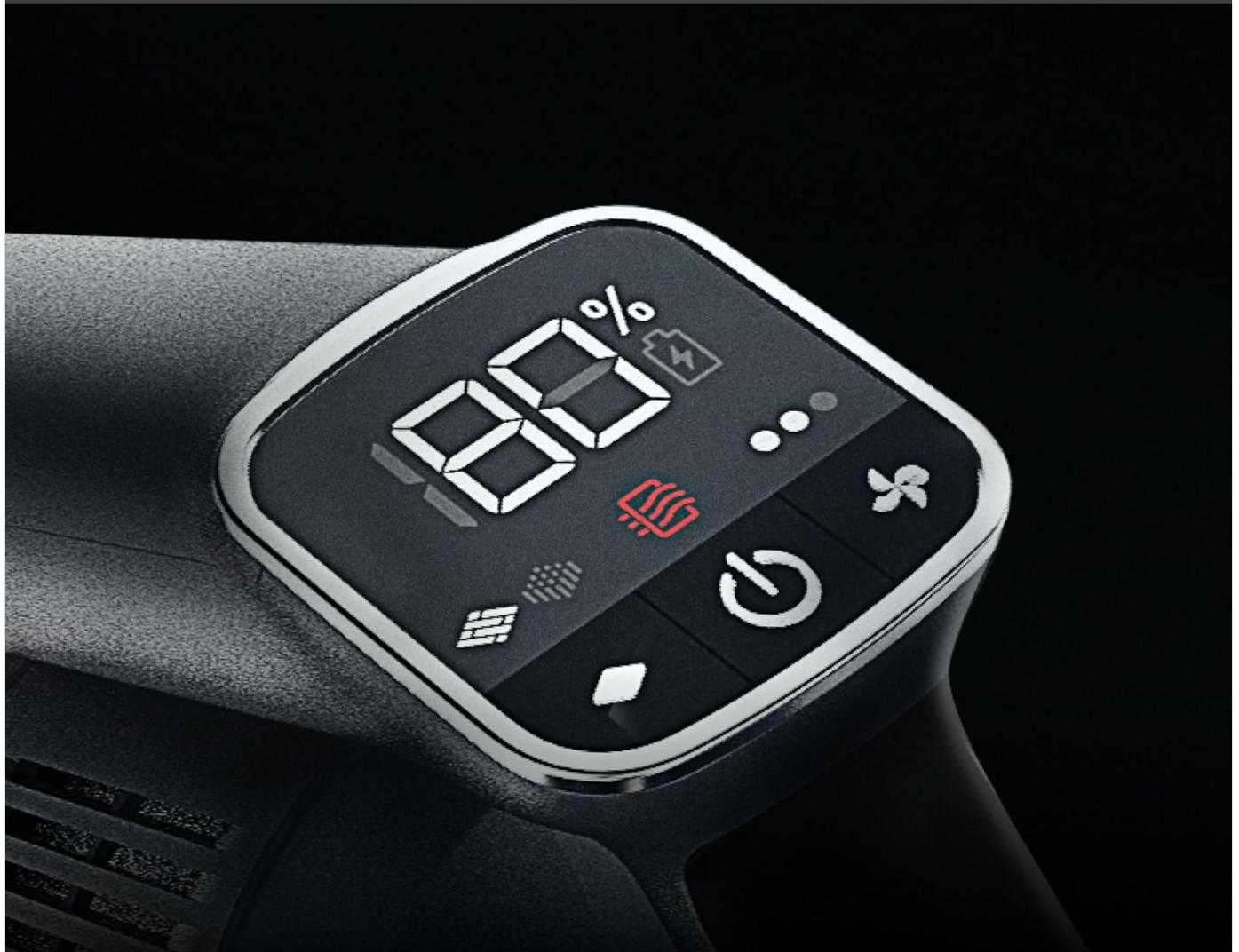
Image: The removable battery being charged, either attached to the vacuum or independently.

Mostra la carica rimanente, il livello di aspirazione e il tipo di superficie selezionata