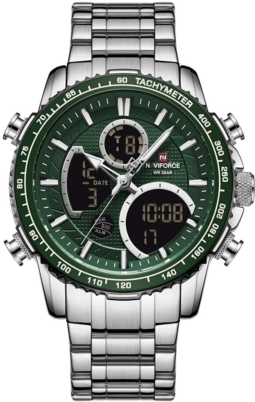
Figure 1: Front view of the NAVIFORCE NF9182-GREEN watch, showcasing its green dial, analog hands, and digital displays.