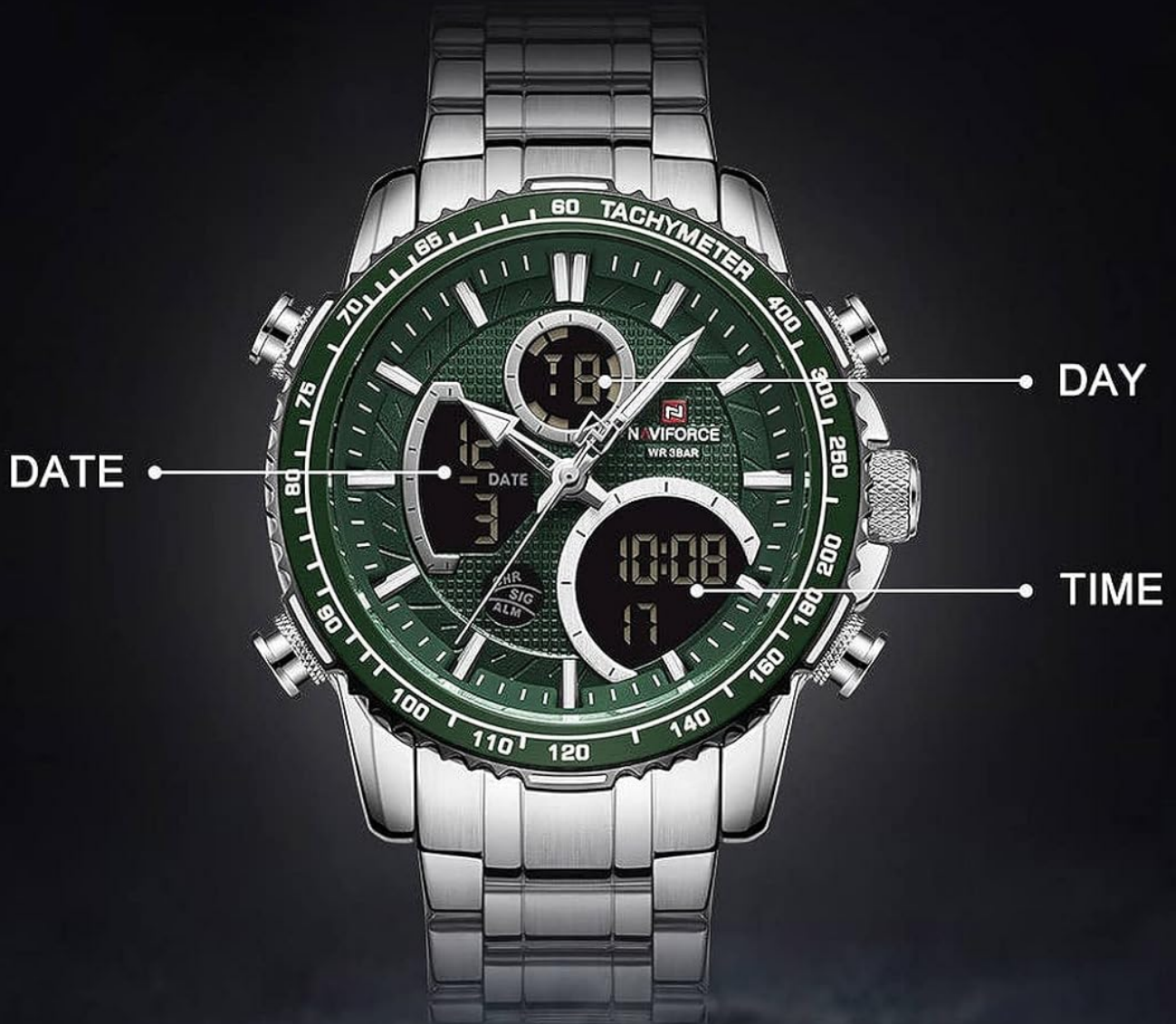
Figure 2: Diagram illustrating the digital display sections for Day, Date, and Time on the watch face.

With following functions Time / Date / Weekly / Chronograph mode / Alarm clock / LED lighting