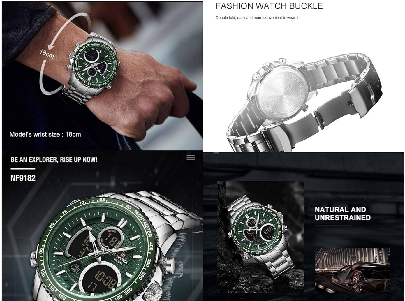
Figure 3: Image showing the watch on a wrist (model's wrist size 18cm) and a close-up of the double-fold watch buckle for secure fastening.

The stainless steel band is adjustable to fit various wrist sizes. If the band is too long, links can be removed by a professional watchmaker or using a watch link removal tool. Ensure the double-fold buckle is securely fastened after adjustment.