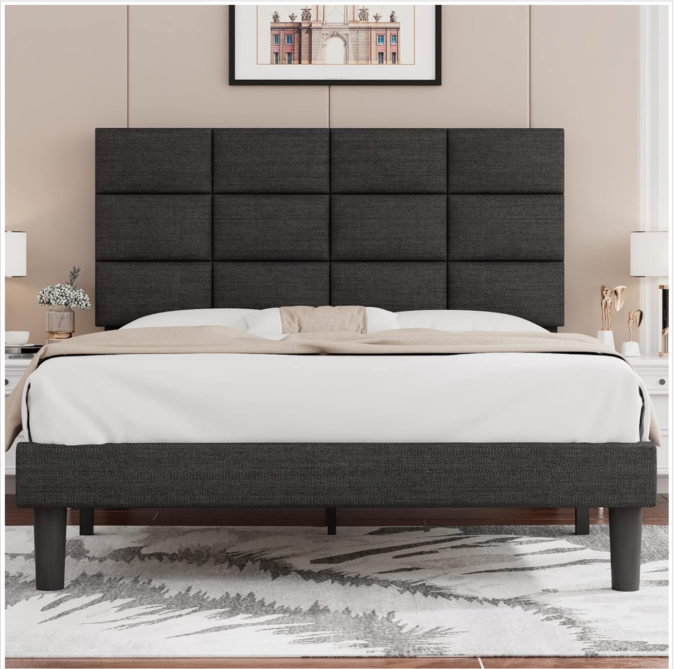
Image: The iPormis Queen Size Upholstered Platform Bed Frame in Dark Grey, fully assembled with a mattress and bedding, showcasing its modern design.