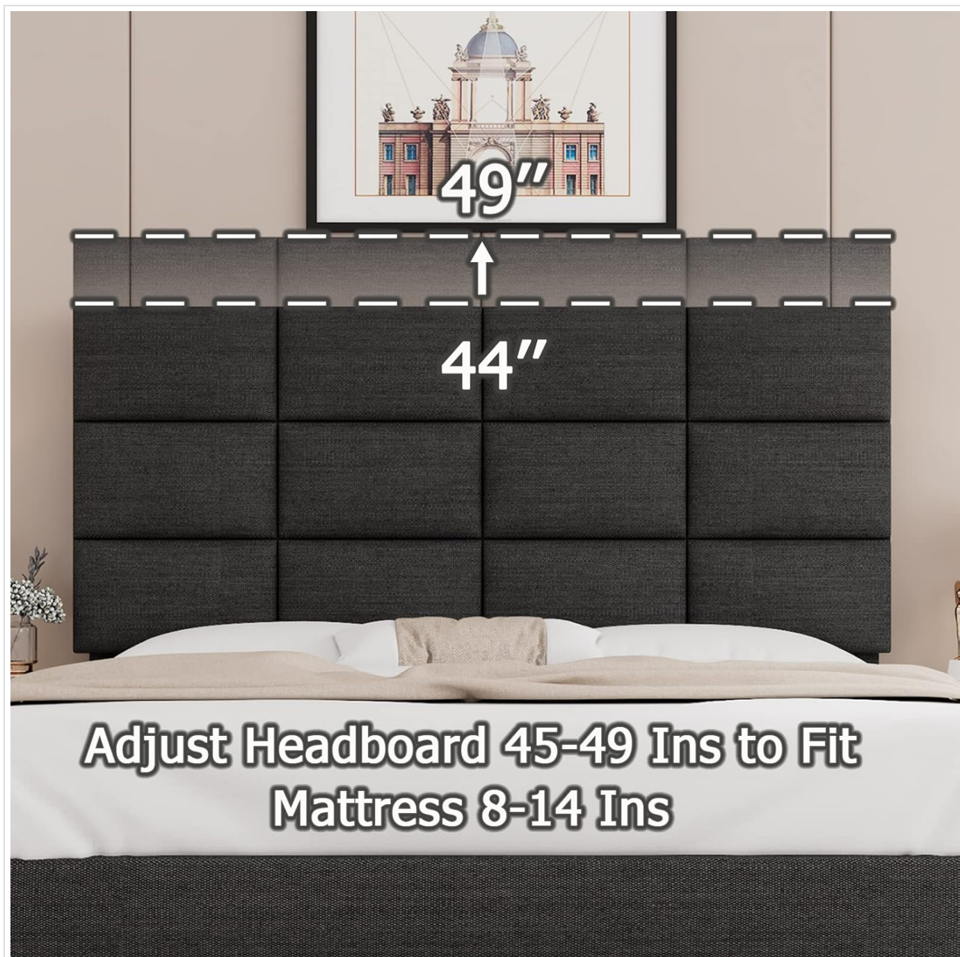
Image: A visual representation demonstrating how the headboard height can be adjusted between 45 and 49 inches to fit mattresses ranging from 8 to 14 inches in thickness.