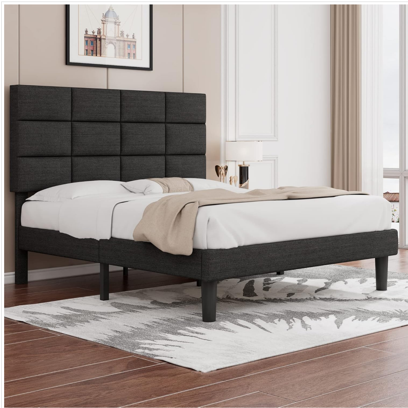
Image: The fully assembled bed frame structure, showing the headboard, side rails, and footboard connected.

tighten all bolts initially. Once all connections are made, fully tighten all bolts with the Allen wrench.