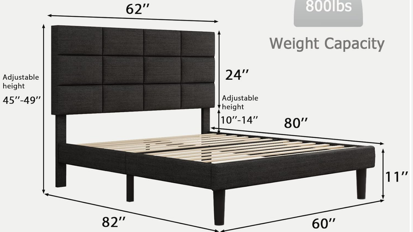
Image: A diagram illustrating the Queen size bed frame's dimensions (82"L x 60"W x 49"H) and its 800 lbs weight capacity.