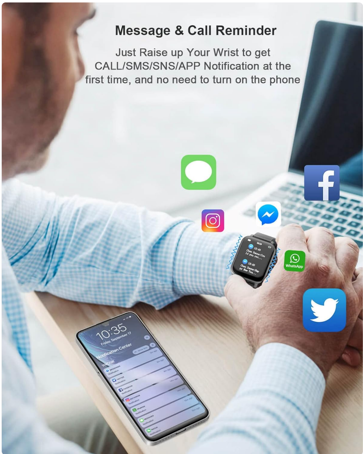
Image: A person wearing the smartwatch, which displays a notification. Various app icons (iMessage, Instagram, Messenger, WhatsApp, Twitter, Facebook) float around, indicating notification support. A smartphone screen in the foreground shows a notification center.

Just Raise up Your Wrist to get CALL/SMS/SNS/APP Notification at the first time, and no need to turn on the phone