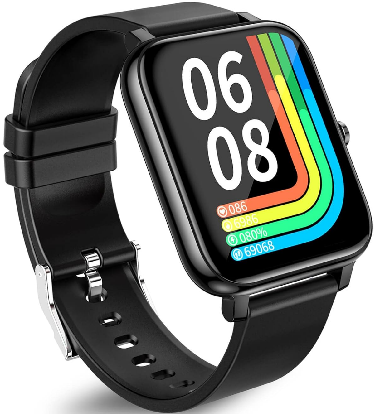
Image: The NiUFFIT P39W Smartwatch, featuring a black strap and a rectangular display showing time and activity metrics.