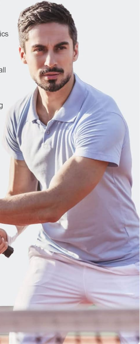
Image: A person holding a tennis racket, wearing the smartwatch. An infographic displays 24 different sports icons, representing the various activity tracking modes available on the device.