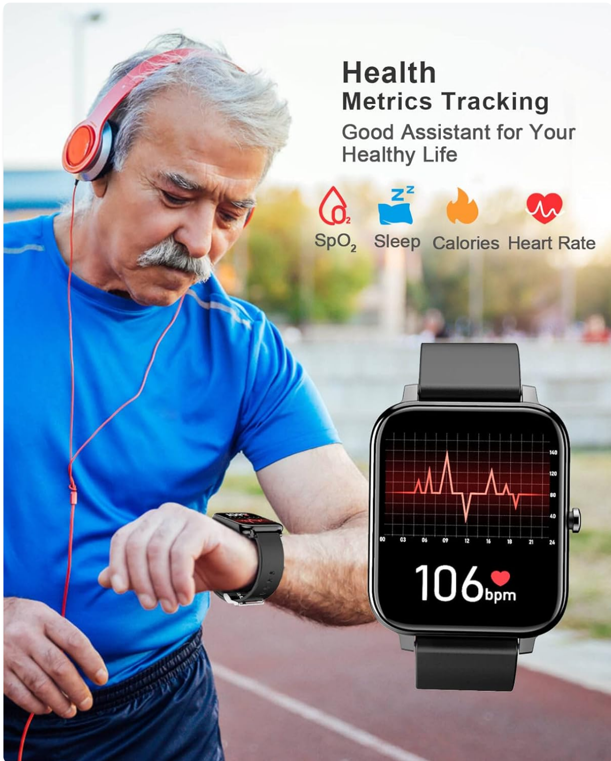
Image: A person wearing the smartwatch during exercise, with the watch displaying a heart rate graph. Icons for SpO 2 , sleep, calories, and heart rate are shown, emphasizing the device's health tracking capabilities.

Access detailed health data and historical trends within the 'GloryFit' app.