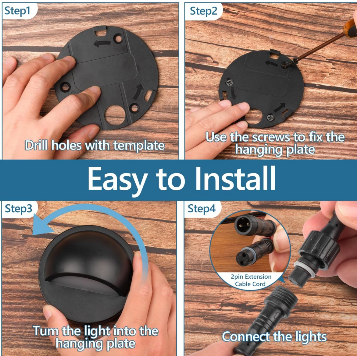
Image: Four-step visual guide demonstrating how to drill holes, fix the hanging plate, attach the light, and connect the wires.

Your browser does not support the video tag. This video demonstrates the easy installation process for the HIBOITEC Garden Post Fence Light.