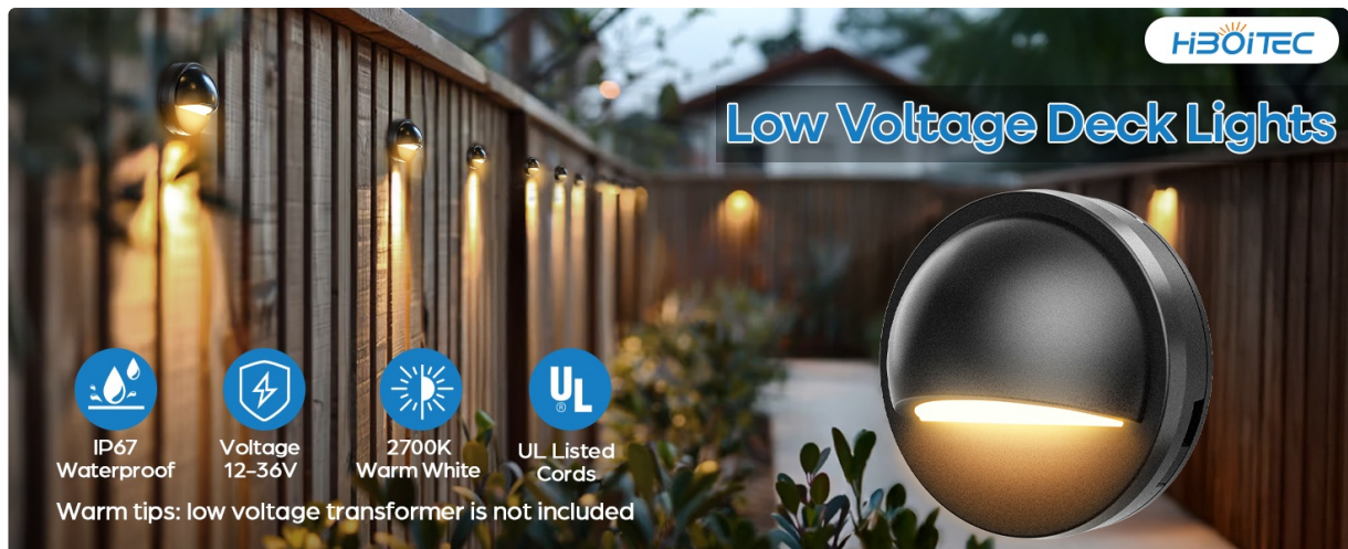
Image: Overview of HIBOITEC Low Voltage LED Deck Lights highlighting key features like low voltage, IP67 waterproof rating, and warm white light.

Thank you for choosing HIBOITEC Low Voltage LED Deck Lights. These 2.5W, IP67 waterproof lights are designed to provide warm white (2700K) accent lighting for various outdoor applications such as decks, steps, stairs, railings, posts, and fences. This manual provides essential information for safe installation, operation, and maintenance of your new lighting system.