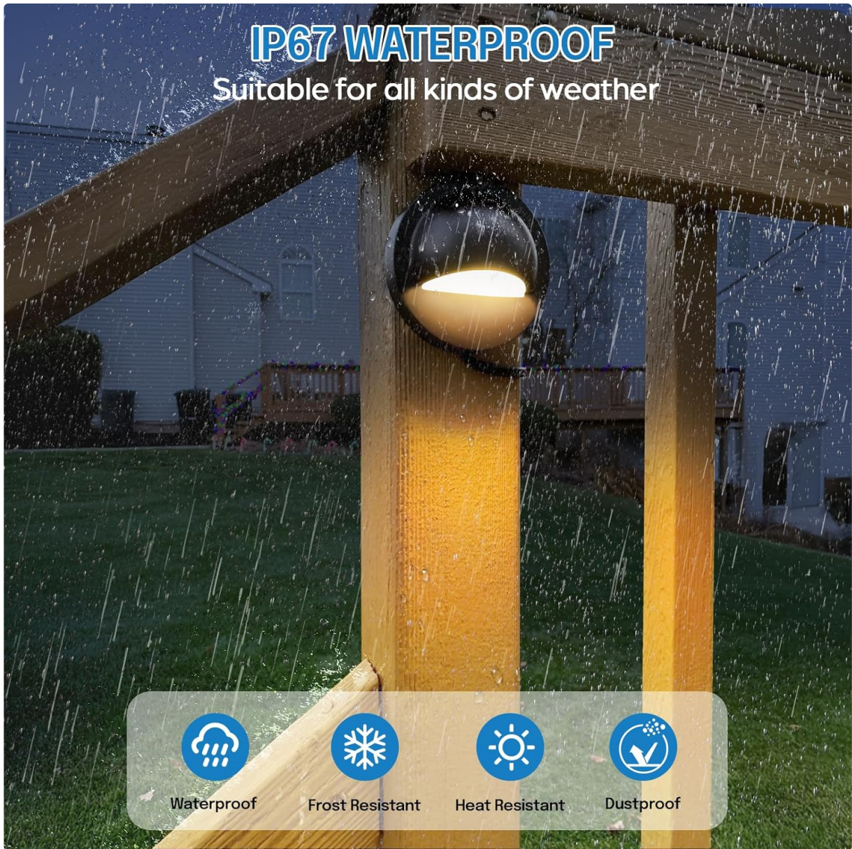
Image: HIBOITEC LED Deck Light demonstrating its IP67 waterproof capability during rainfall.

Your browser does not support the video tag. This video highlights the IP67 waterproof feature of the HIBOITEC Low Voltage LED Deck Lights.