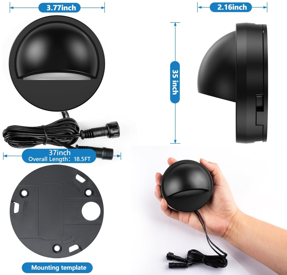
Image: Detailed product dimensions for the HIBOITEC LED Deck Light and its mounting template.