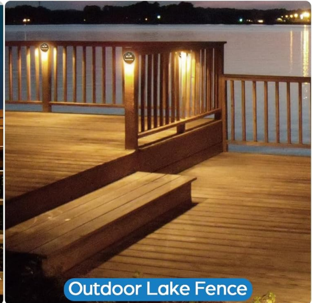
Outdoor Lake Fence