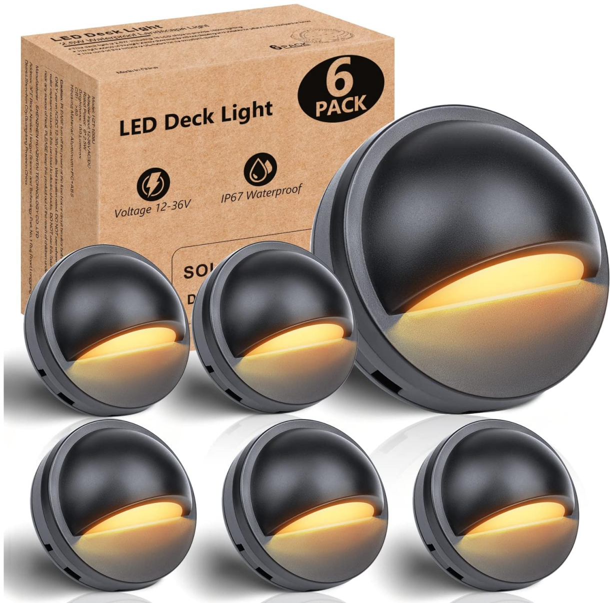
Image: The HIBOITEC LED Deck Light 6-pack showing the lights and packaging.