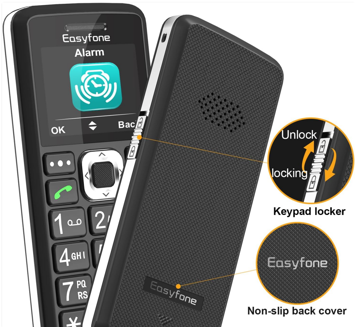
Image: A side profile of the Easyfone T200, highlighting the convenient keypad lock/unlock switch and the textured non-slip back cover for improved grip.