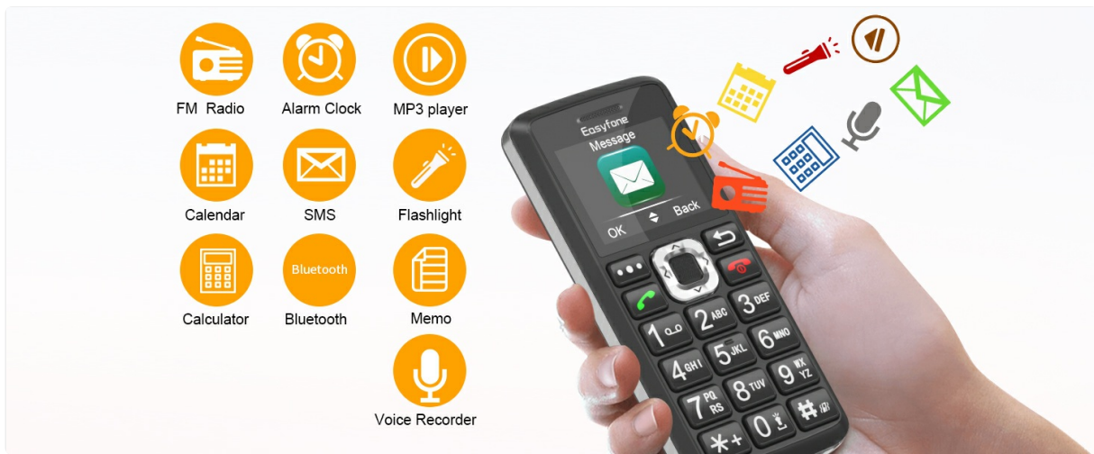
Image: The Easyfone T200 screen surrounded by icons representing its various functions, including FM Radio, Alarm Clock, MP3 Player, Calendar, SMS, Flashlight, Calculator, Bluetooth, Memo, and Voice Recorder.