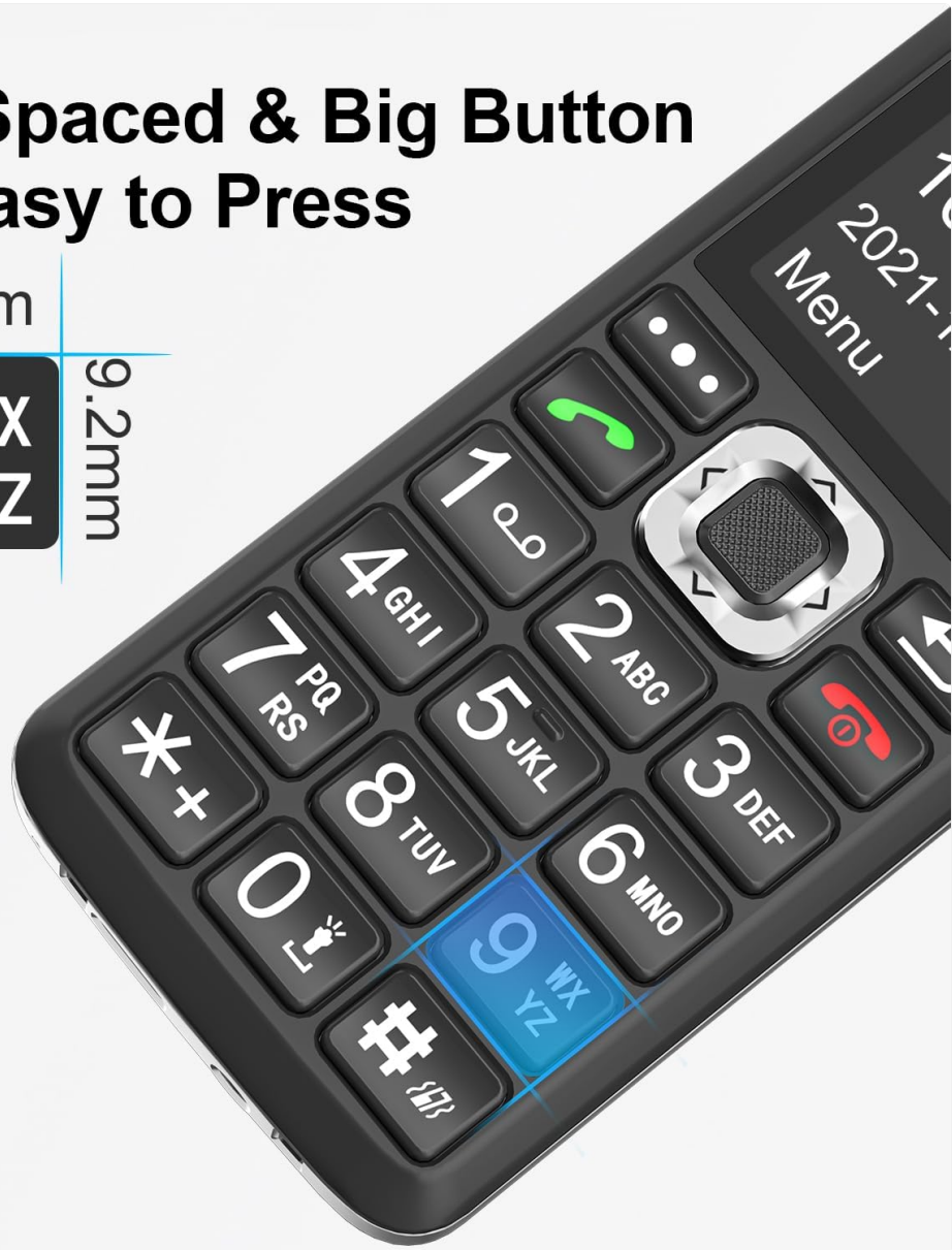
Image: A detailed view of the Easyfone T200 keypad, illustrating the generous size of the buttons (12.8mm by 9.2mm) for easy pressing.