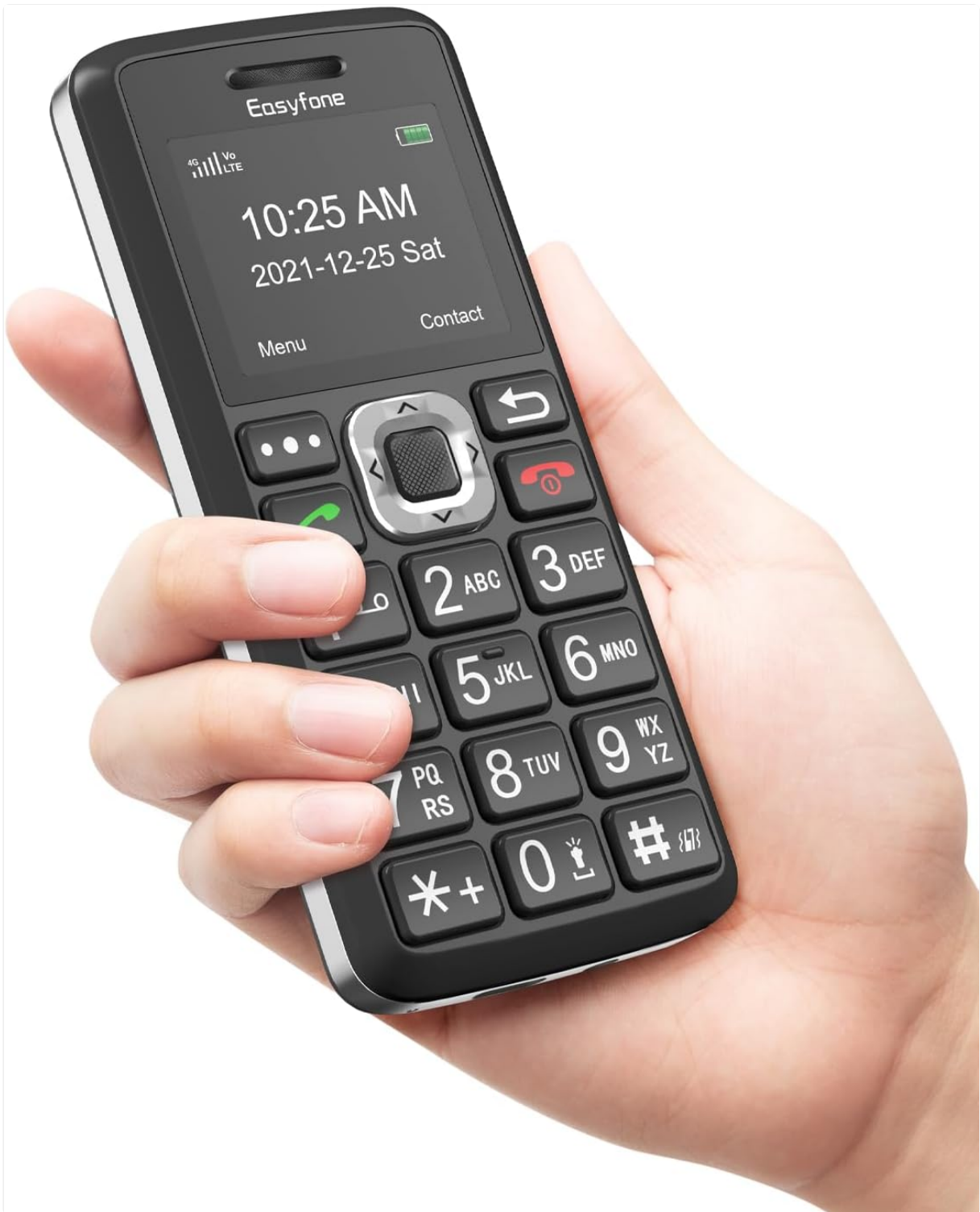
Image: The Easyfone T200 phone, held in a hand, highlighting its user-friendly design with large, well-spaced buttons and a clear screen displaying the time and date.