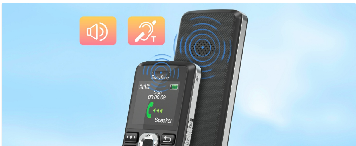
Image: The Easyfone T200 with icons indicating its loud speaker and compatibility with hearing aids, ensuring clear audio for users.