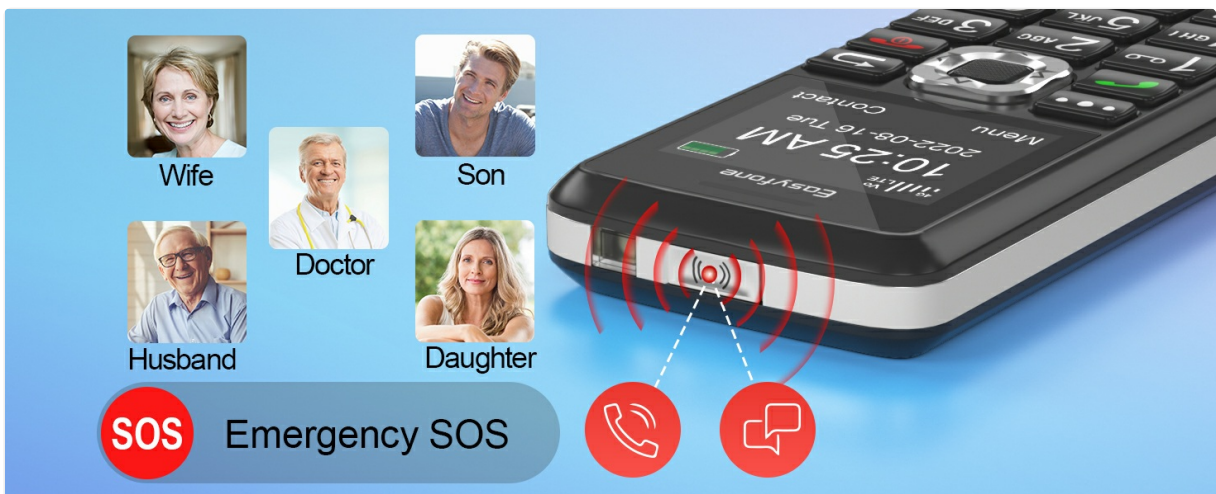
Image: The Easyfone T200 illustrating the SOS Emergency function, showing how it triggers both emergency calls and messages to pre-selected contacts.