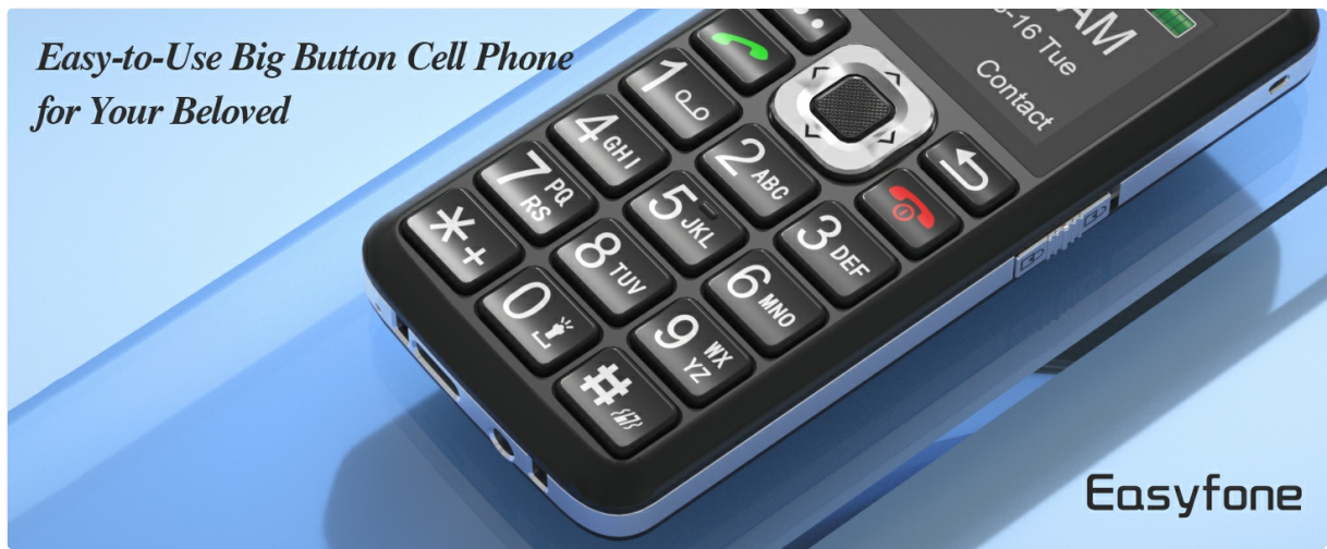
Image: A banner displaying the Easyfone T200, emphasizing its design as an easy-to-use big button cell phone.