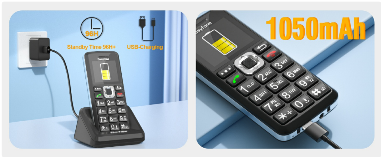
Image: The Easyfone T200 being charged both in its dedicated dock and directly via USB, emphasizing its long standby time of over 96 hours.