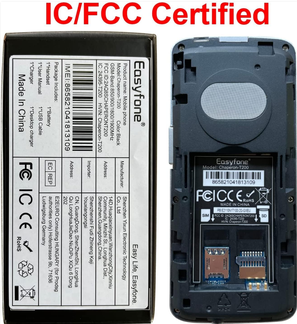
Image: The rear view of the Easyfone T200 with the back cover removed, illustrating the battery compartment, SIM card slots, and MicroSD card slot for installation.