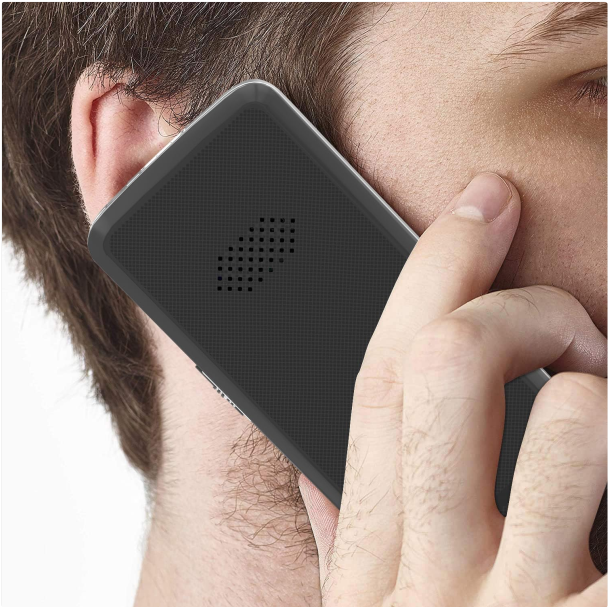
Image: A person holding the Easyfone T200 to their ear, demonstrating its use for making or receiving calls.