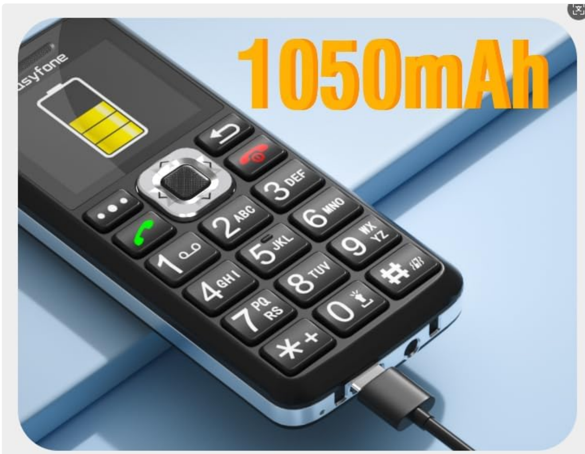
Image: The Easyfone T200 connected for charging via a USB cable, with an overlay indicating its 1050mAh battery capacity.

A full charge takes approximately 2.5 hours. The 1050mAh battery provides up to 6 hours of talk time and 96 hours of standby time.