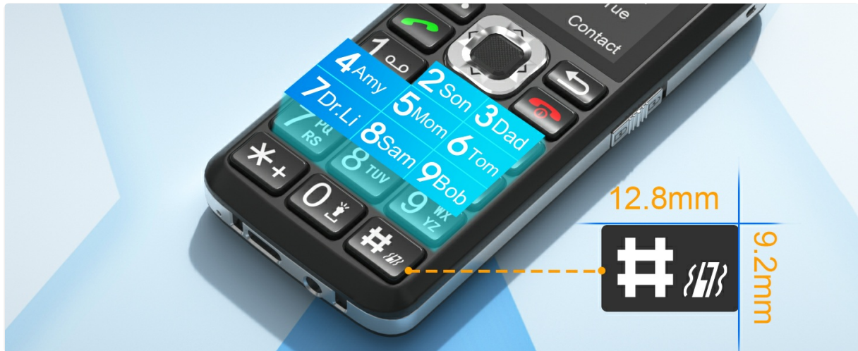
Image: The Easyfone T200 keypad demonstrating the speed dial feature, with numbers 2 through 9 assigned to specific contacts like 'Amy', 'Son', 'Dad', 'Dr.Li', 'Mom', 'Tom', 'Sam', and 'Bob'.