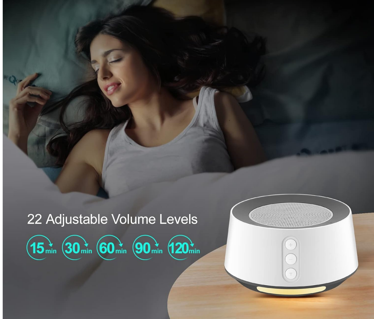
The Kipcush K1 White Noise Machine highlighting its adjustable timer settings (15, 30, 60, 90, 120 minutes) and 22 volume levels, shown next to a person sleeping peacefully.