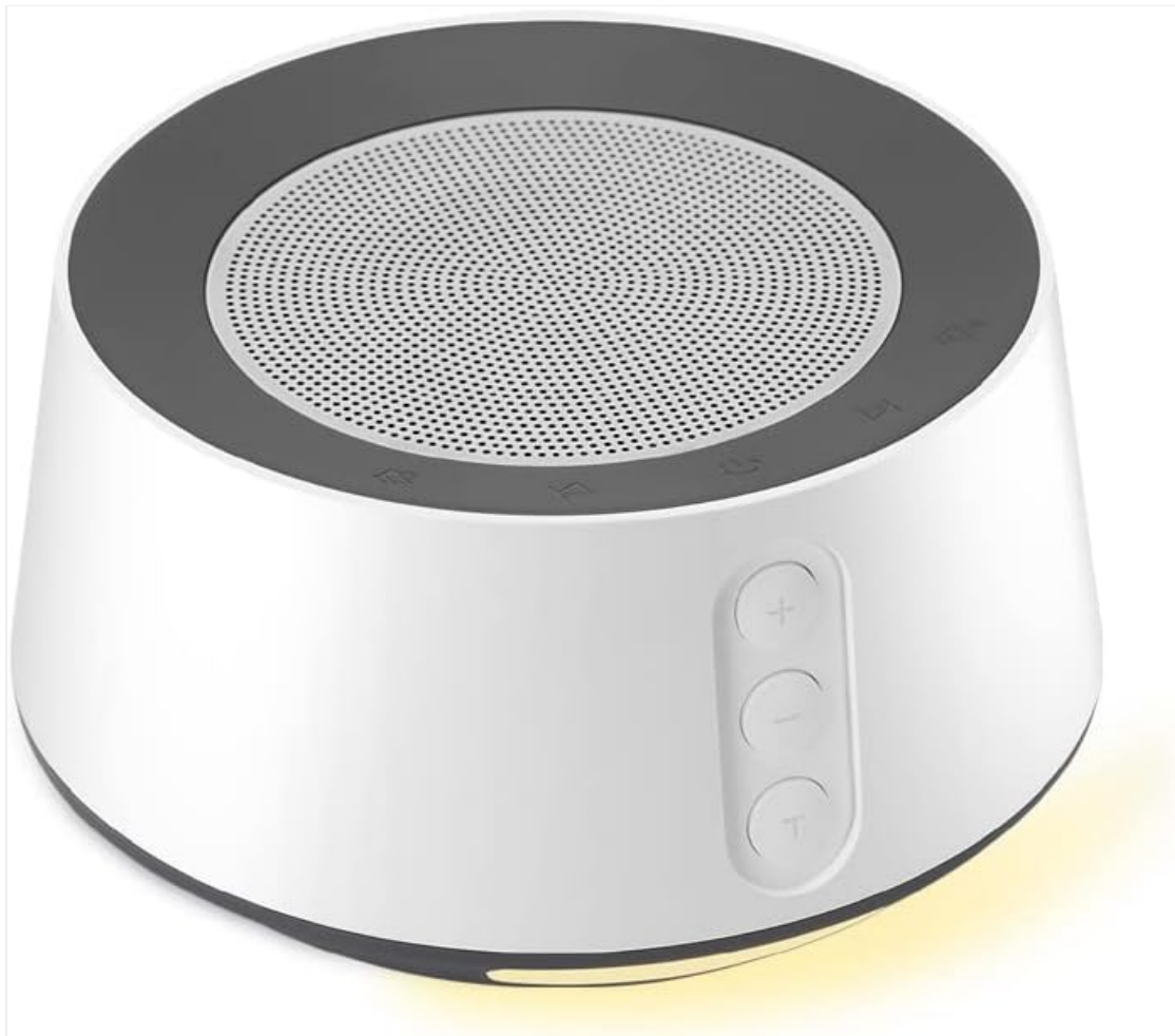
Front view of the Kipcush K1 White Noise Machine, showcasing its compact design and top speaker grille.