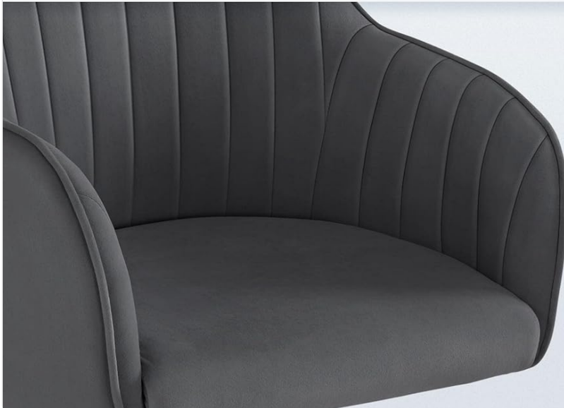
Image: Detail of the chair's thick, high-density foam cushion and the curved, ergonomic armrest, emphasizing comfort and material quality.