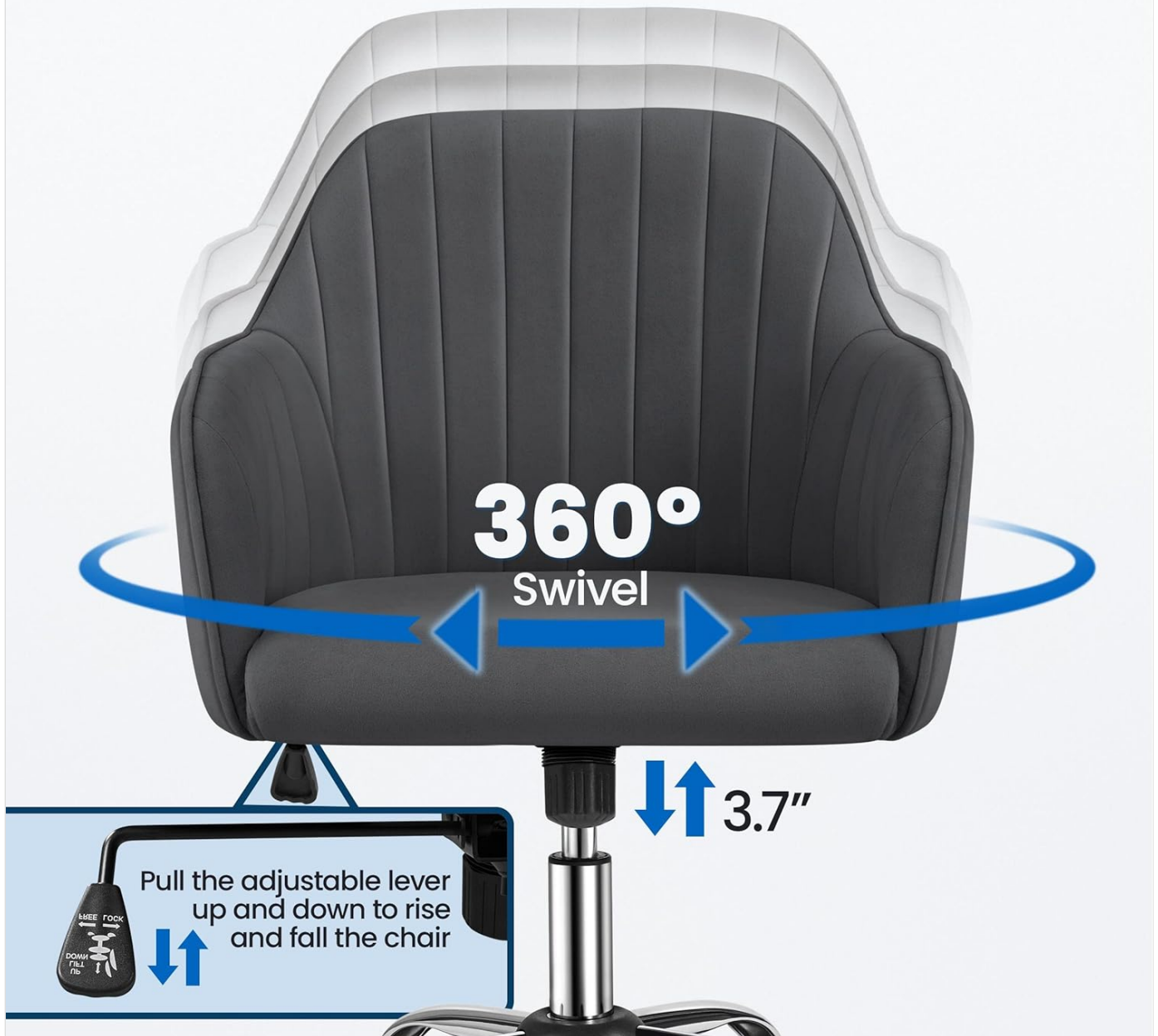
Image: Illustration demonstrating the height adjustment lever and the 360-degree swivel capability of the chair.