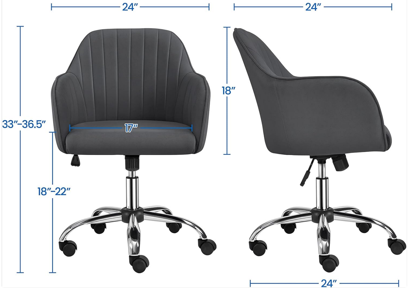
Image: Detailed diagram showing the key dimensions and the 300lb weight capacity of the chair.