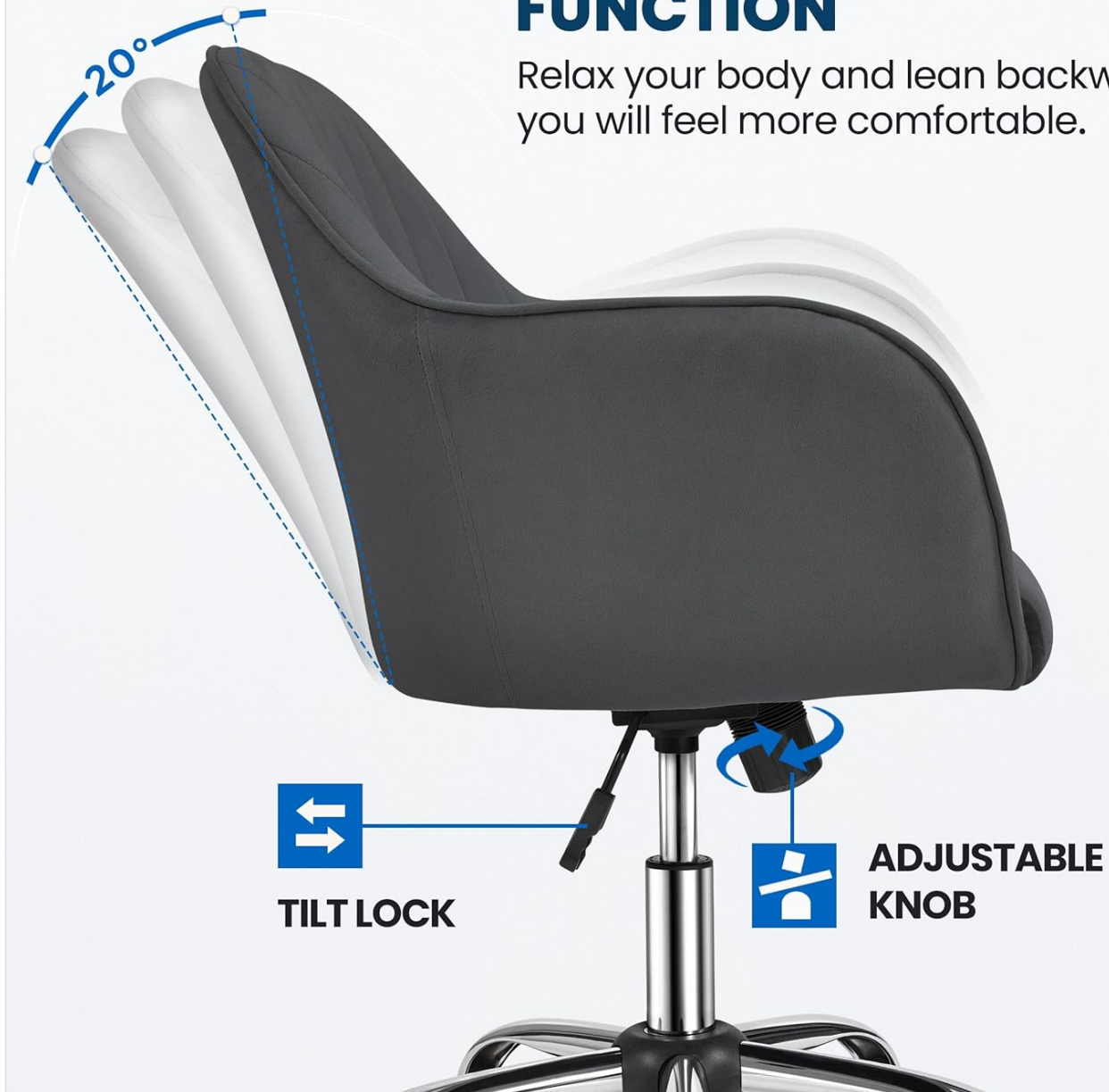
Image: Diagram illustrating the 20-degree tilt function, tilt lock lever, and adjustable tension knob for the chair's recline.

Relax your body and lean backward, you will feel more comfortable.