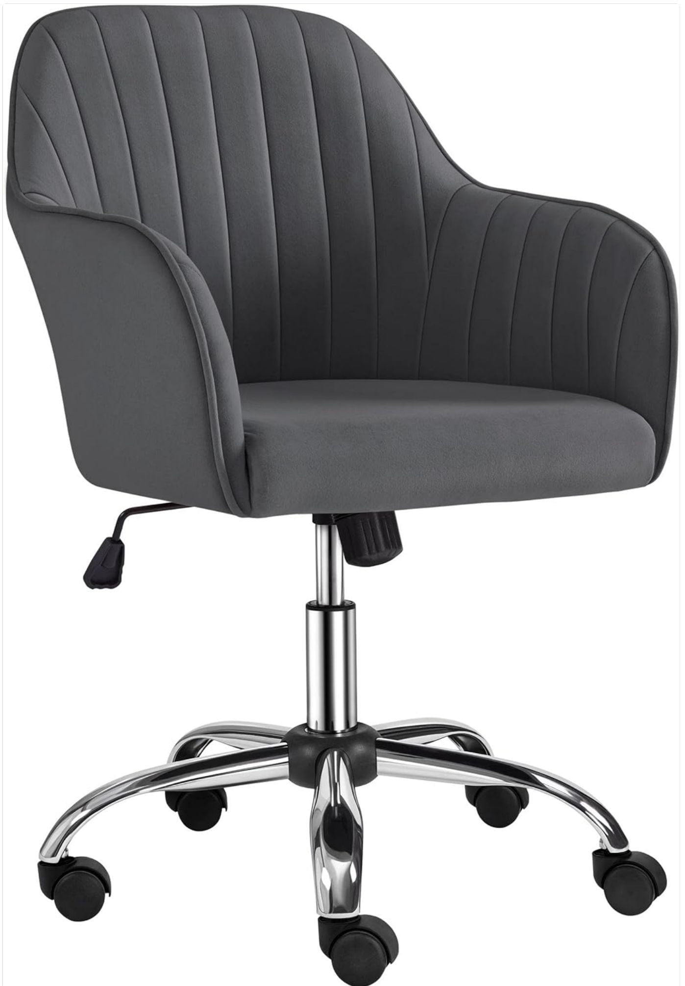
Image: The Yaheetech Modern Office Desk Chair in dark gray velvet, showcasing its elegant design and rolling base.