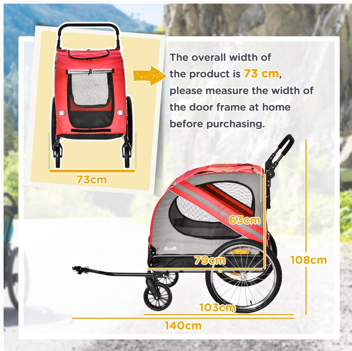
Image: A detailed diagram illustrating the various dimensions of the PawHut dog trailer and stroller in both configurations.