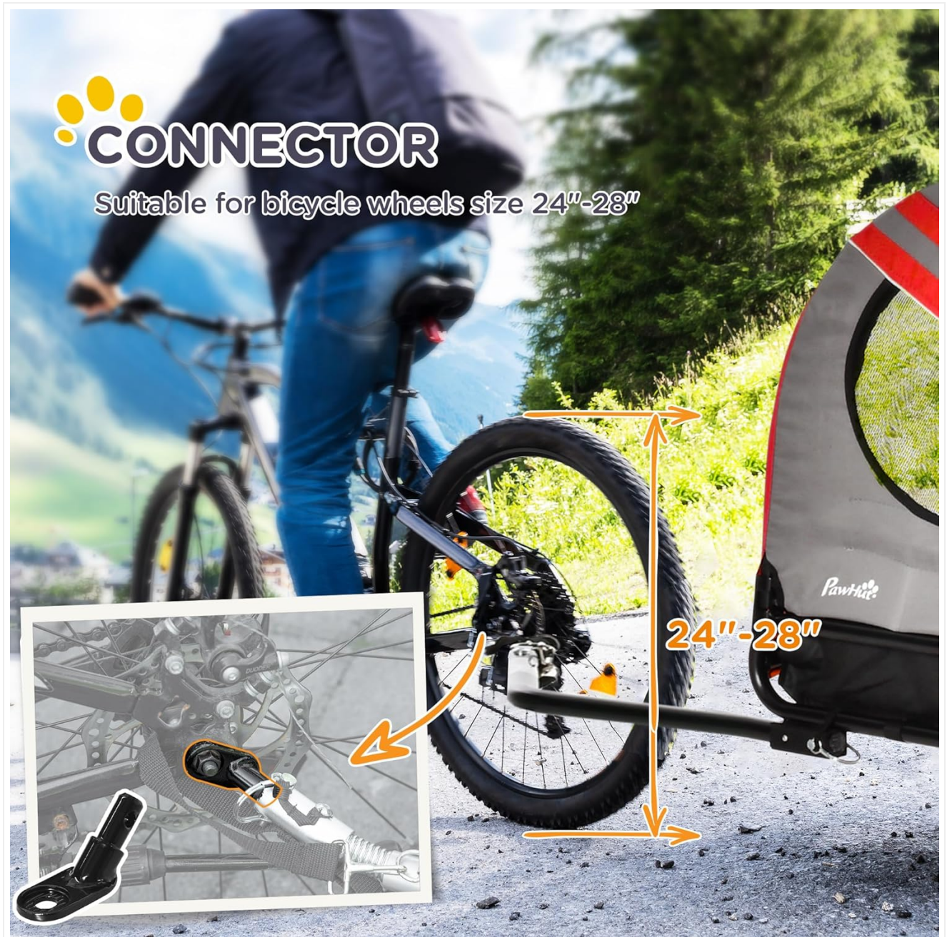
Image: Detail of the hitch connector that attaches the trailer to a bicycle's rear wheel axle. Suitable for bicycle wheel diameters between 24" and 28".