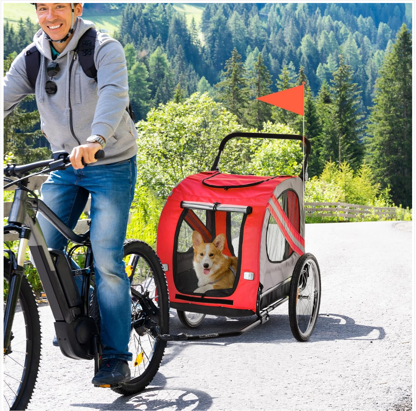
Image: A person riding a bicycle with the PawHut dog trailer attached, carrying a dog, demonstrating its use as a bike trailer.