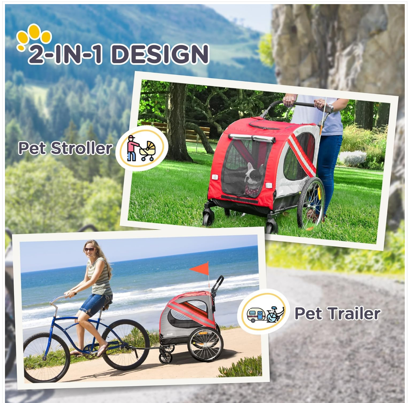
Image: Demonstrates the product's dual functionality as both a pet stroller and a pet trailer.