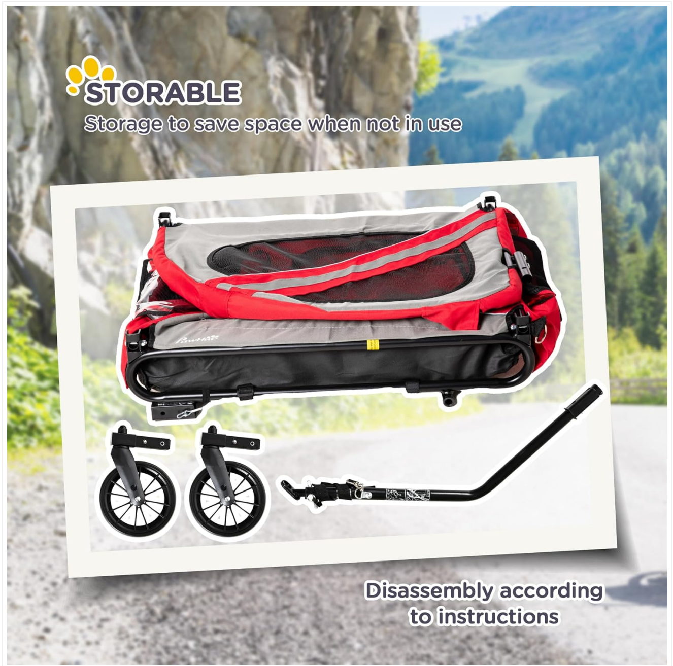
Image: The dog trailer folded flat with its quick-release wheels and hitch arm detached, illustrating its compact storage capability.