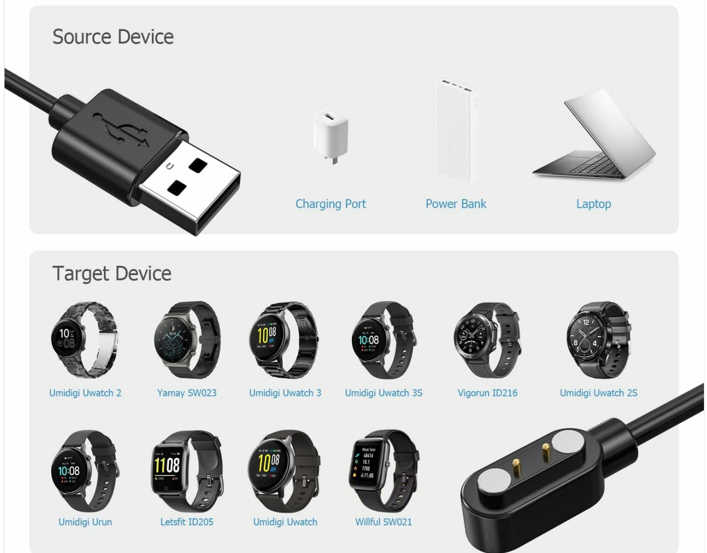
Image: A visual representation of compatible smartwatch models and various power sources such as USB wall adapters, power banks, and laptops, illustrating the versatility of the charger.