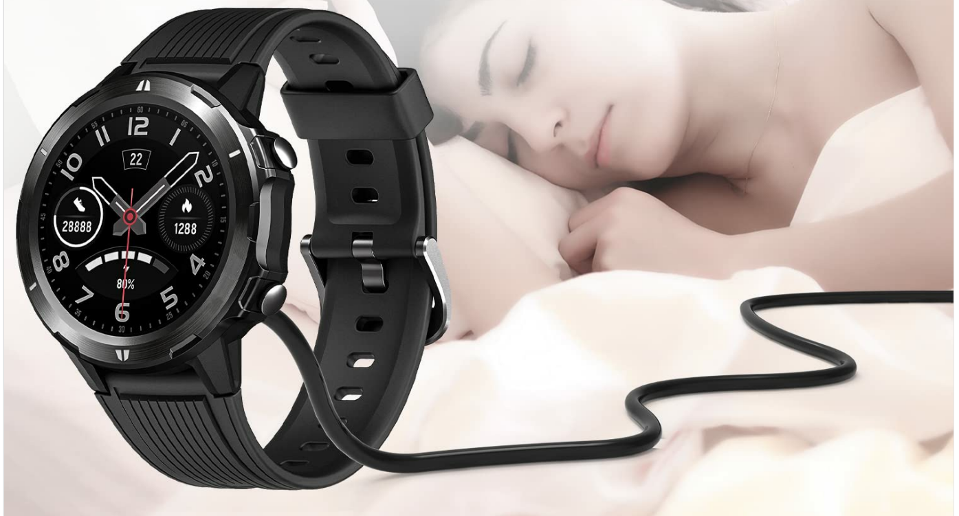
Image: A visual demonstrating the charger's capability for safe overnight charging, accompanied by icons representing its built-in protections against over-charging, short-circuits, and excessive temperatures.