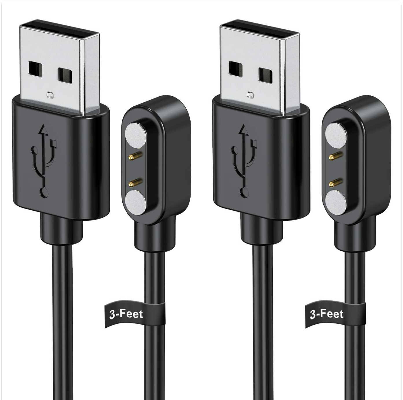
Image: Two Ancable Smart Watch Chargers, featuring black cables with magnetic charging ends and standard USB-A connectors. Each cable is approximately 3.3 feet long.