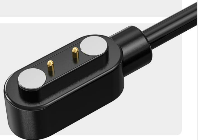
Image: An illustration detailing the reinforced design of the charging cable, showcasing its multi-layer shielding for enhanced stability, flexible PVC outer layer for durability and ease of use, and pure copper probe for rapid and stable electrical conduction.