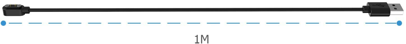
Image: A diagram illustrating the compact size and 1-meter (approximately 3.3-feet) length of the charging cable, emphasizing its portability and convenience for daily use or travel.