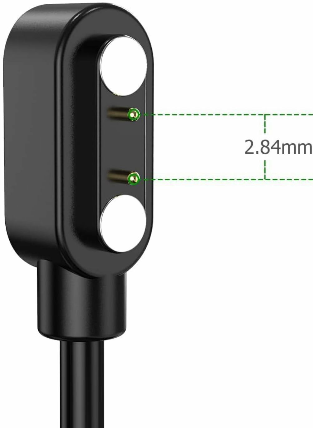
Image: A detailed view of the charger's magnetic contact points, highlighting the critical 2.84mm distance between the two charging pins. This measurement is essential for ensuring compatibility with your smartwatch.

Beachten Sie, dass der Stiftabstand 2,84 mm beträgt, bitte bestätigen Sie vor dem Kauf