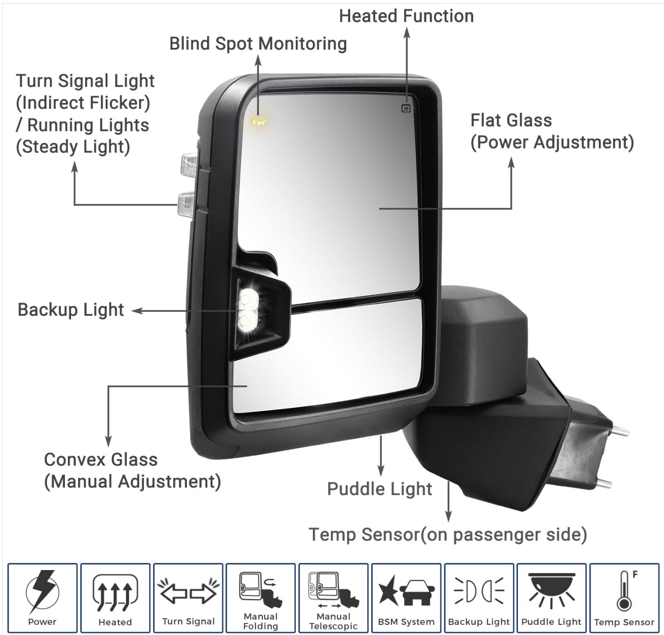
Figure 2: Detailed Feature Overview of the Towing Mirror