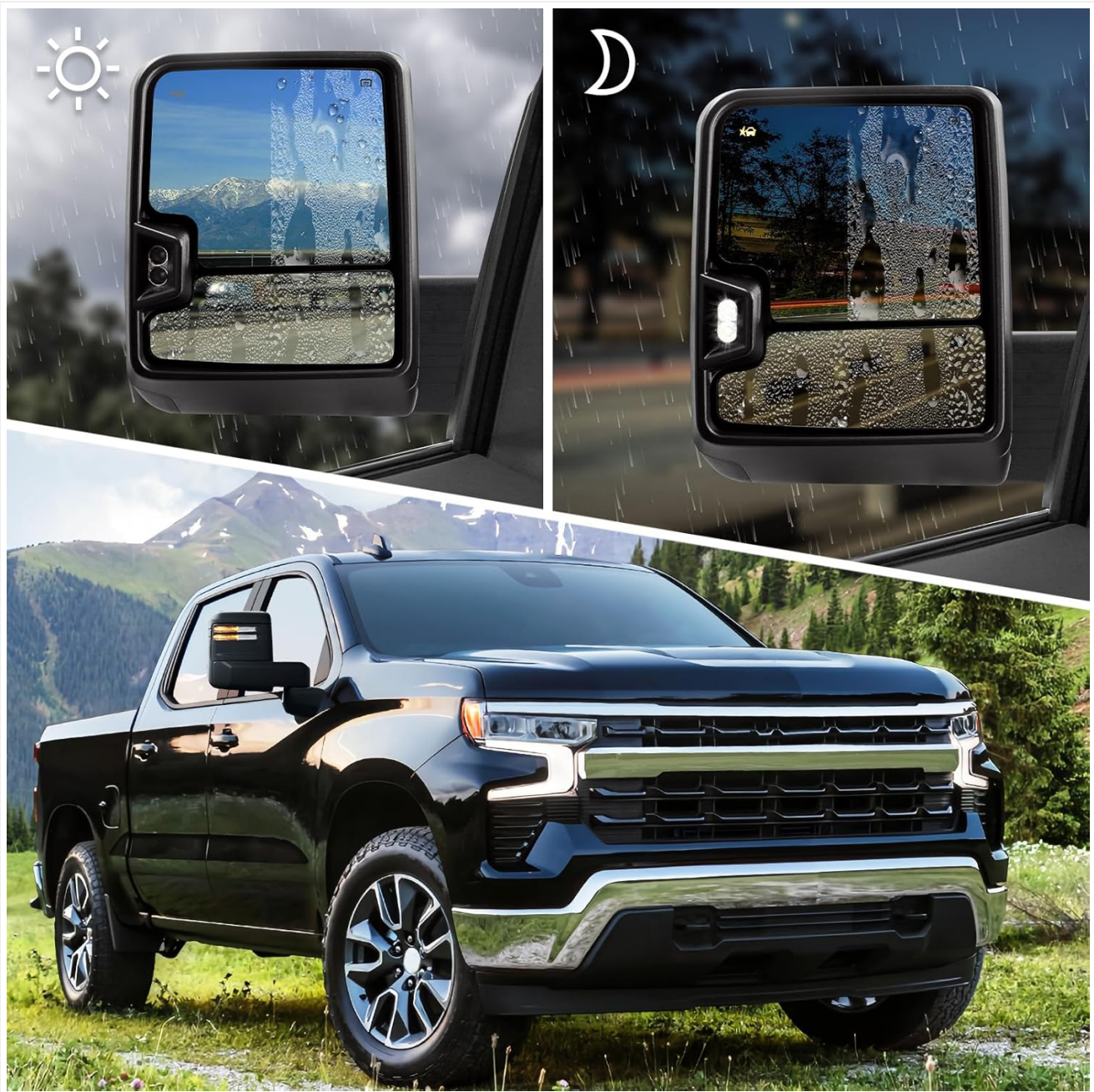
Figure 5: Heated Defrost Function in action

The heated defrost function helps to clear frost, ice, and condensation from the mirror surface. This feature is typically activated via a button or control within your vehicle's cabin, often integrated with the rear defroster. Ensure this function is enabled in cold or humid conditions for clear visibility.