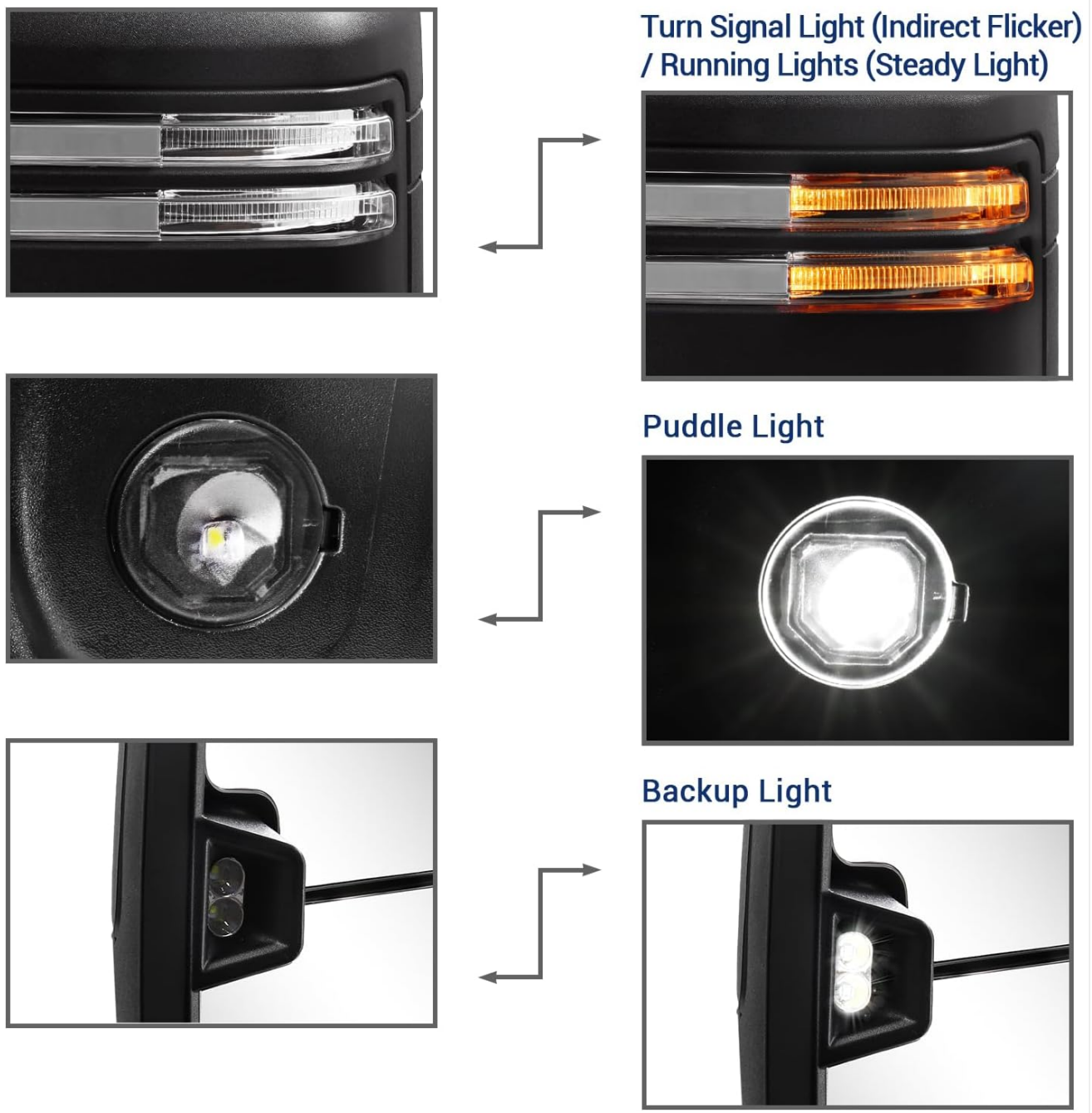
Figure 6: Integrated Lighting Features