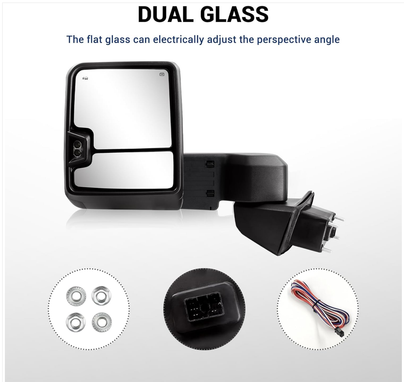
Figure 4: Dual Glass System with Power and Manual Adjustment

The lower convex glass provides a wider field of view to minimize blind spots. This glass is manually adjustable. Gently push the glass to achieve your desired angle.