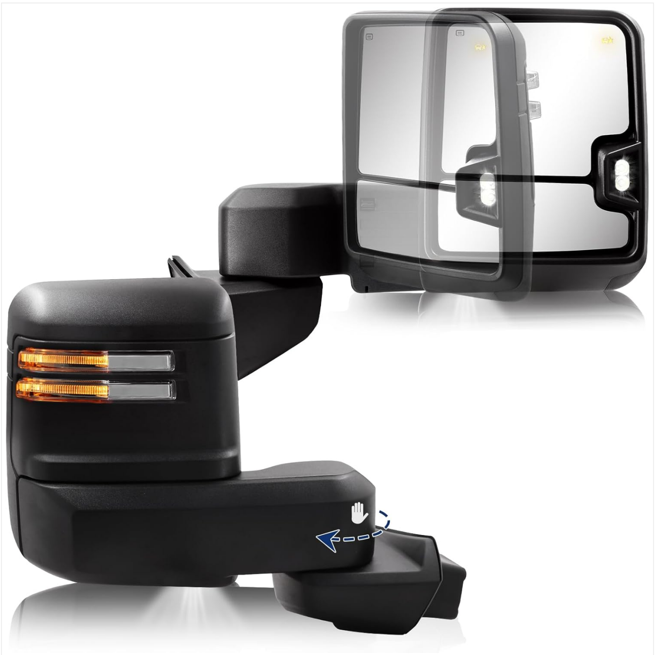
Figure 1: Sanoer Towing Mirrors (Left and Right Pair)