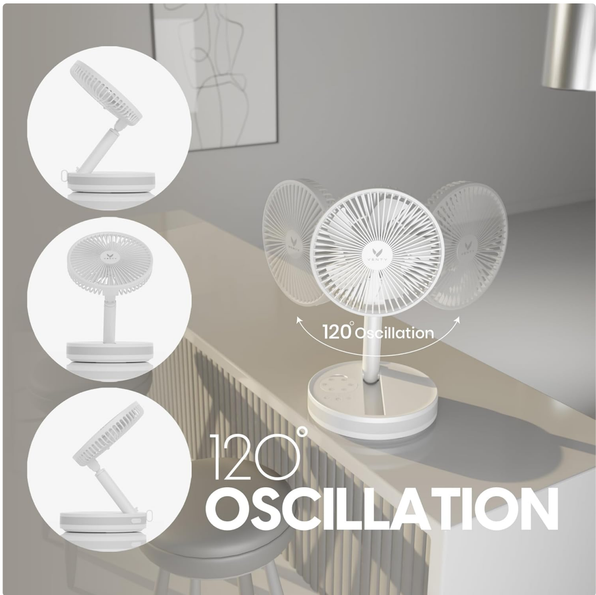
Image: The fan oscillating 120 degrees, showing its range of motion for broader air circulation.