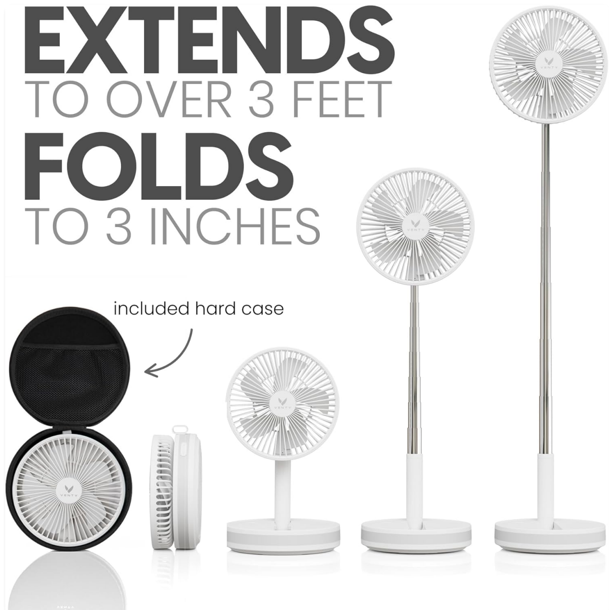
Image: Visual representation of the fan's extendable pole and compact folding mechanism, highlighting its portability with the included hard case.

EXTENDS TO OVER 3 FEET FOLDS TO 3 INCHES