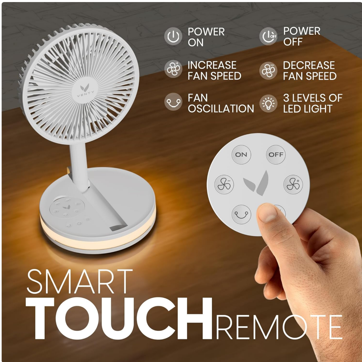
Image: Detailed view of the fan's control panel on the base and the corresponding remote control, showing buttons for power, speed, oscillation, and light.