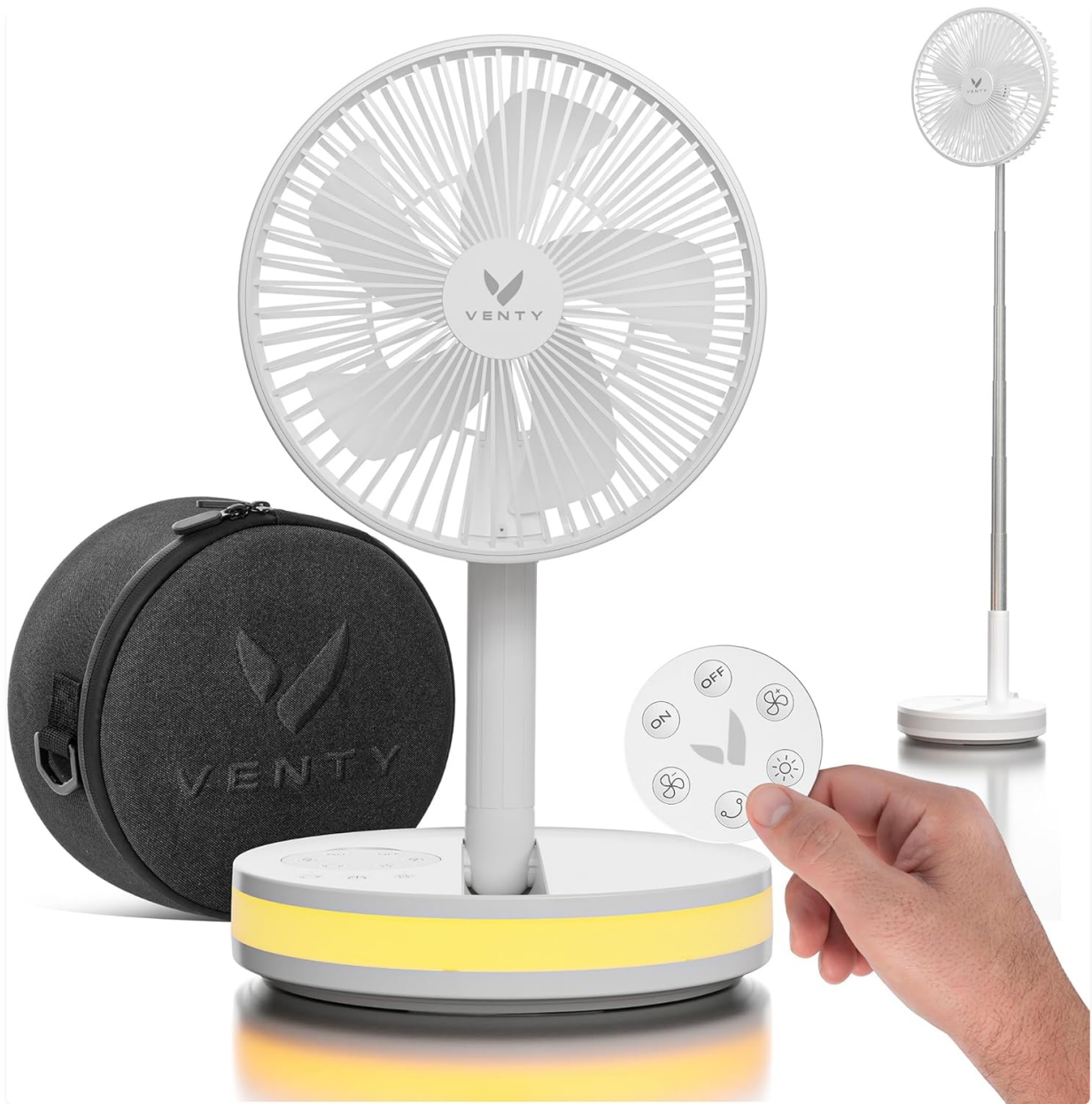
Image: The VENTY Portable Fan shown in both its compact, folded state with its protective carry case, and fully extended, demonstrating its remote control and integrated LED light ring.