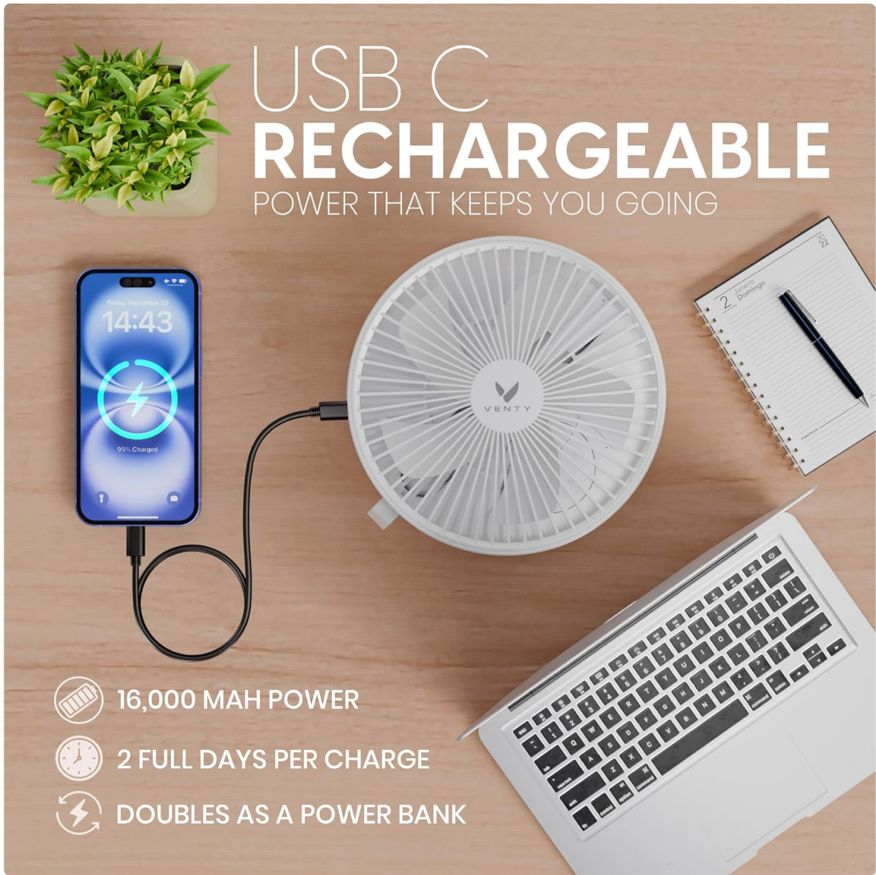
Image: The fan's USB-C port being used to charge a smartphone, demonstrating its dual function as a power bank.