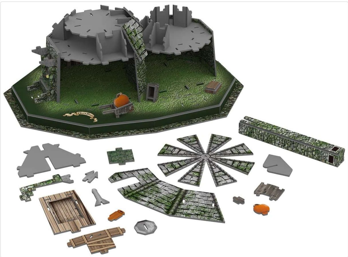
Various unassembled puzzle pieces laid out on a surface, demonstrating the foam material and printed details ready for assembly.