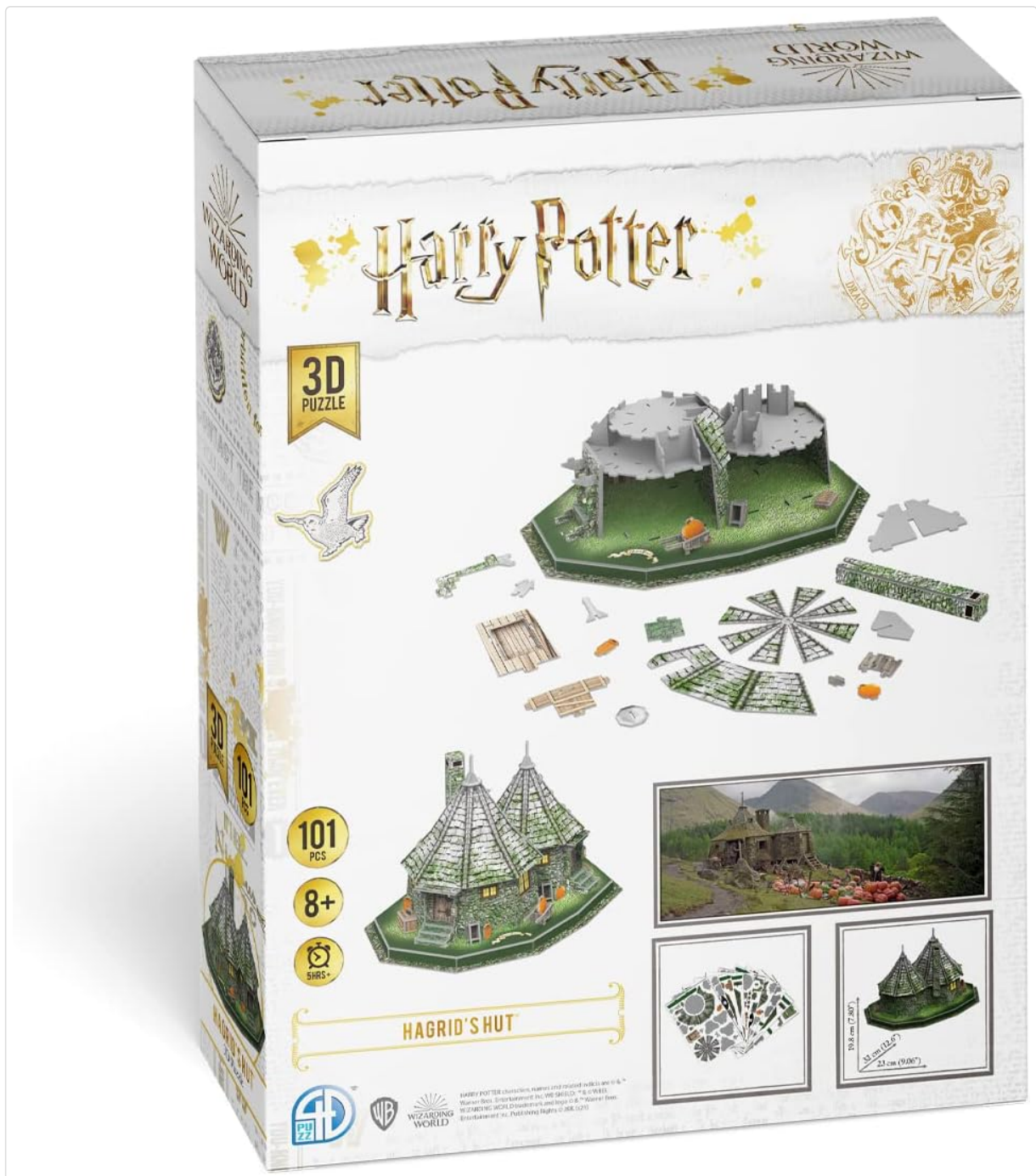
Back view of the 3D puzzle box, displaying the assembled model and individual pieces, along with a real-life image of Hagrid's Hut.