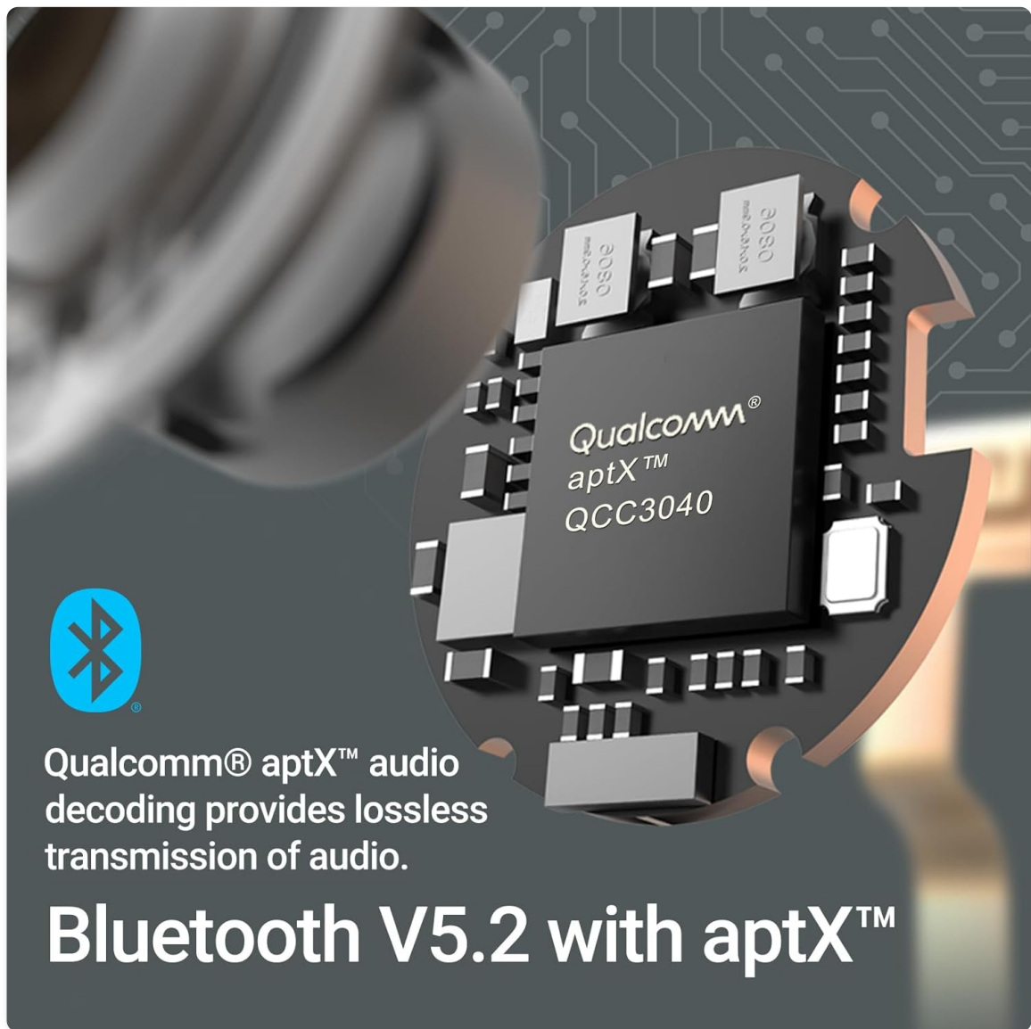
Image: A close-up of the Qualcomm aptX QCC3040 chip, highlighting Bluetooth V5.2 with aptX audio decoding for lossless audio transmission.