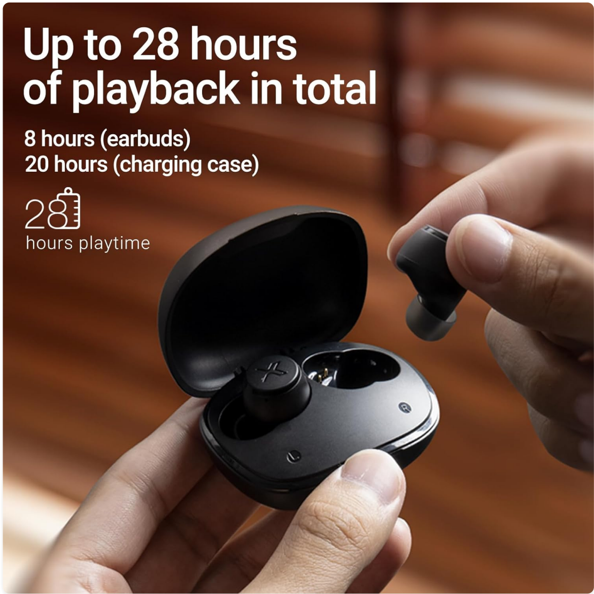
Image: Hands holding the Edifier X3s charging case, with an overlay indicating "Up to 28 hours of playback in total: 8 hours (earbuds), 20 hours (charging case)".