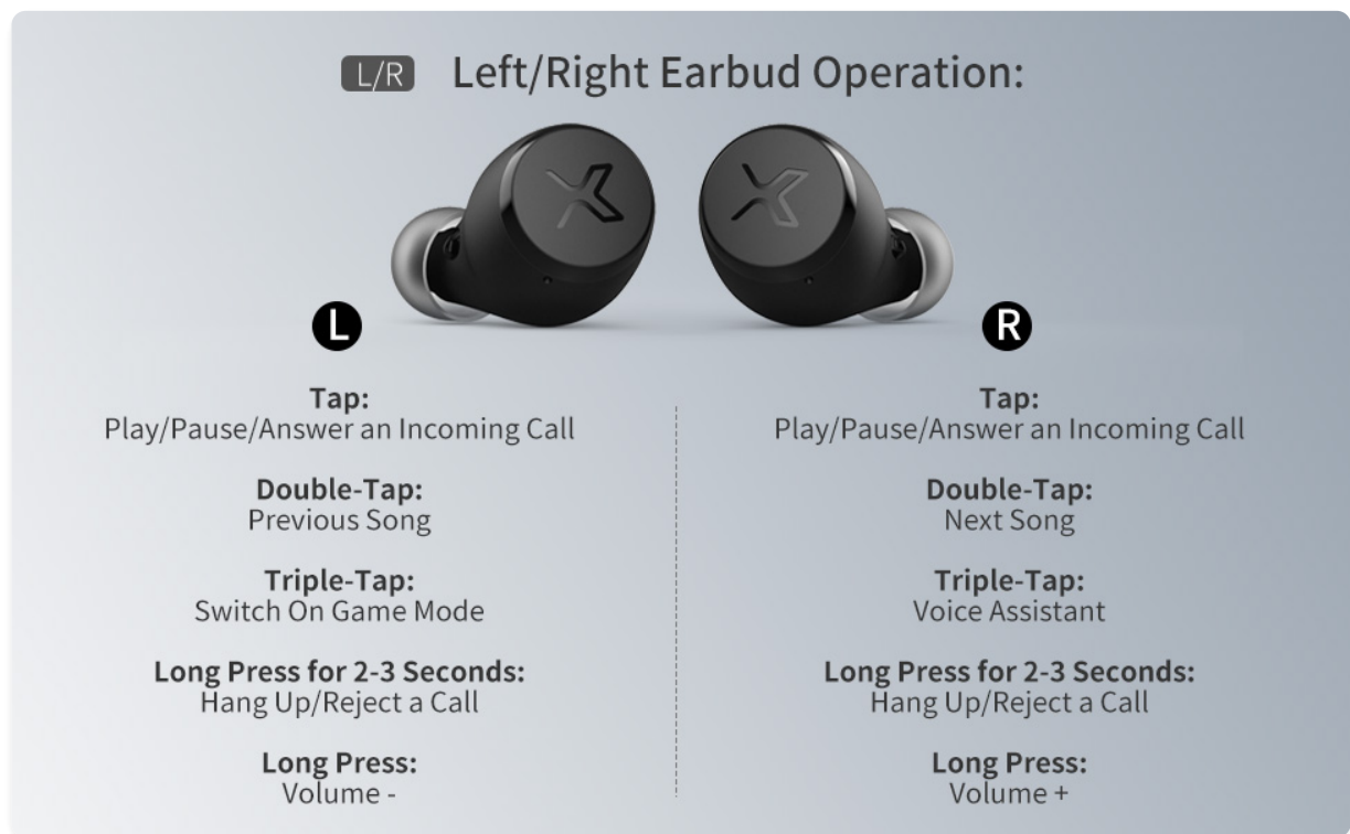
Image: A diagram illustrating the touch control functions for the left and right Edifier X3s earbuds.

Single Tap (L/R): Play/Pause music, Answer an Incoming Call