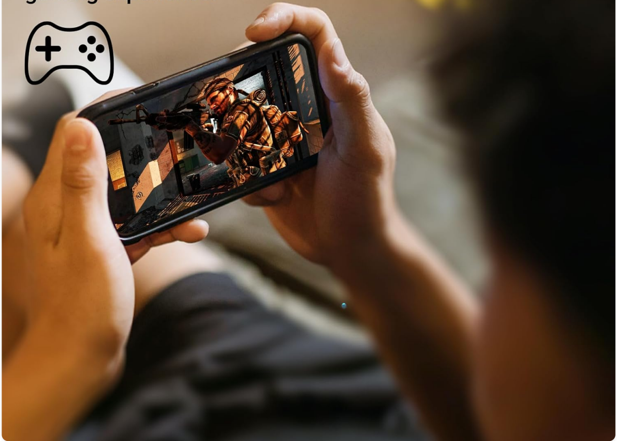
Image: A person holding a smartphone, playing a game, with the text "Synchronized Audio and Video. Game mode is supported for an immersive gaming experience."