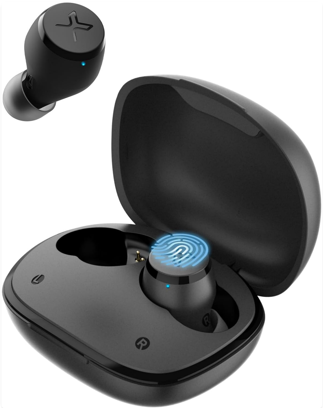
Image: The Edifier X3s earbuds, one removed from the open charging case, showcasing their compact design.