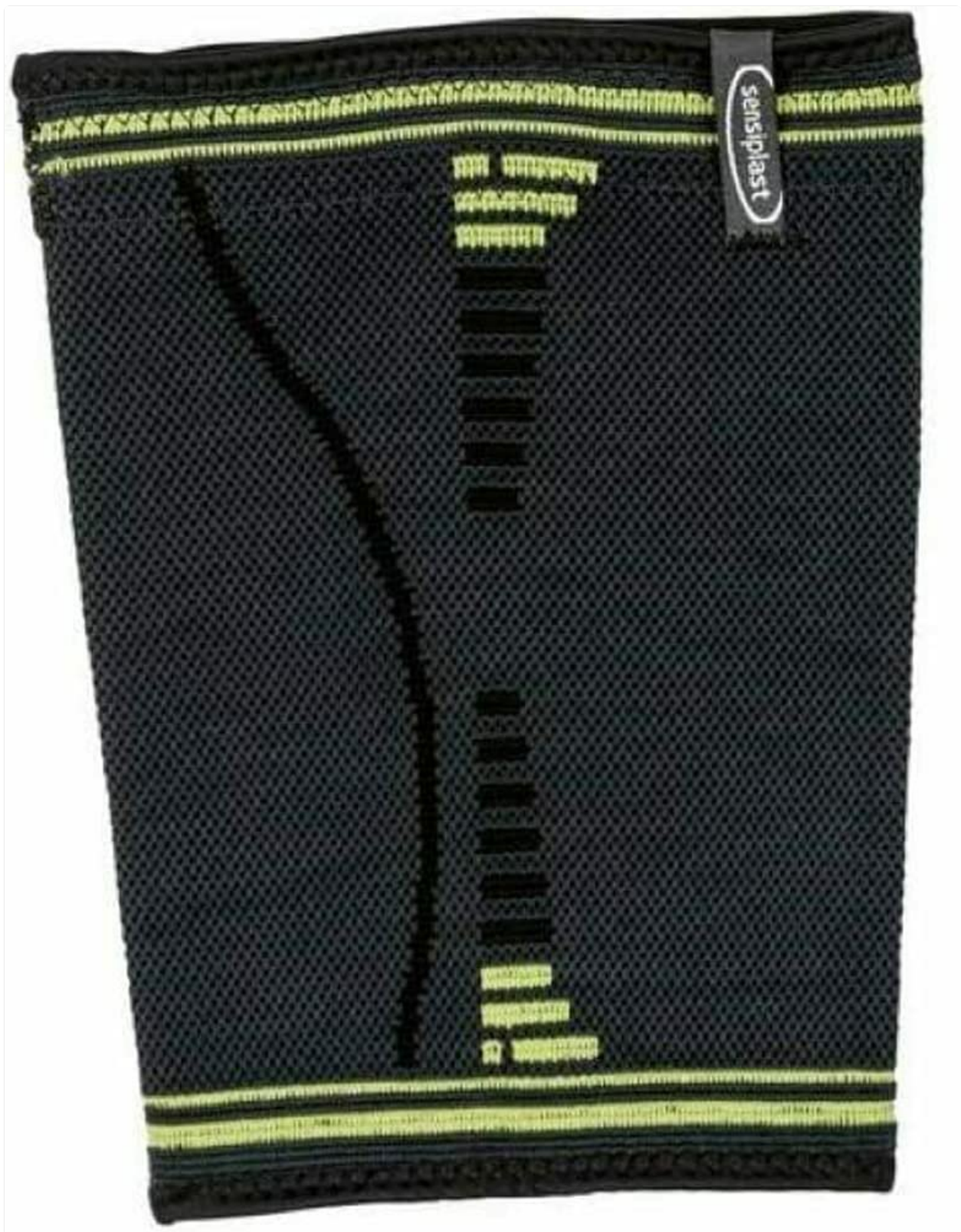
Image 2: Flat view of the Sensiplast Thigh Support Bandage. This image shows the overall design and material texture of the bandage when not in use.