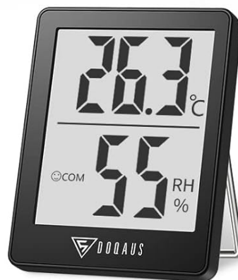
Image: The DOQAUS Indoor Thermometer Hygrometer HM1 displaying temperature and humidity readings on its screen.