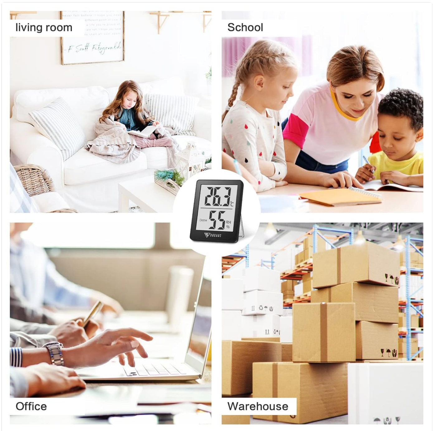
Image: The DOQAUS HM1 thermometer hygrometer shown in diverse application environments, including a living room, school, office, and warehouse.