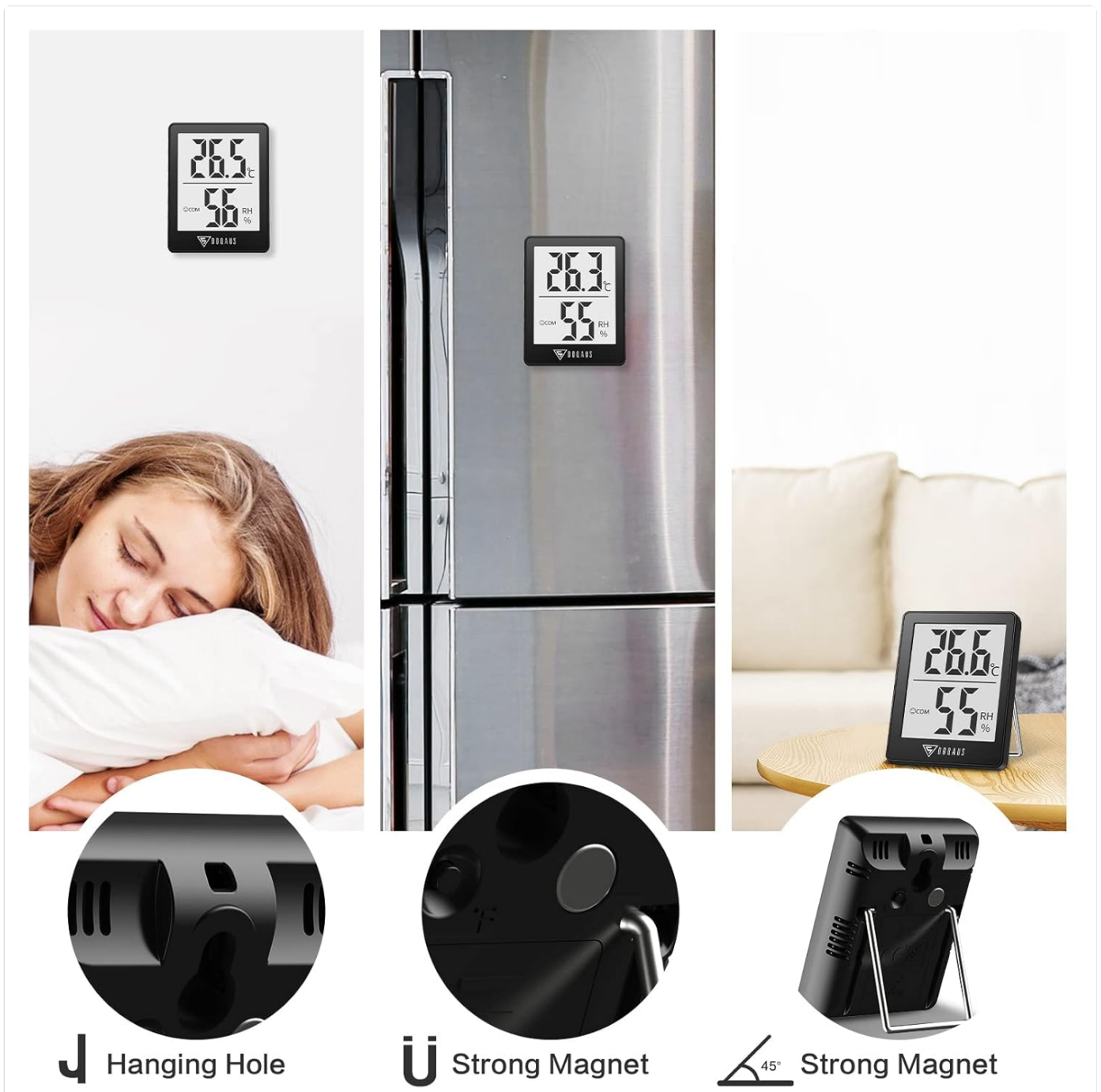
Image: Illustrations of the DOQAUS HM1's versatile mounting options, including a hanging hole, strong magnet, and a 45-degree table stand.