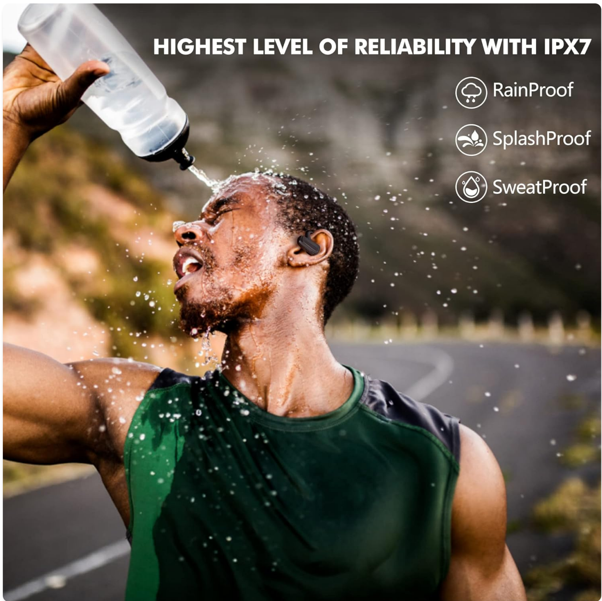
Figure 4: ACREO OpenBuds are IPX7 waterproof, making them resistant to sweat, splashes, and rain.