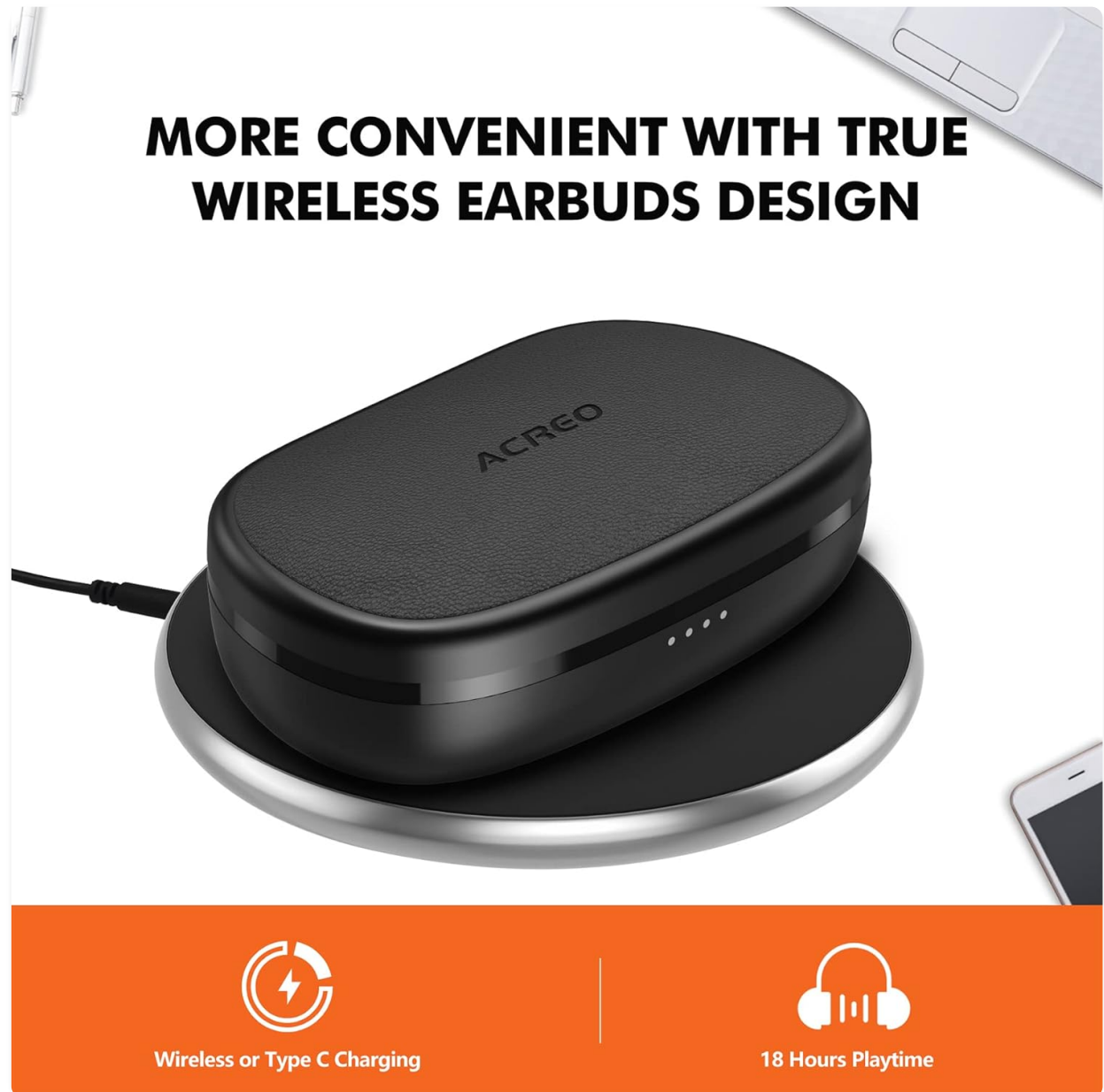
Figure 3: Charging the ACREO OpenBuds case wirelessly.