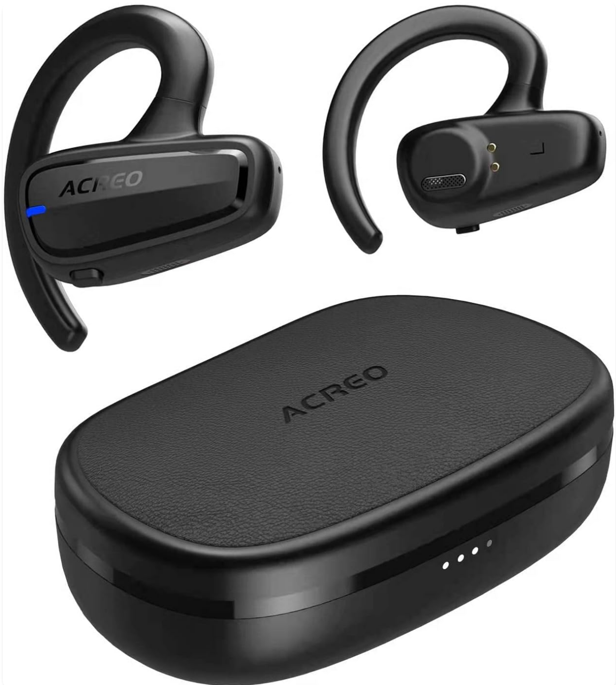
Figure 2: Earbud control functions.

Video 3: How to Control All Functions with the One Button. This video demonstrates the various control gestures for the earbuds.