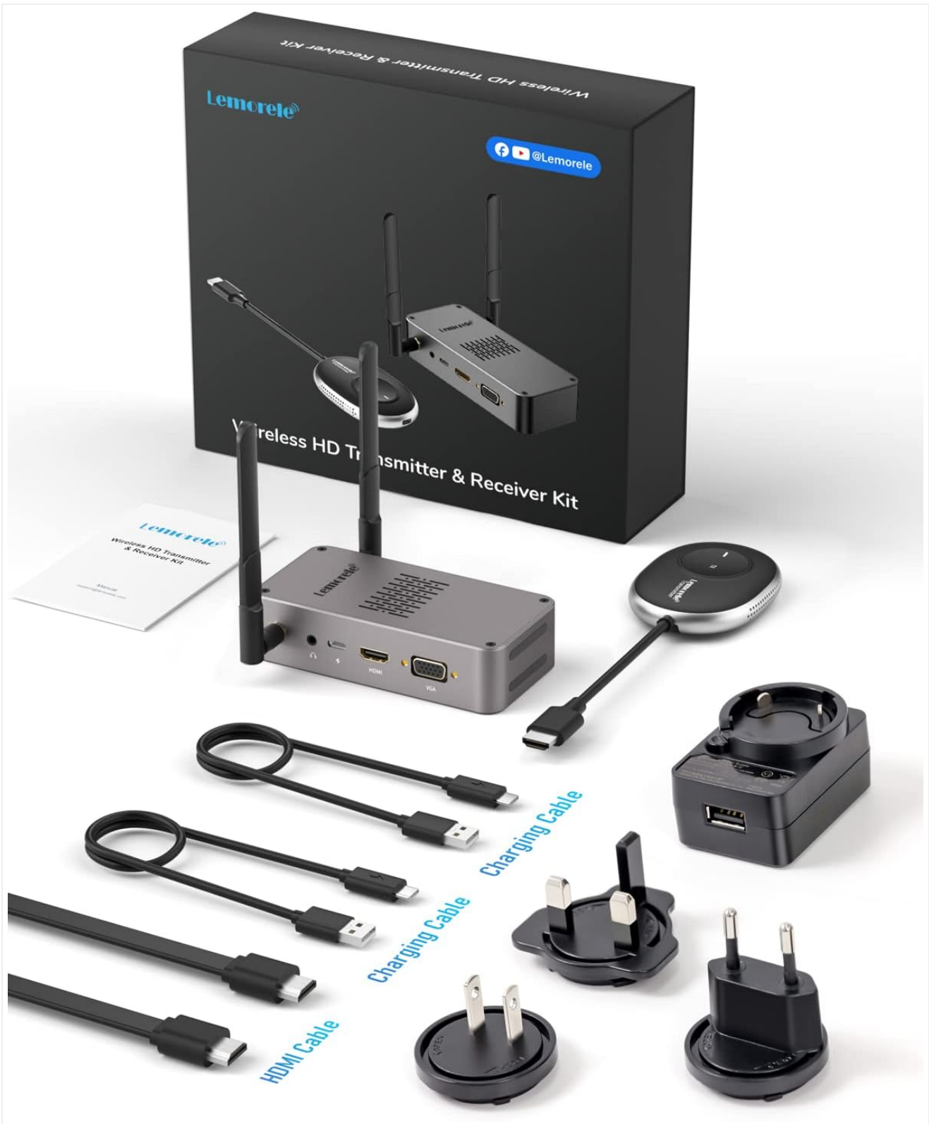
Image: The complete package contents, including the transmitter, receiver, HDMI cable, two USB-C charging cables, a power adapter, and the user manual.