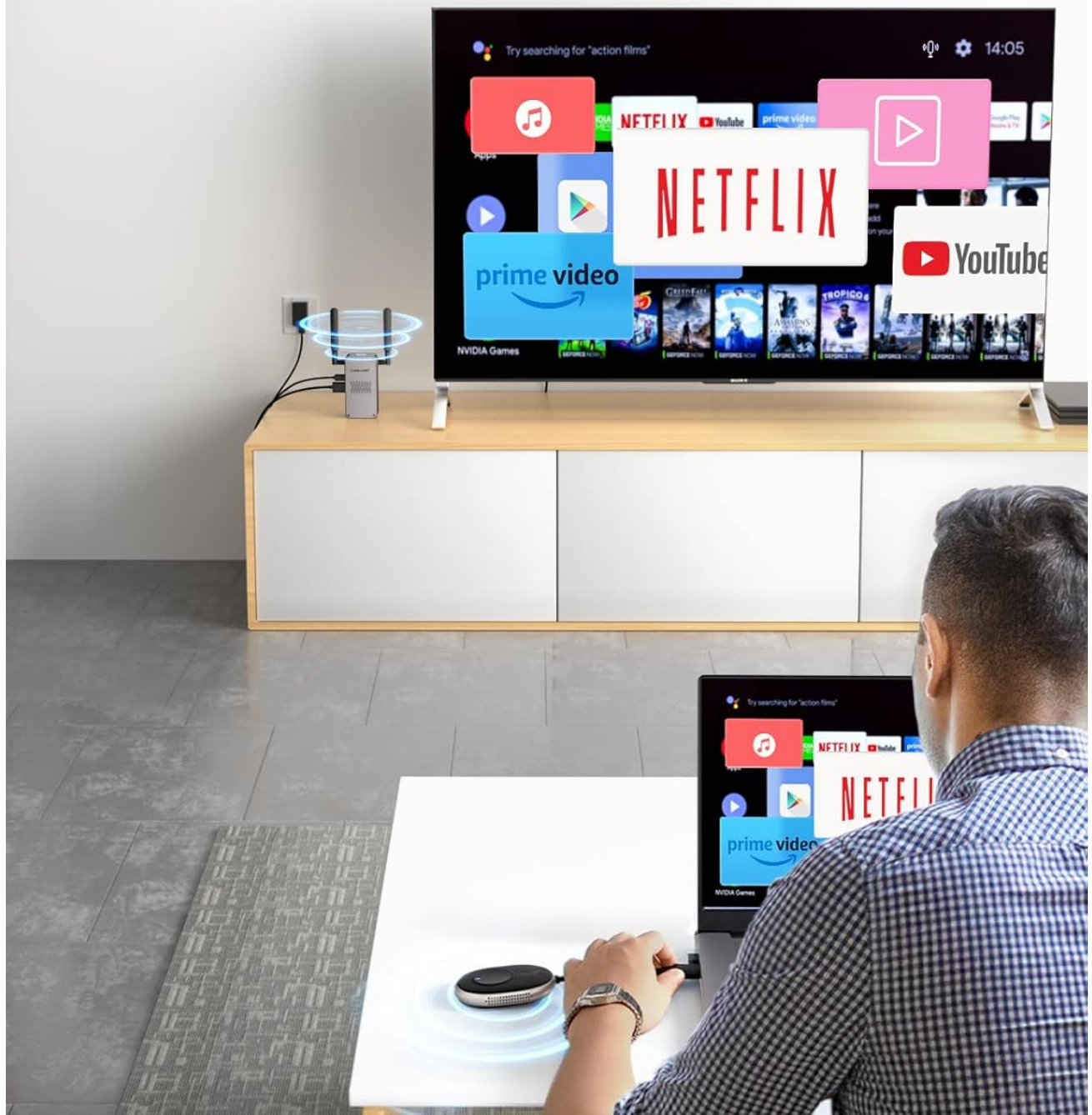
Image: A user is shown operating the wireless HDMI system, with a laptop connected to the transmitter and a TV displaying content from Netflix, demonstrating the plug-and-play functionality.

No additional drivers/software support all kinds of video software