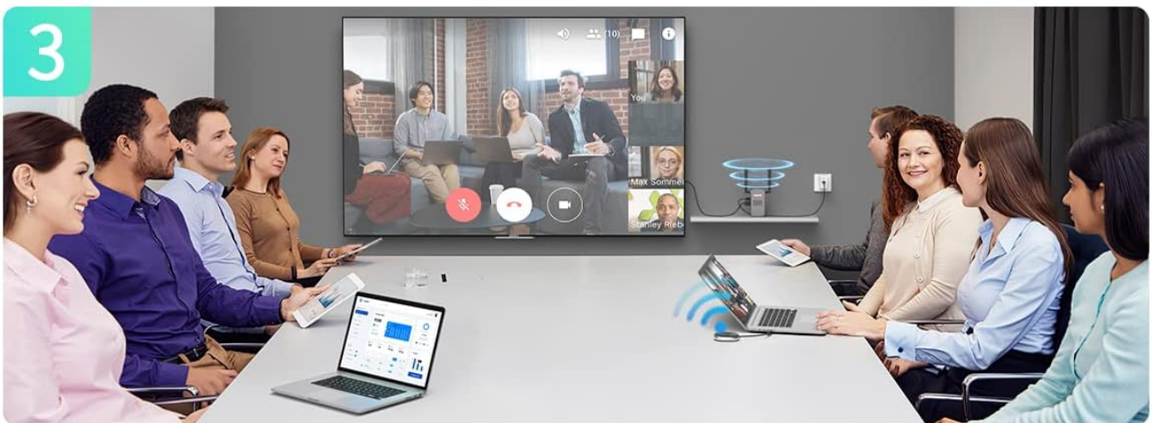
Image: A three-panel image illustrating multi-point free switching. Panel 1 shows a single transmitter connected. Panel 2 shows two transmitters connected to different laptops in a meeting room. Panel 3 shows the display switching between the two laptops, highlighting the ease of changing sources.