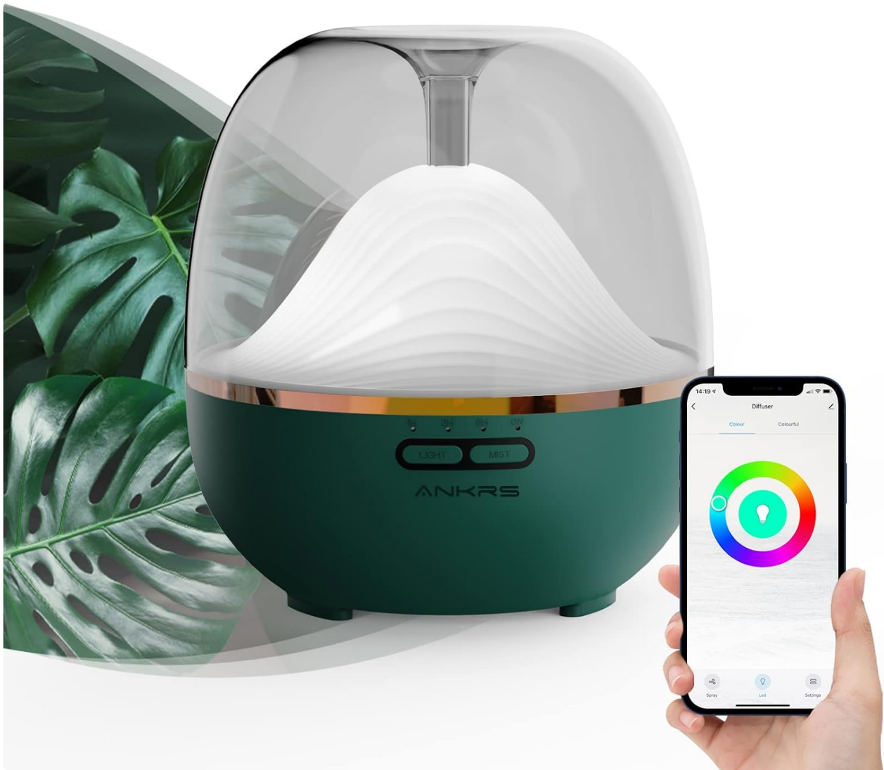
Image 1: The Ankrs Smart Aroma Diffuser in green, showcasing its design and the accompanying mobile application interface for control.