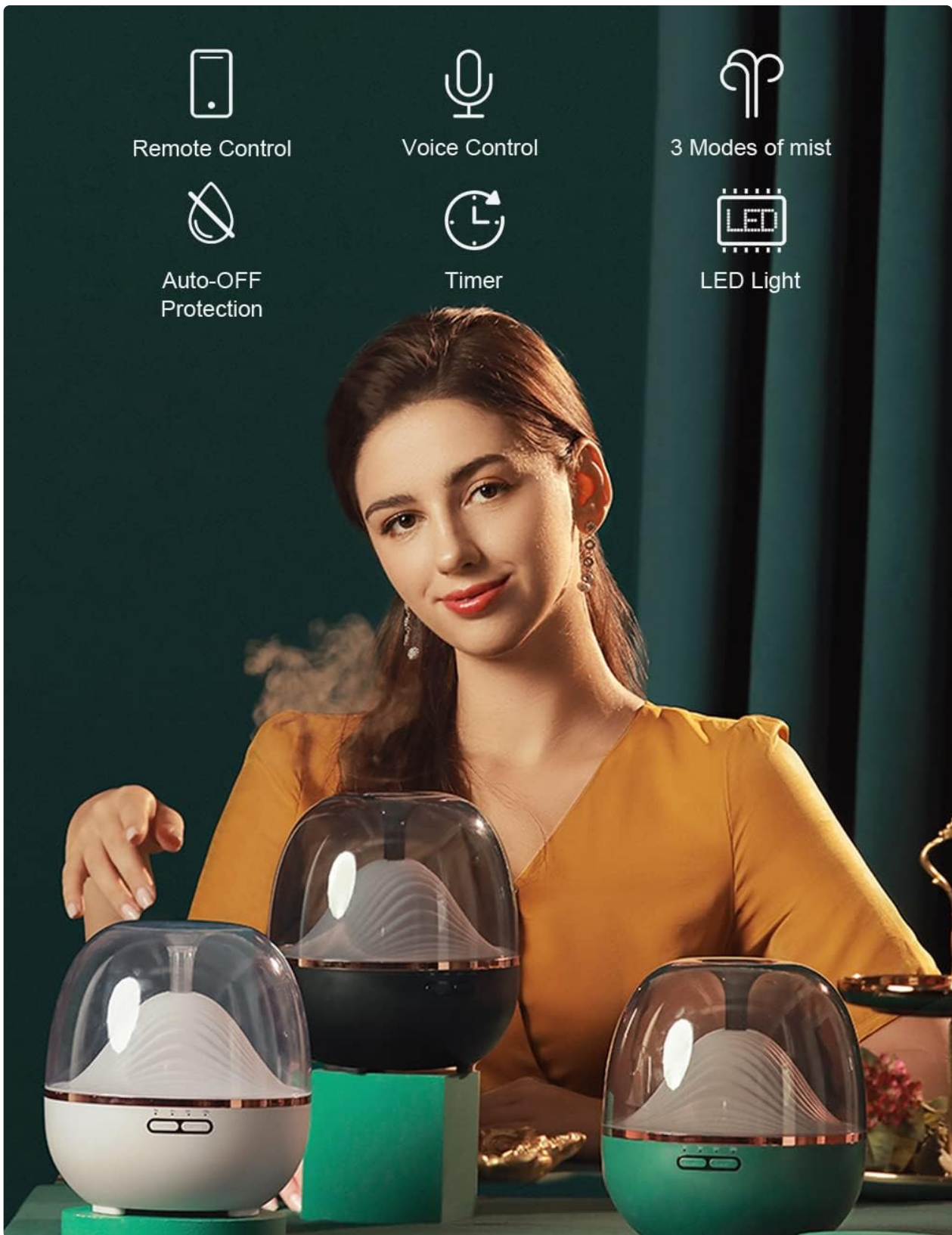
Image 2: An overview of the diffuser's key features, including remote control, voice control, automatic shut-off, timer, three mist modes, and LED lighting.