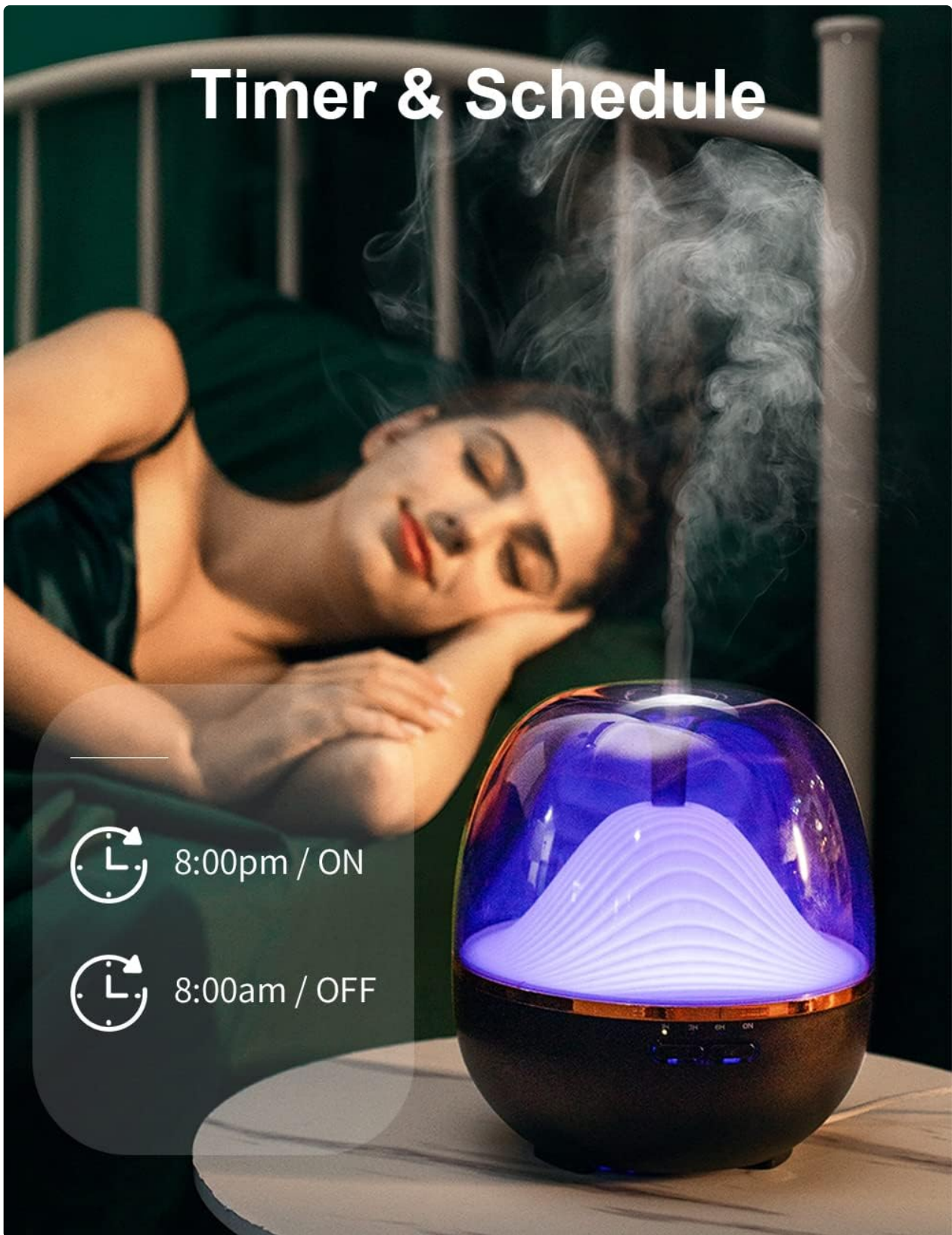
Image 5: Shows the timer and schedule function, allowing users to program the diffuser to turn on and off at specific times.