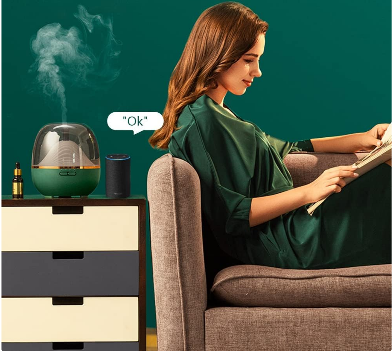
Image 3: Demonstrates voice control functionality with Amazon Alexa, allowing hands-free operation of the diffuser.