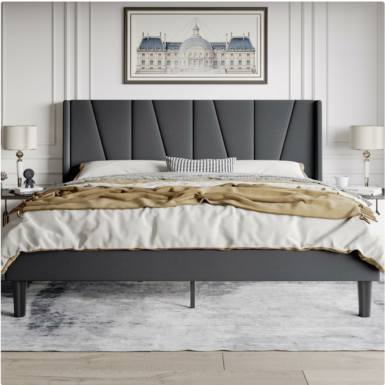
Figure 1: HOOMIC King Size Platform Bed Frame (Dark Grey)