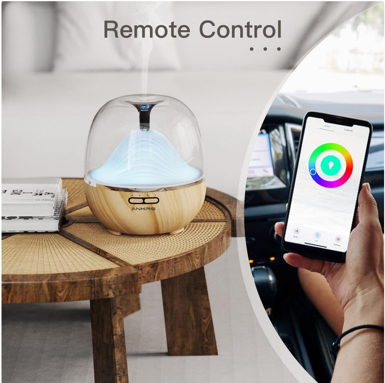
Image: Controlling the diffuser remotely using the Smart Life app on a smartphone.