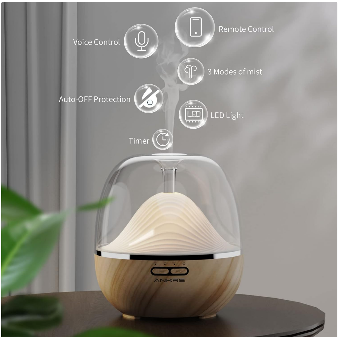
Image: Overview of the Ankrs Smart Diffuser highlighting its main features including voice control, remote control, multiple mist modes, auto-off, LED lighting, and timer function.