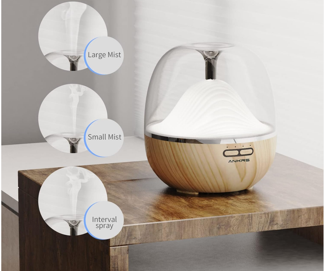
Image: Visual representation of the three available mist output modes.