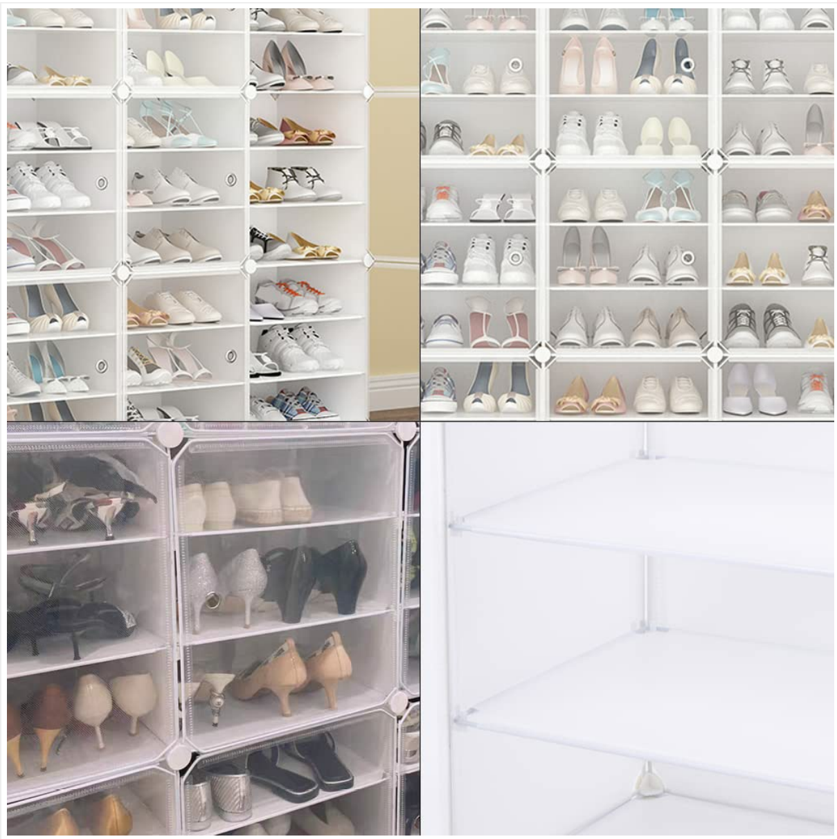
Figure 6: The organizer in a typical usage scenario.