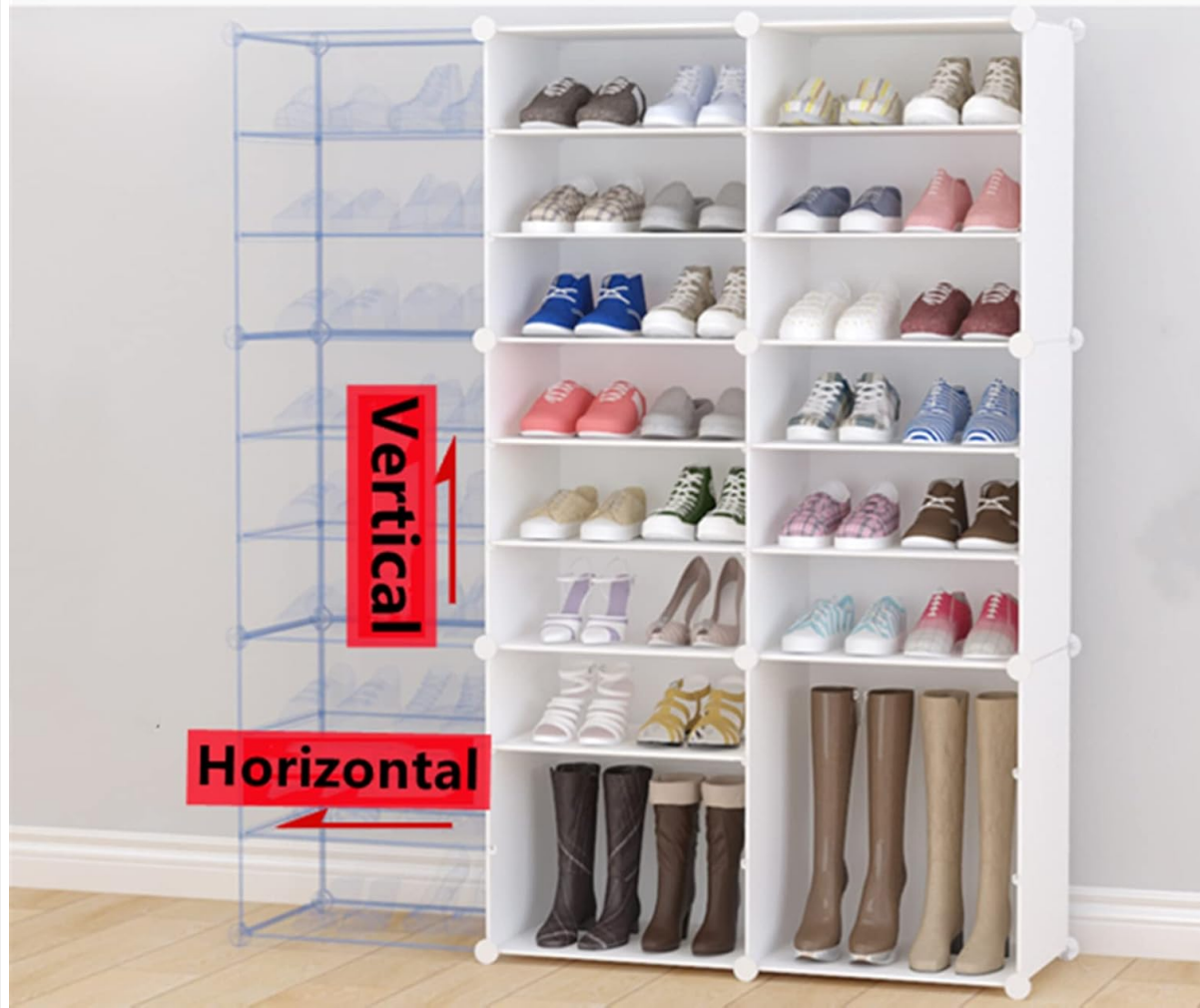
Figure 2: Example of vertical and horizontal expansion possibilities.