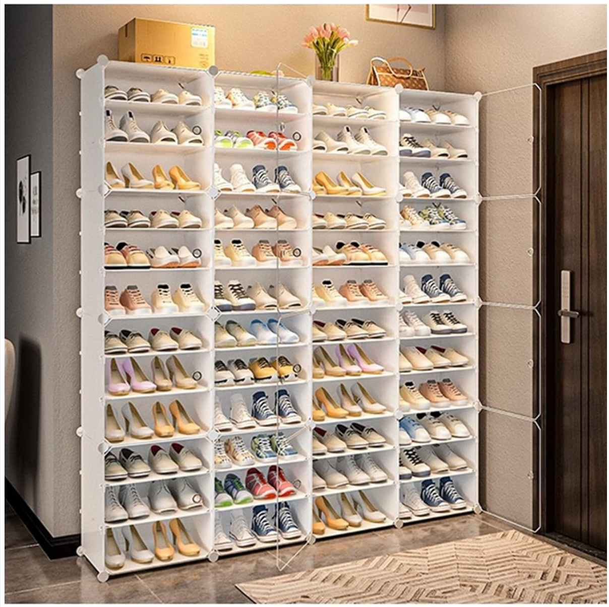
Figure 1: Fully assembled Gdrasuya10 16-Cube Modular Shoe Organizer.