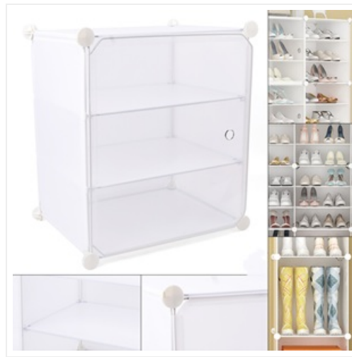
Figure 3: Detail of a single cube unit.