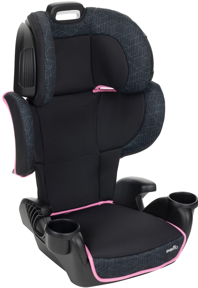
Figure 2: Illustrates the adjustable headrest and backrest of the booster seat. The headrest can be moved up and down to accommodate children of various heights, ensuring proper head and neck support.