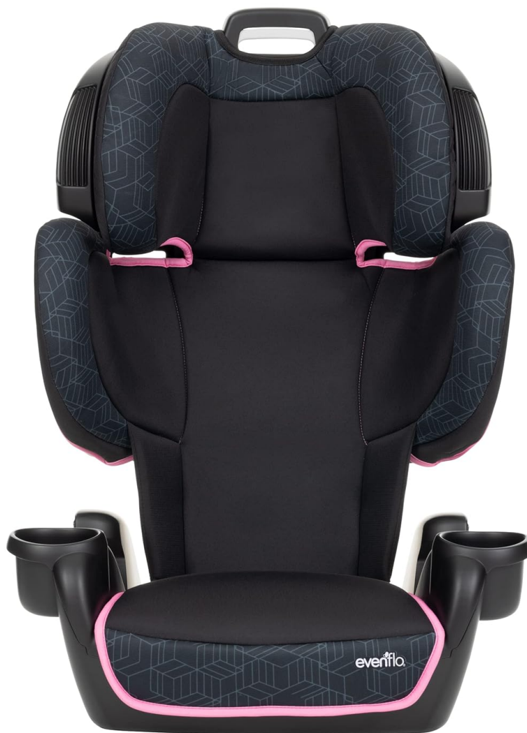
Figure 1: Front view of the Evenflo GoTime LX High Back Booster Car Seat. This image shows the overall design of the booster seat, including the headrest, backrest, and base with integrated cup holders.