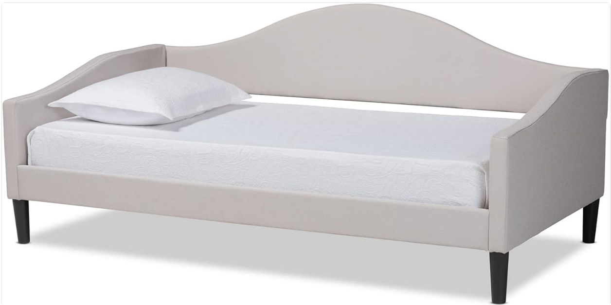
Image: The Baxton Studio Milligan Full Size Daybed, showcasing its design with a mattress and pillow in place.