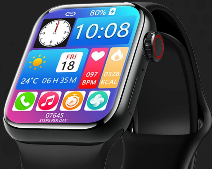
Image: The IKALL W3 Smart Watch displaying a 'Smart Split Screen' interface, showing multiple apps and information simultaneously.