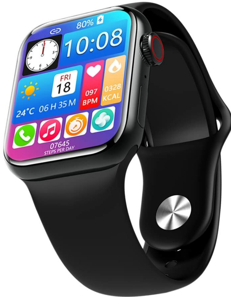
Image: Front view of the IKALL W3 Smart Watch, displaying time, date, weather, and various app icons.