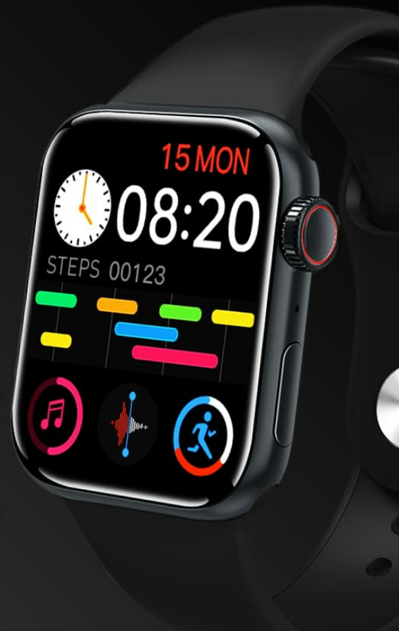
Image: The IKALL W3 Smart Watch highlighting its health monitoring capabilities, including SpO2 Oxygen Monitor, Heart Rate Monitor, and Sleep Monitor icons.