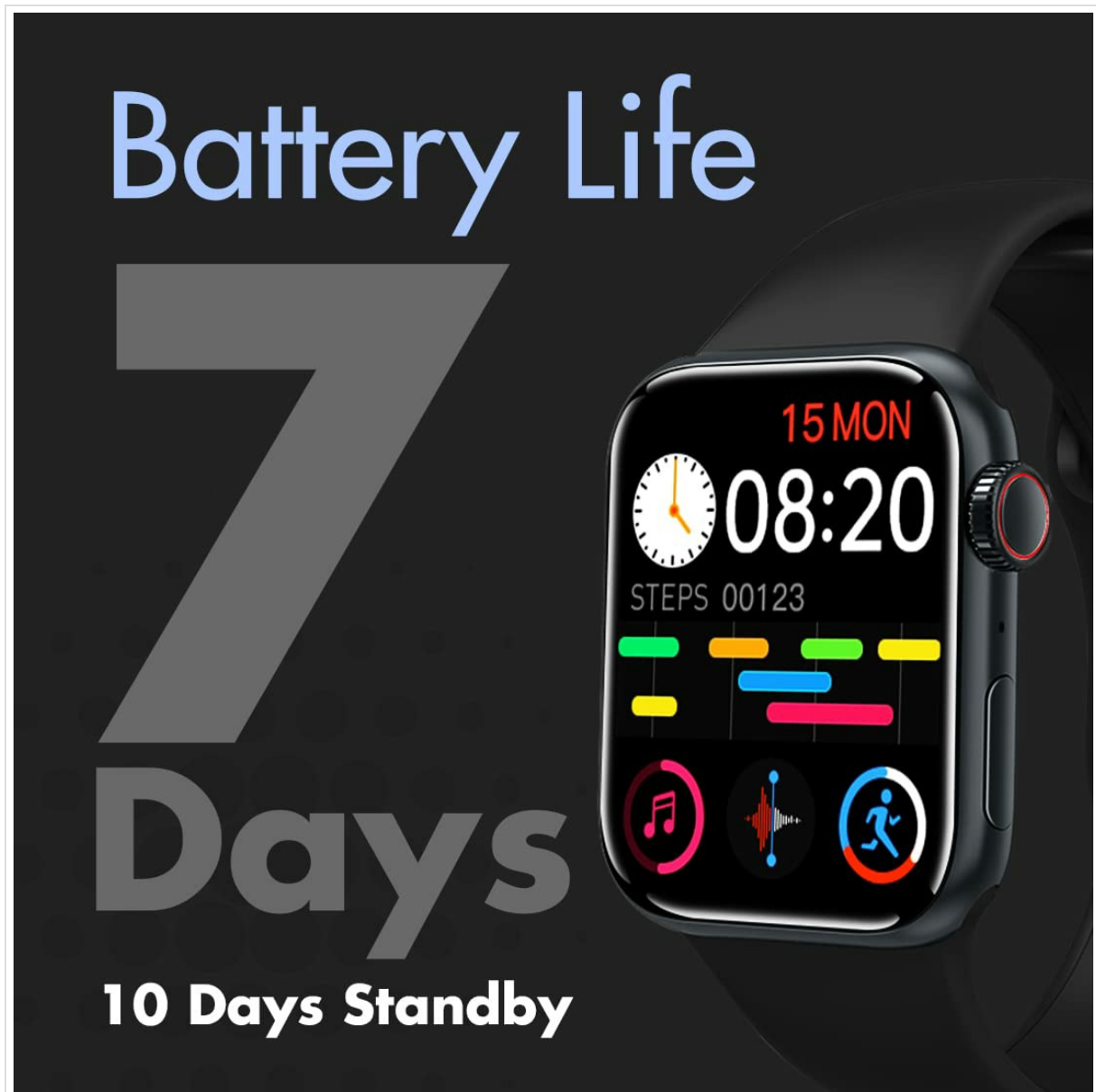
Image: The IKALL W3 Smart Watch displaying '7 Days' for battery life and '10 Days Standby', indicating its power efficiency.