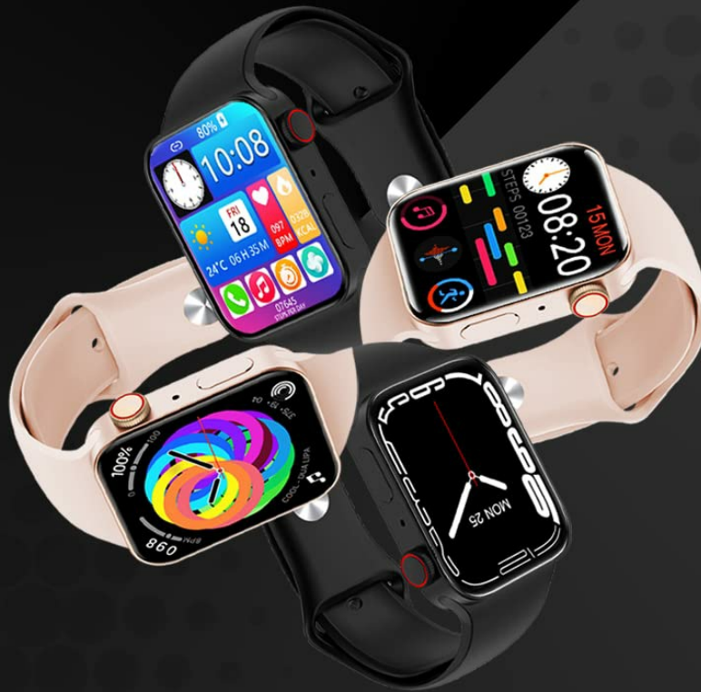
Image: Four IKALL W3 Smart Watches, each displaying a different watch face design, illustrating the variety of cloud-based options.