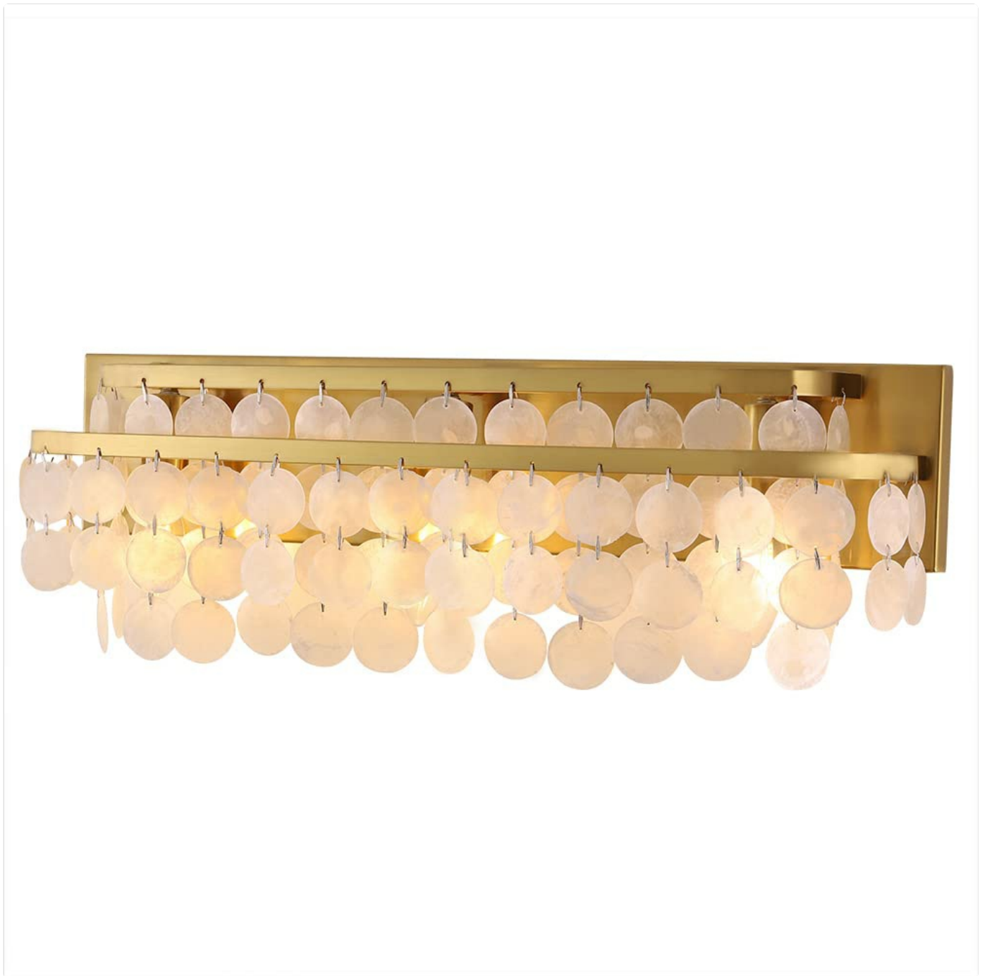
Image 1.1: The TOCHIC 3-Light Brushed Gold Vanity Light with natural capiz shell shades.