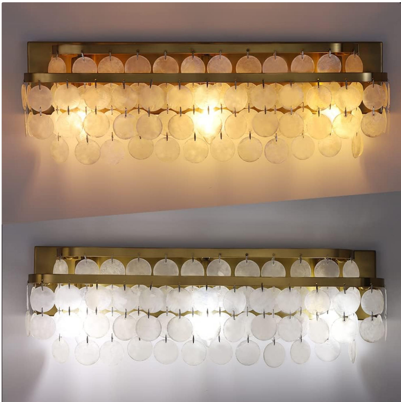
Image 6.1: The vanity light illuminated with different color temperatures.

Your browser does not support the video tag.