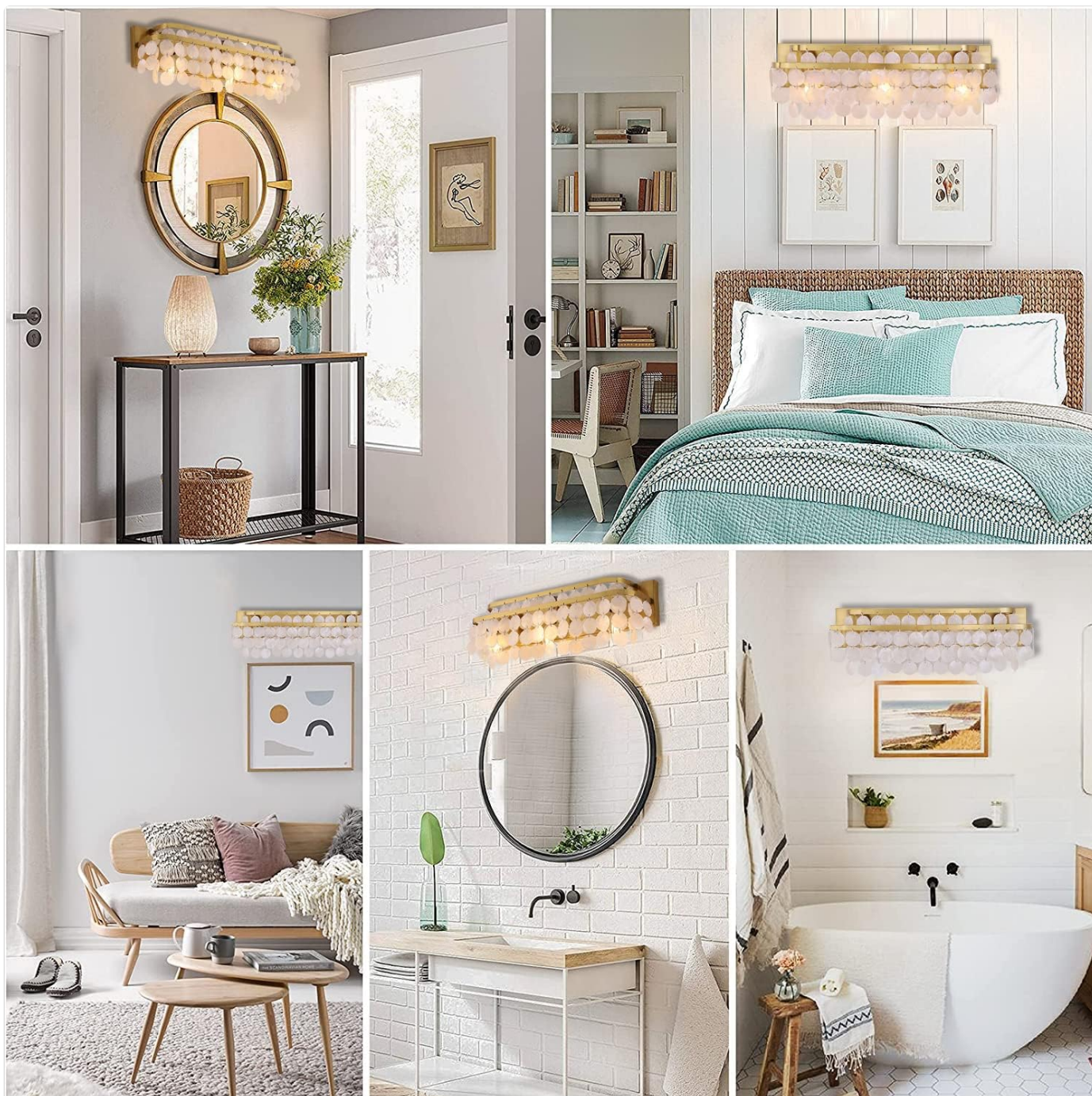
Image 1.2: The vanity light showcased in different interior environments.