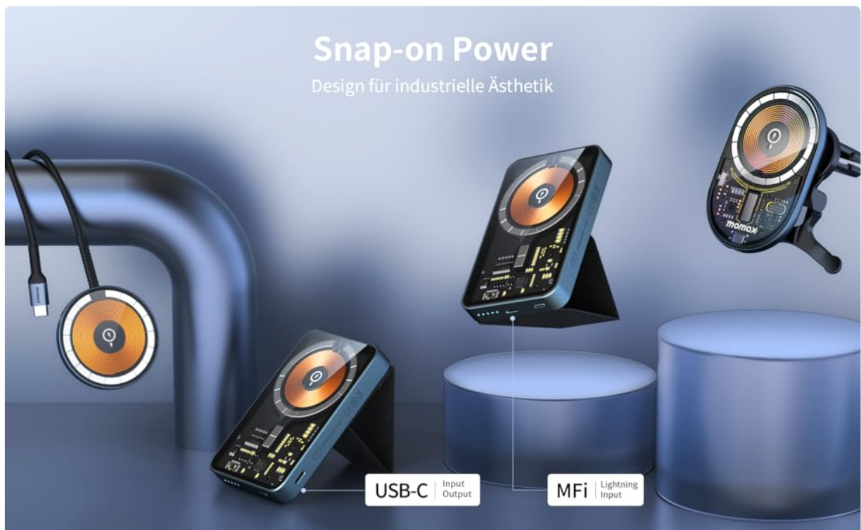
Image 1.1: The MOMAX Magnetic Portable Charger with Stand in use, providing power to an iPhone.

Thank you for choosing the MOMAX Magnetic Portable Charger with Stand. This device is designed to provide convenient and efficient wireless charging for your Magsafe-compatible iPhone 12 and 13 series, featuring a built-in foldable stand for versatile viewing. Please read this manual carefully before use to ensure optimal performance and safety.