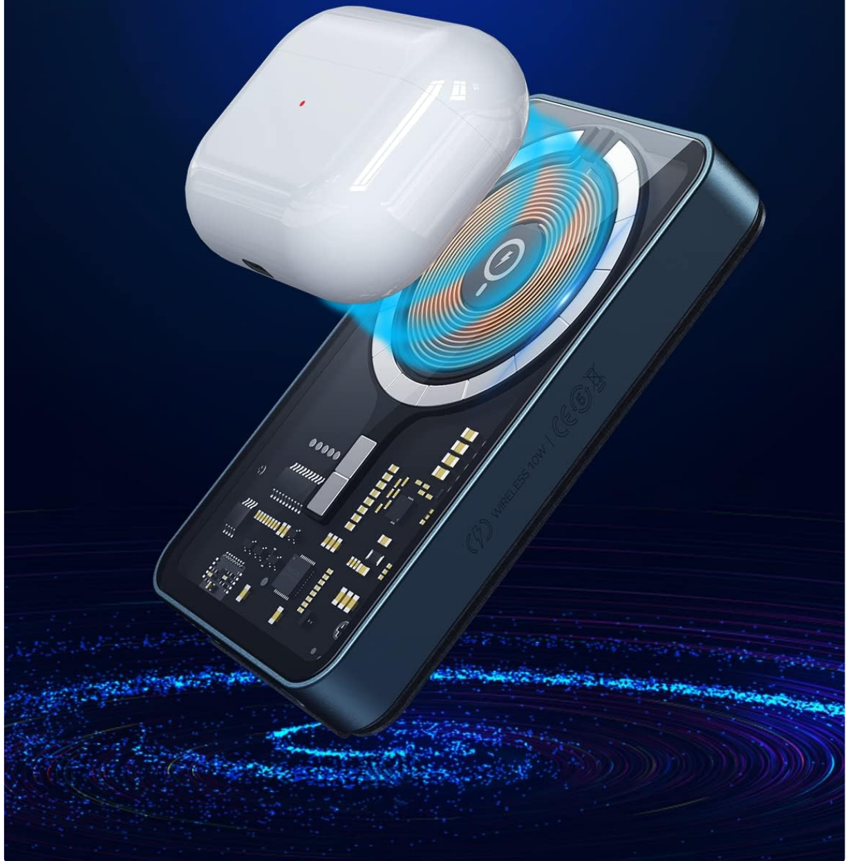
Image 5.2: The small current mode safely charges devices like AirPods.