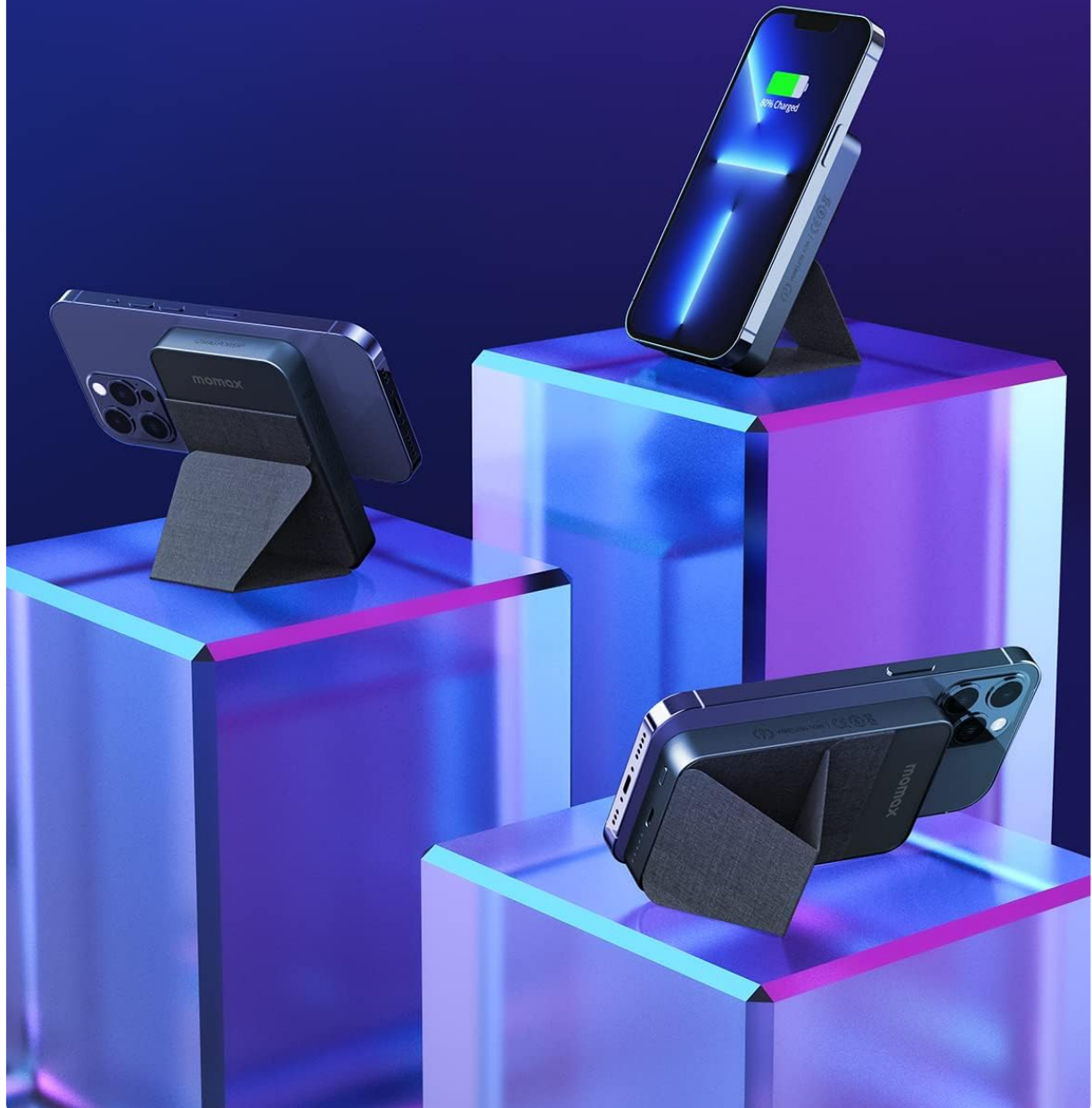
Image 5.1: The foldable stand supports both portrait and landscape orientations for your iPhone.