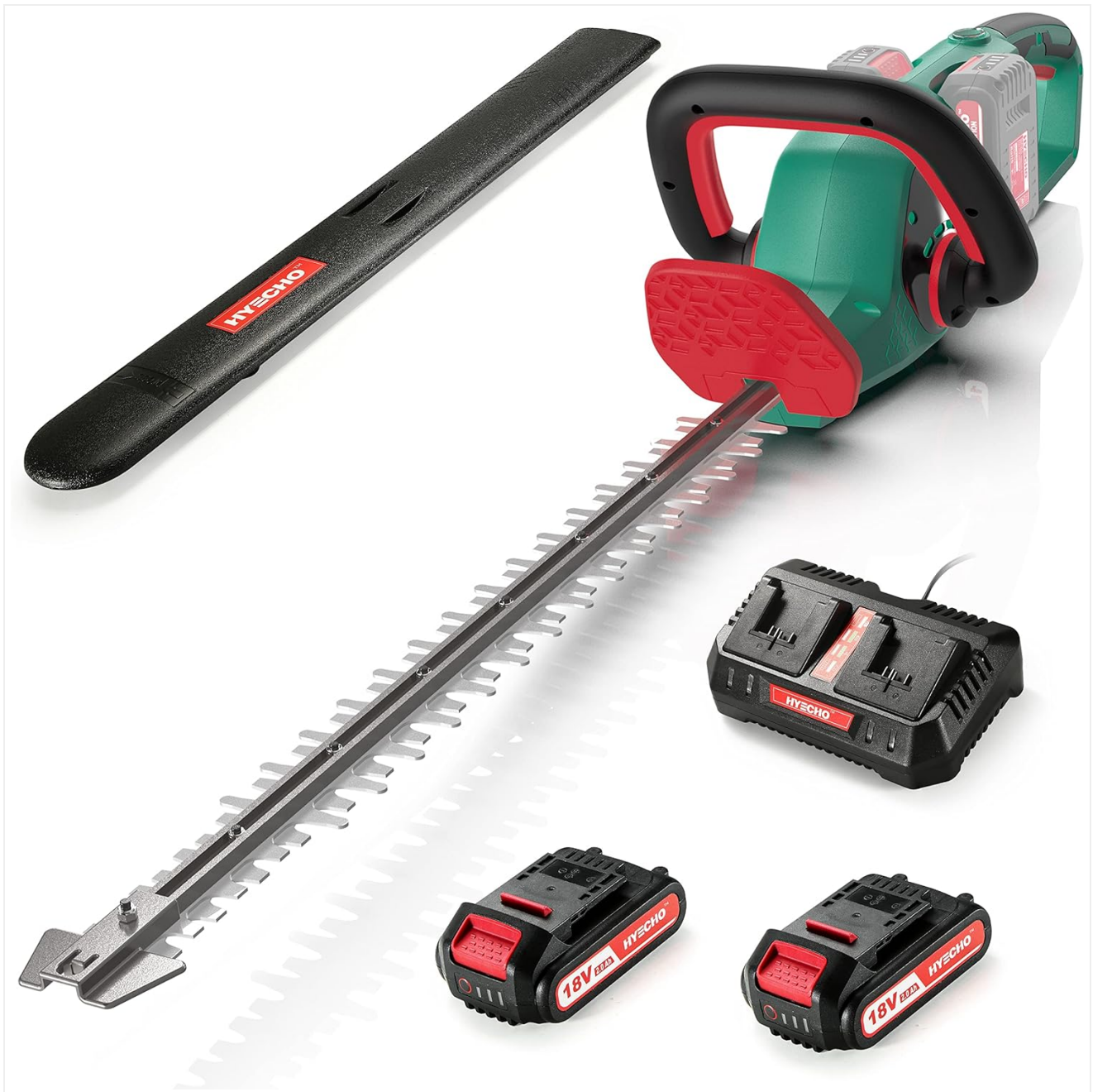
Image: All components included in the HYECHO 36V Cordless Hedge Trimmer package.