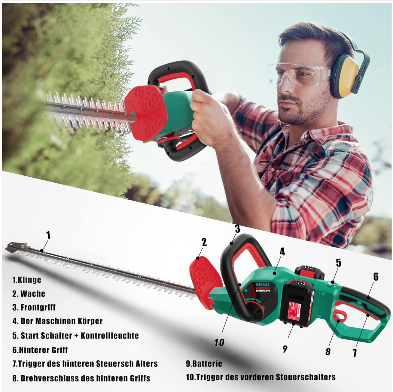
Image: Diagram showing the main components and controls of the hedge trimmer, including the start switch and indicator light.