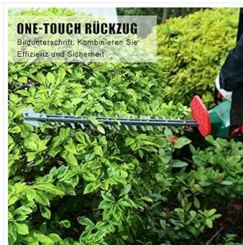
Image: The one-touch reverse function helps clear jammed branches from the blades.

If the blades become jammed by a thick branch, the hedge trimmer features a one-touch reverse function. With the dual safety switch engaged, press the designated wake-up button. The blades will reverse direction, helping to clear the obstruction and allow you to continue trimming without interruption.