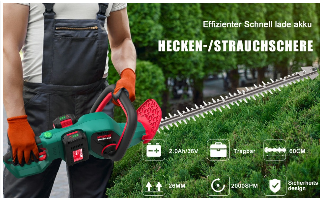
Image: Demonstrating the multi-angle rotation feature of the hedge trimmer's handle.

The rear handle of the hedge trimmer can be rotated to multiple angles (0°, 45°, 90° clockwise and counter-clockwise) to accommodate various trimming positions and improve ergonomics. To adjust, locate the rotation lock mechanism on the handle, press or release it, and rotate the handle to the desired angle. Ensure it locks firmly into place before operation.