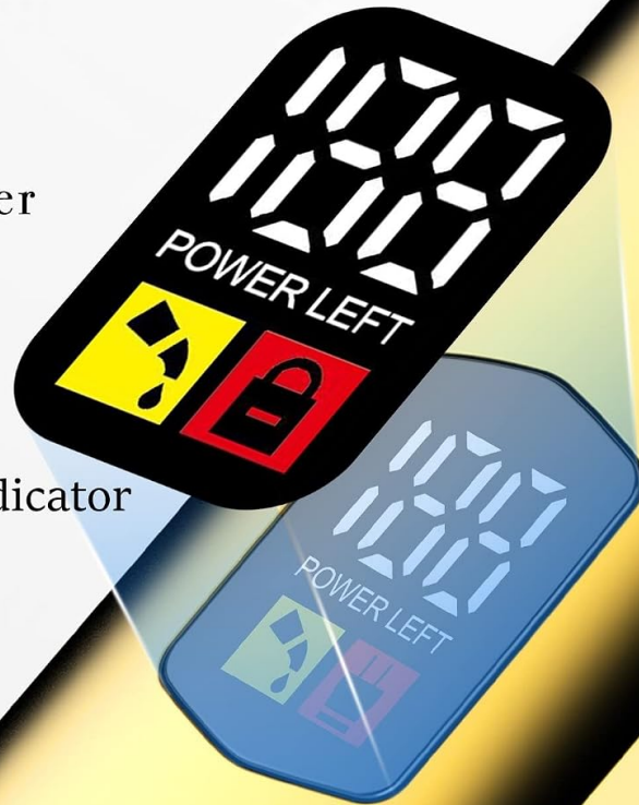
Image: Close-up of the digital display, illustrating the battery indicator, oil reminder icon, and lock-key indicator.