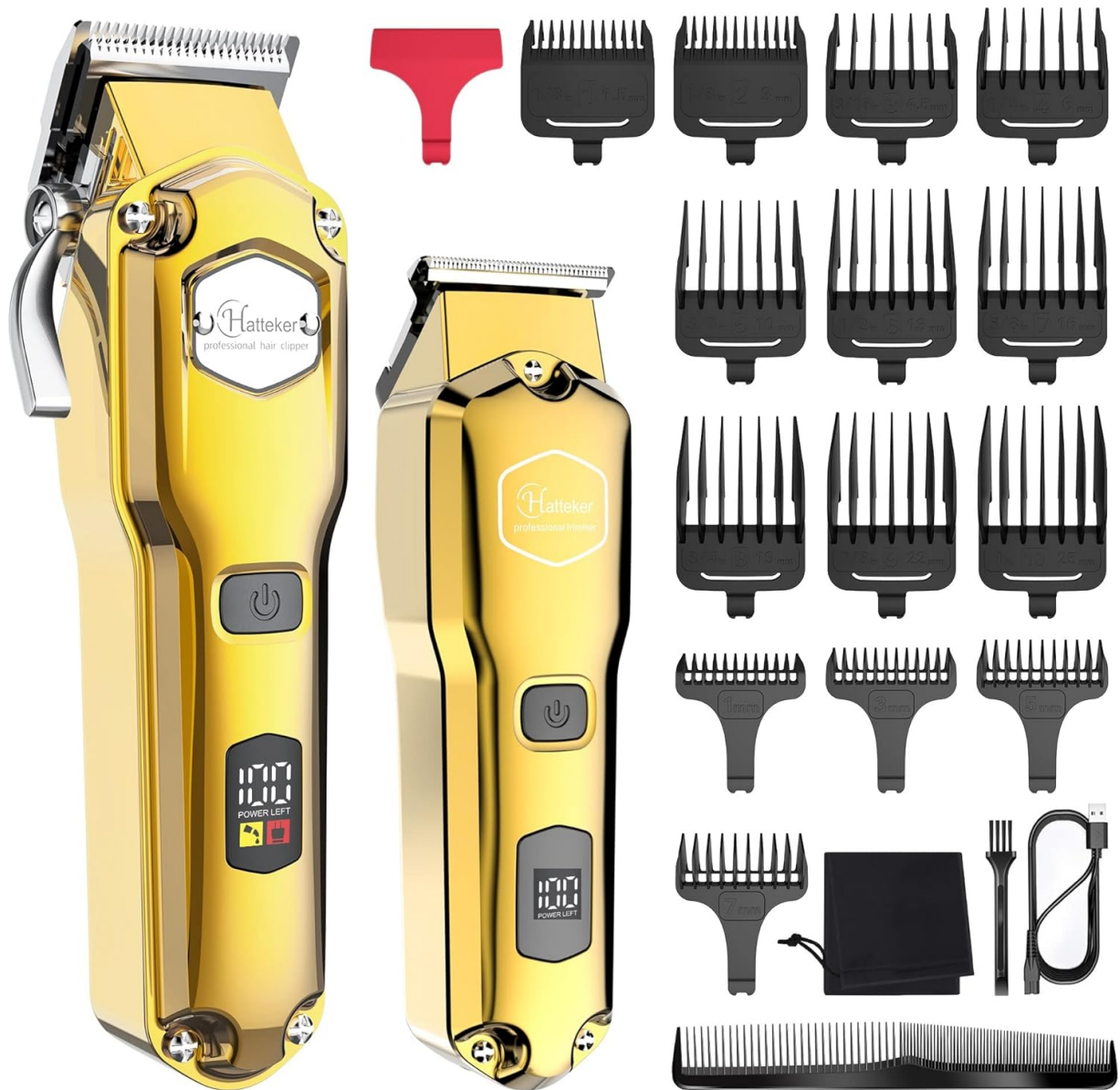
Image: Hatteker Hair Trimmer Set including the main clipper, detail trimmer, various guide combs, charging cable, and cleaning tools.