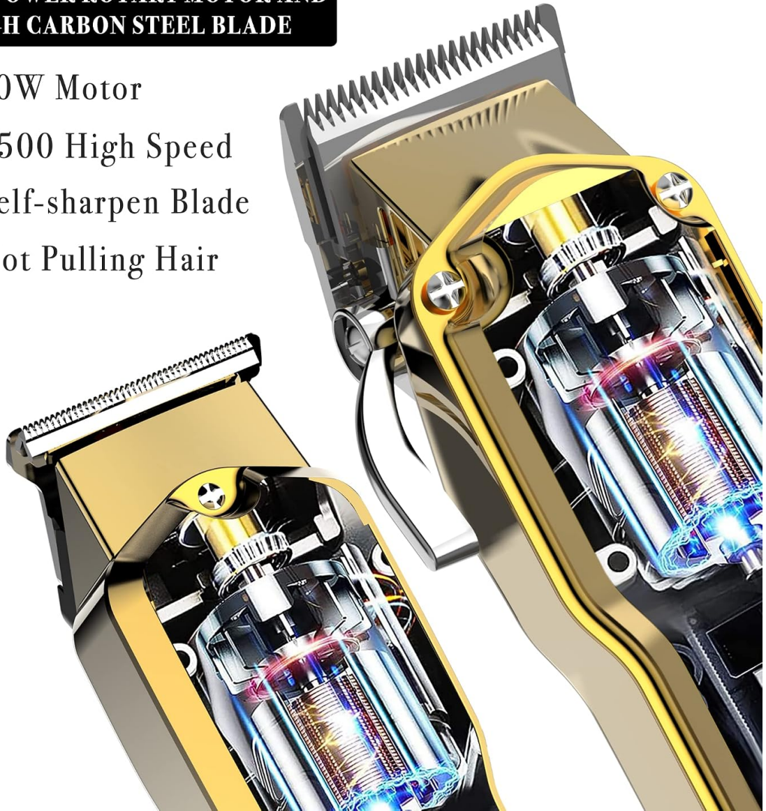
Image: An internal view of the clippers, emphasizing the powerful 10W motor and 6500 RPM high-speed performance.