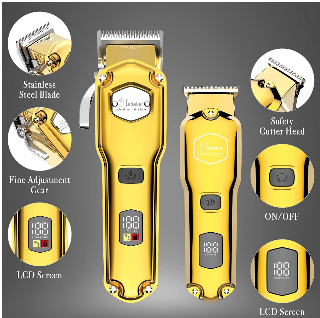
Image: Detailed view highlighting the stainless steel blade, fine adjustment gear, LCD screen, safety cutter head, and power button on both the clipper and trimmer.