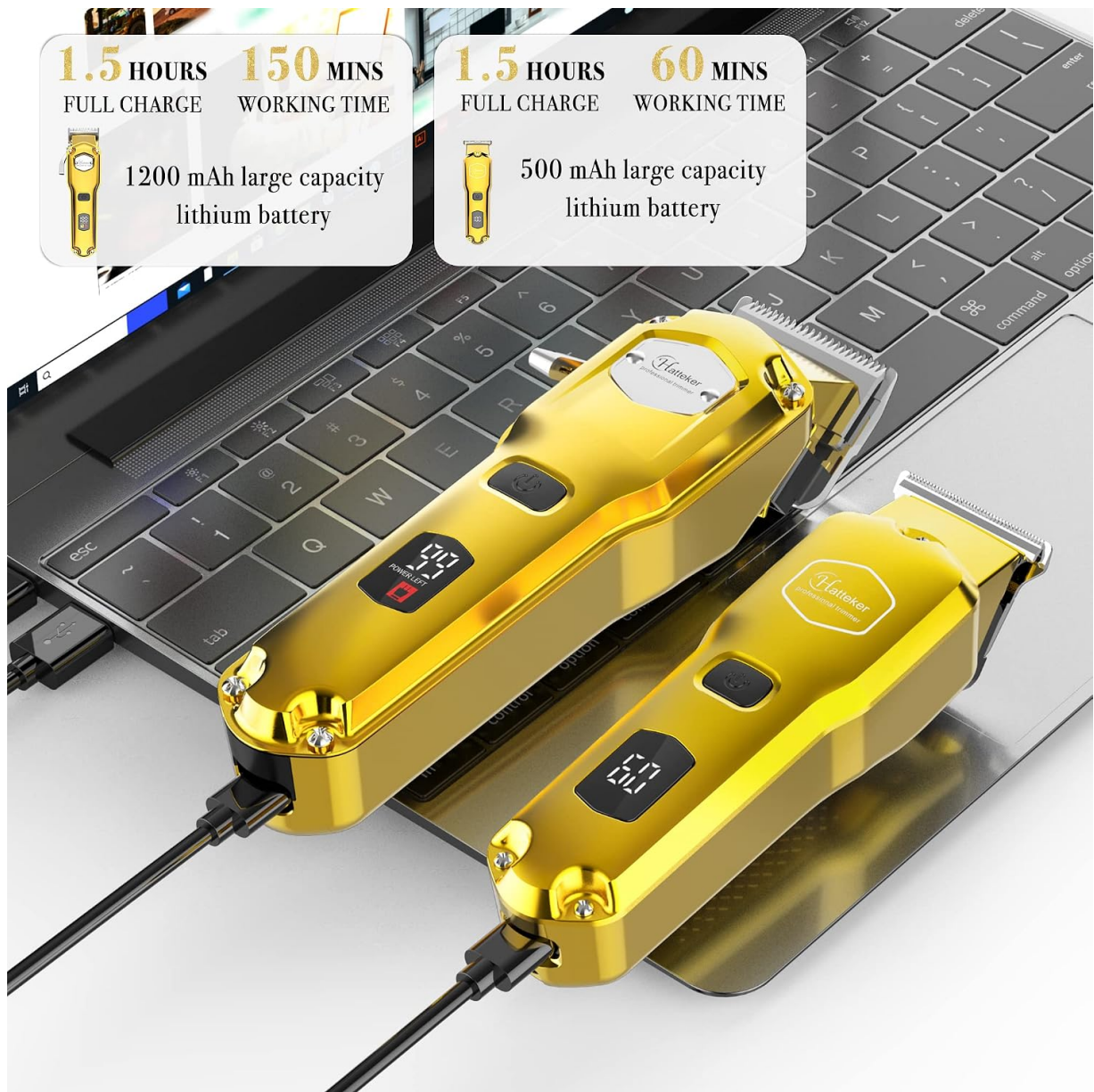
Image: Both the hair clipper and detail trimmer connected to USB charging cables, illustrating their charging process.