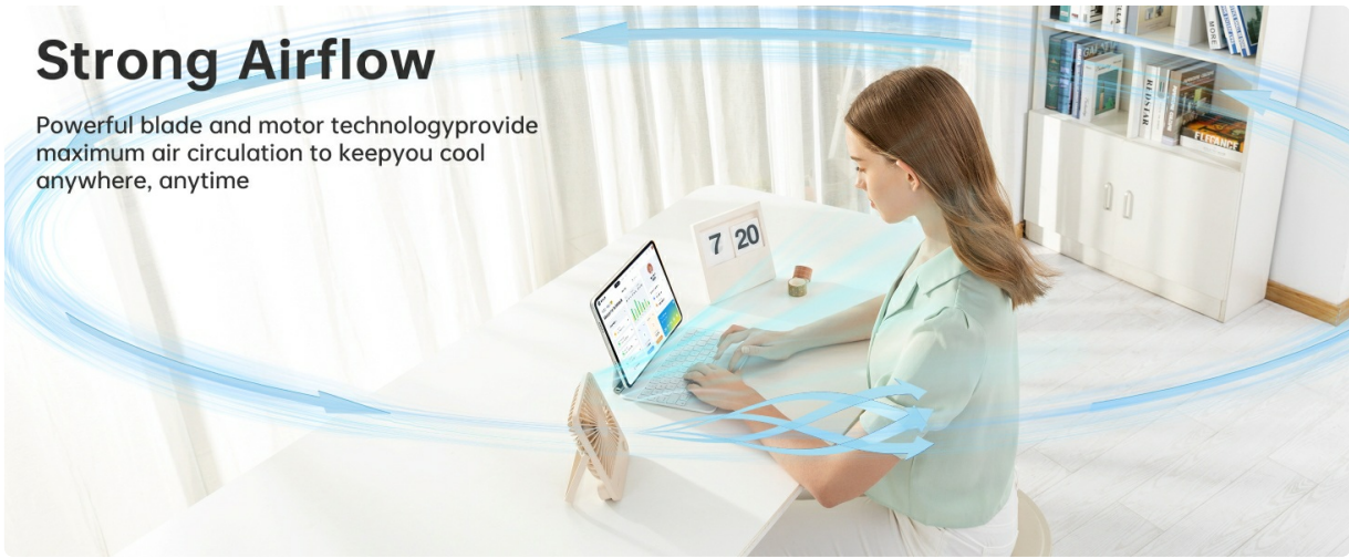
Figure 4.1: The fan offers four speeds for customized comfort.

Powerful blade and motor technology provide maximum air circulation to keep you cool anywhere, anytime