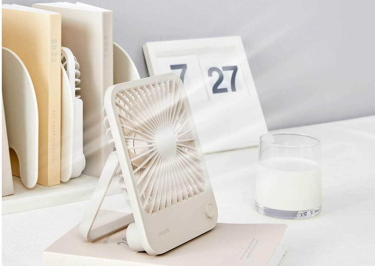
Figure 3.1: The fan's 180° foldable design for versatile placement.

Light Weight and Versatile. Thickness as A Notebook. Free Up More Space for The Desktop