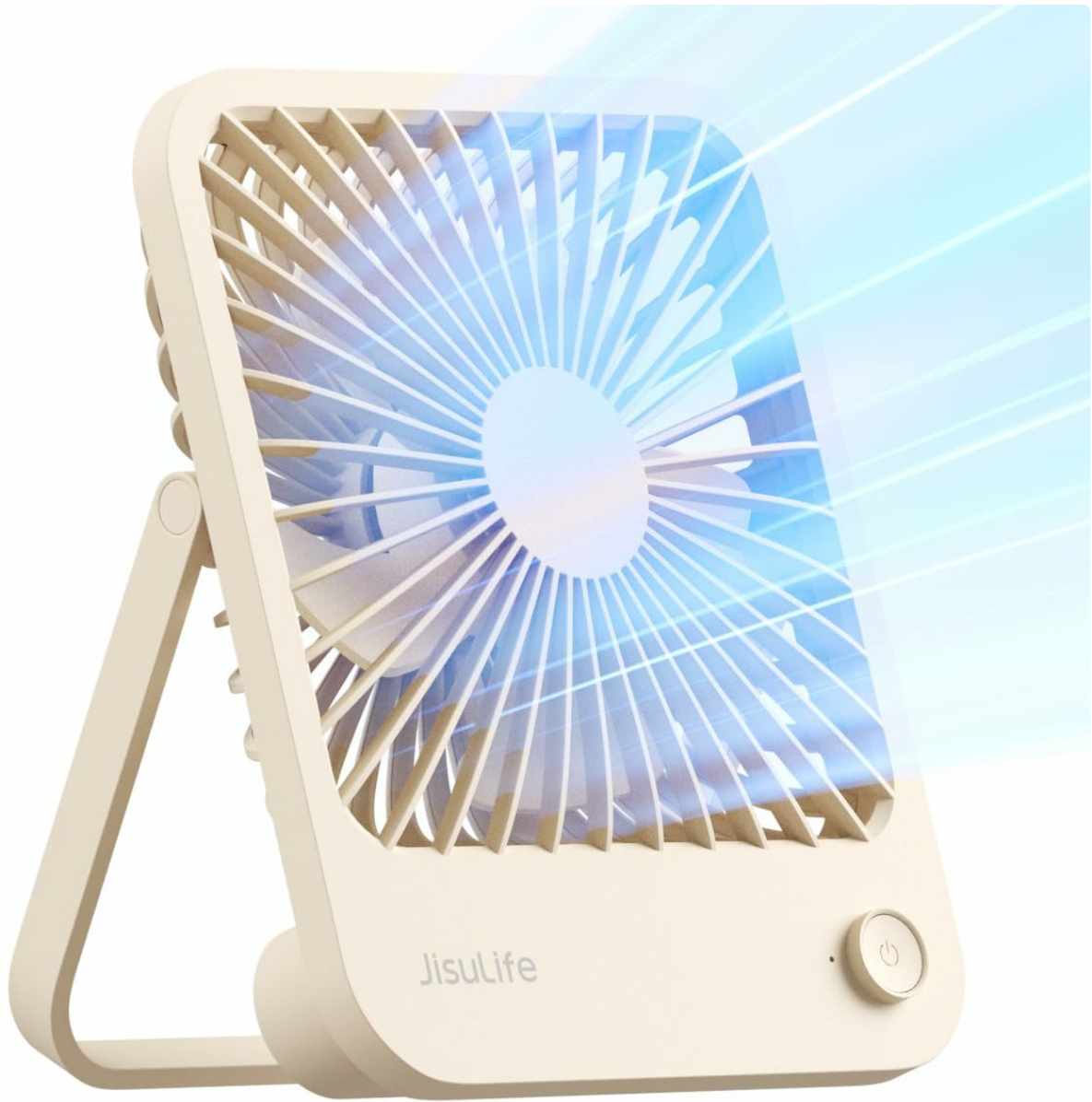
Figure 2.1: JISULIFE FA26 Portable Desk Fan (Brown).