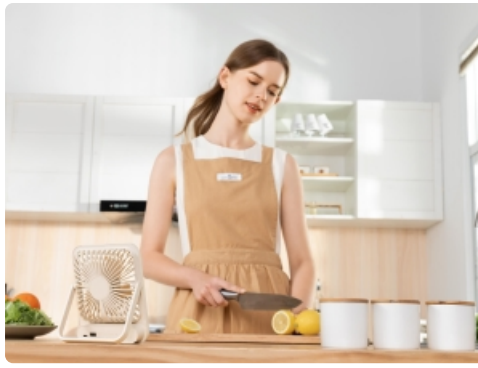
Figure 2.3: The fan is ideal for desktop use, providing personal cooling.