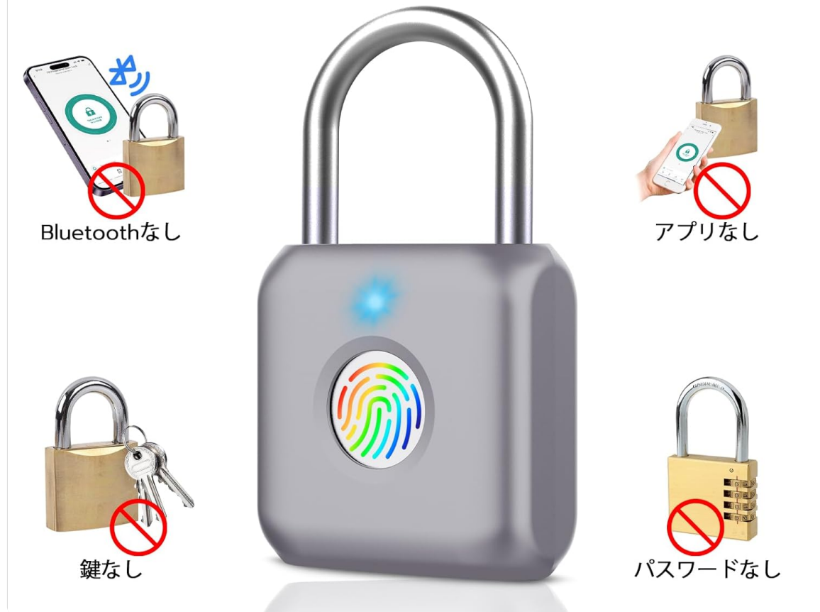
Figure 1: Front view of the eLinkSmart Fingerprint Padlock.