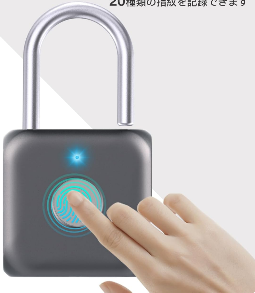
Figure 5: A finger placed on the sensor for quick unlocking.

Video 2: Demonstrates unlocking the padlock using fingerprint authentication.