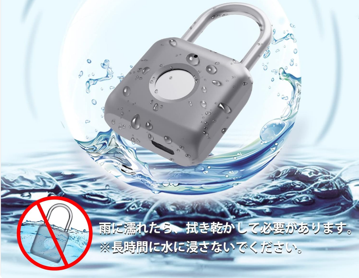
Figure 7: The padlock is designed to be water-resistant, but prolonged submersion should be avoided.

ステソレスの掛け金のご利用により、錆、腐食を防止でき、防水性及び耐久性が優れています。