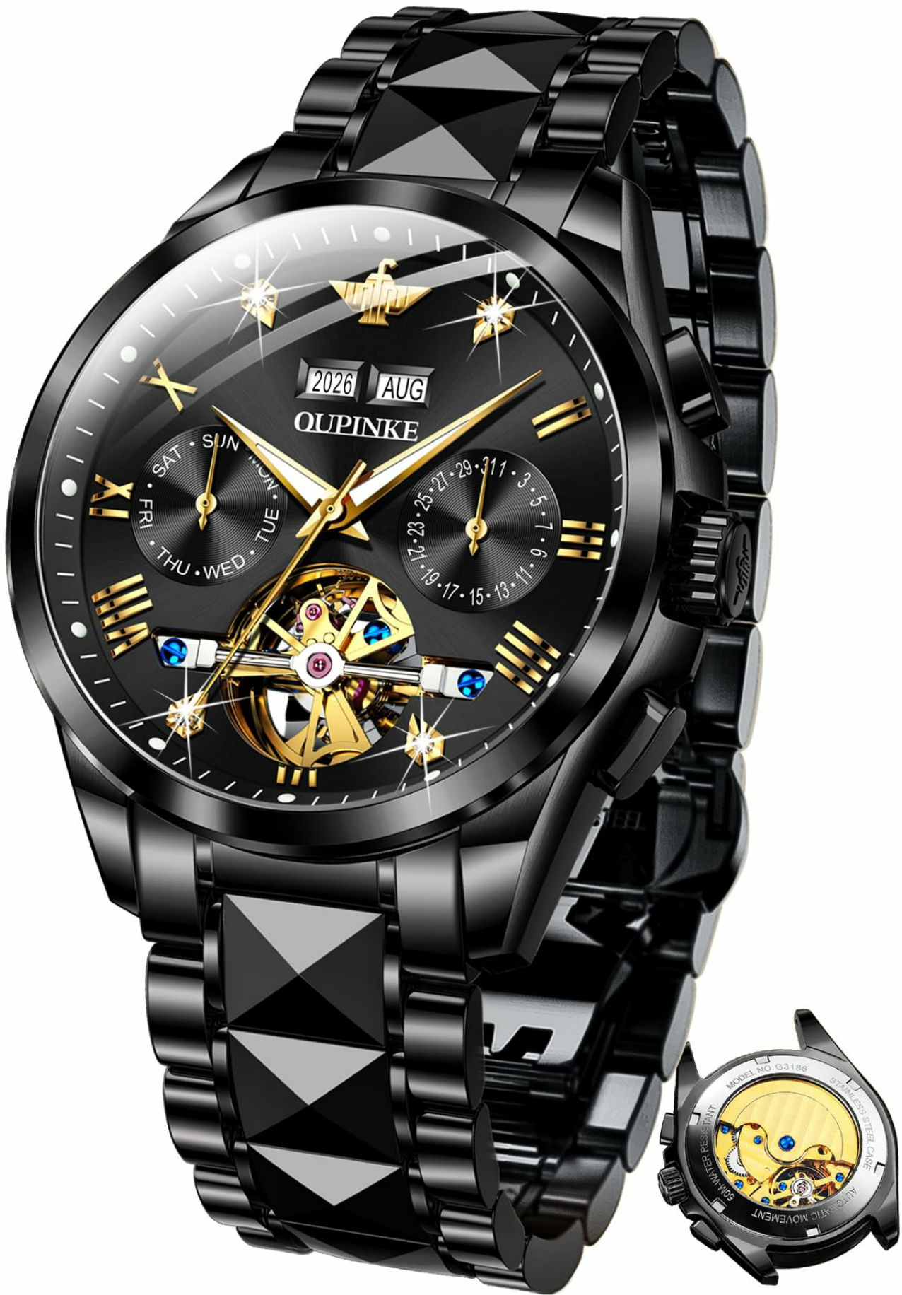
The OUPINKE G3186GH automatic mechanical watch, showcasing its elegant design with a black dial and tungsten steel strap.