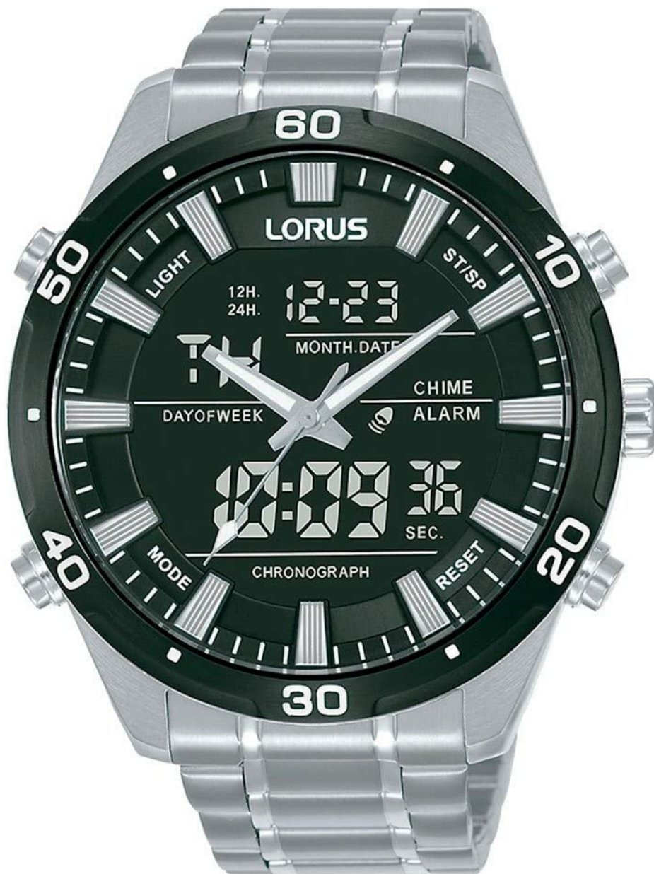
Image: Lorus RW649AX9 watch with metal bracelet, worn on a wrist.