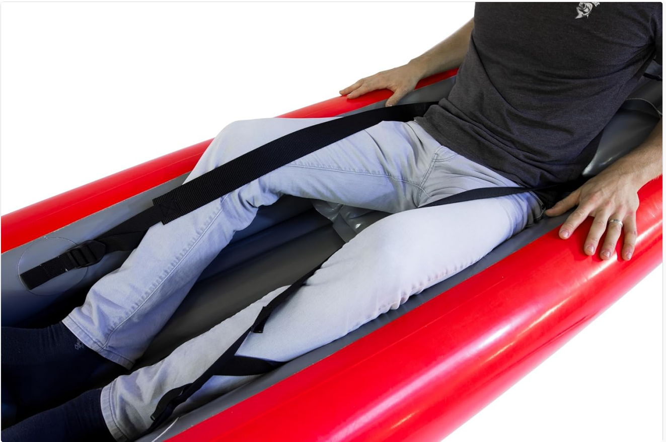
Figure 3.9: A user demonstrating the proper use of the thigh straps, which provide enhanced control and stability.