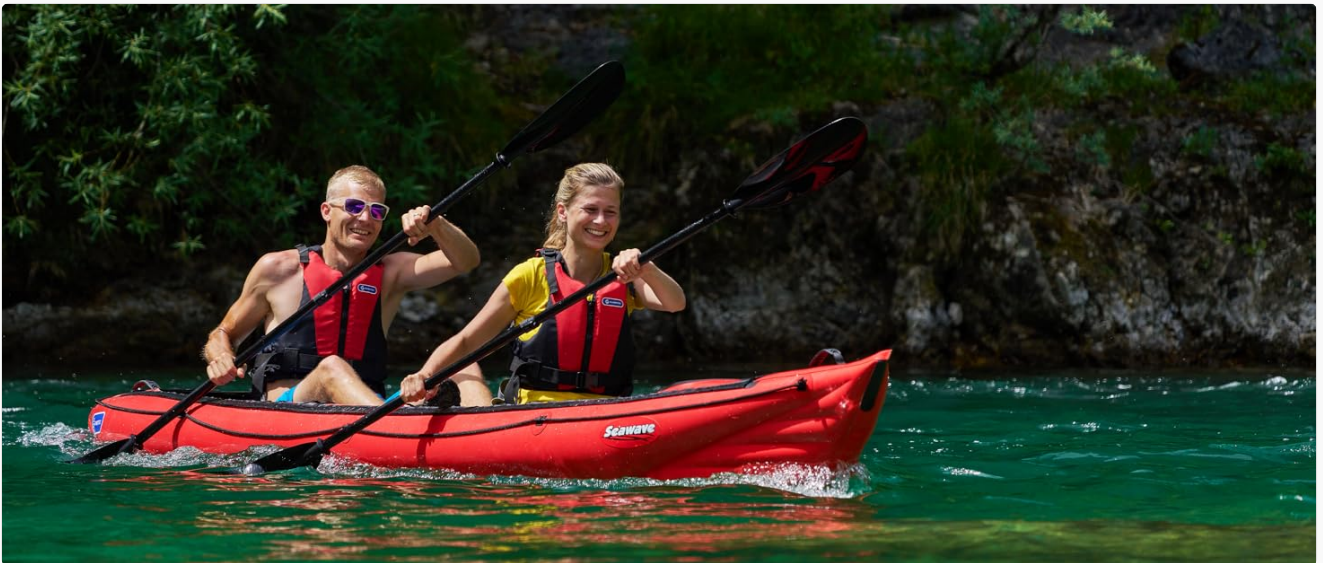
Figure 3.10: Two individuals enjoying a paddle in a Gumotex inflatable kayak on a clear river, demonstrating typical usage.