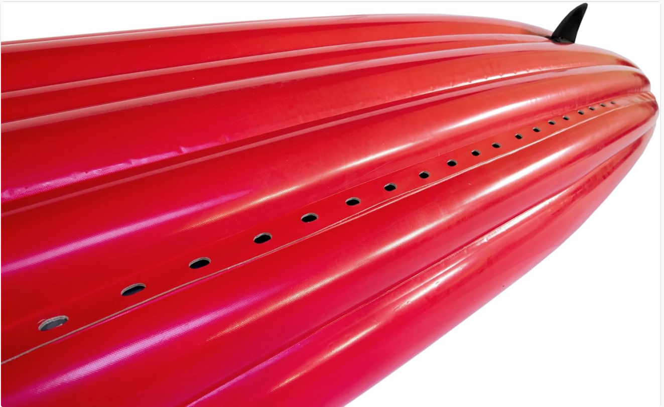
Figure 3.8: A detailed view of the kayak's bottom, showing the self-bailing drain holes and the slot for the removable tracking fin.