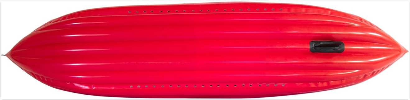
Figure 3.4: The underside of the kayak, showing the self-bailing drain holes along the keel.