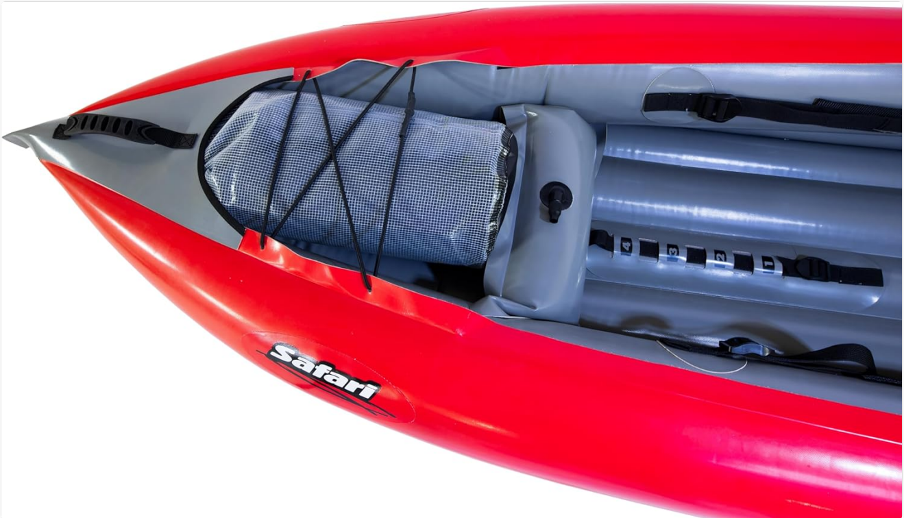
Figure 3.5: Close-up of the front interior, showing the bungee cord system for securing gear and the inflation valve.