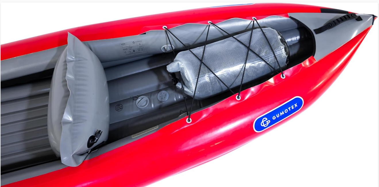
Figure 3.6: View of the rear interior, featuring the bungee cord system for additional storage and the comfortable inflatable seat.