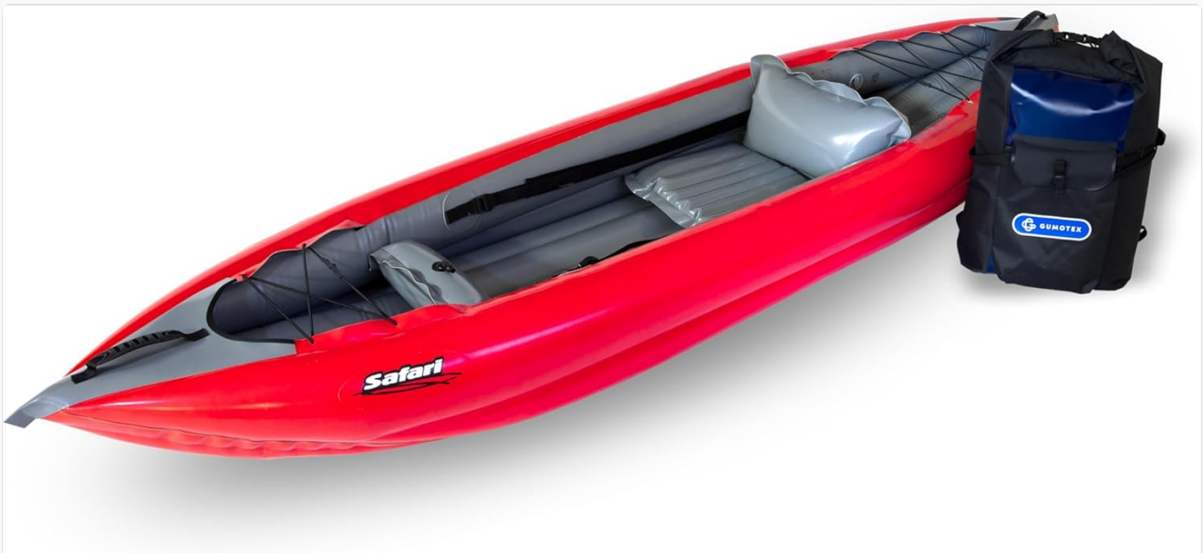
Figure 3.1: The Gumotex Safari 330 Red inflatable kayak shown alongside its included 70-liter transport drybag.