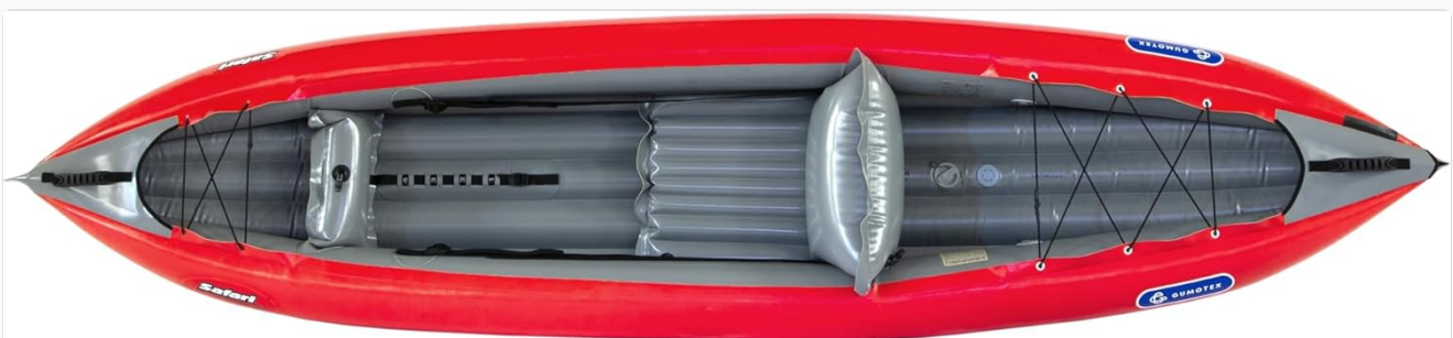
Figure 3.2: An overhead view of the Safari 330 kayak, highlighting its spacious interior and attachment points for accessories.