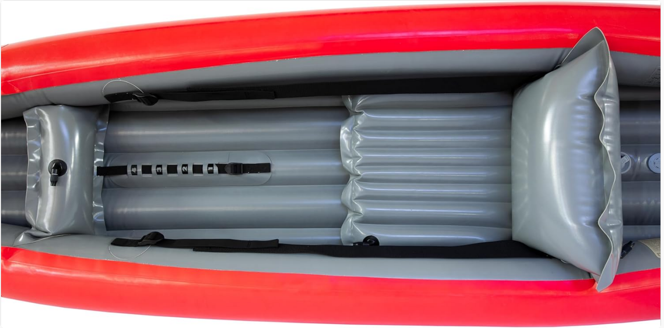
Figure 3.7: The kayak's interior, illustrating the adjustable footrest and the secure positioning of the inflatable seat.