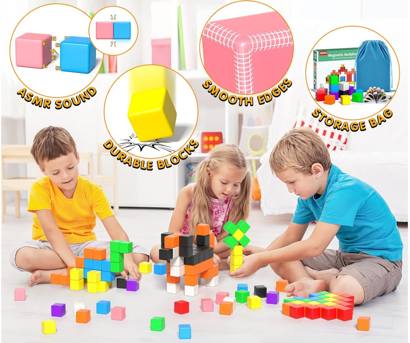
Image: A visual representation of the product's key features, including the satisfying 'ASMR sound' when blocks connect, their smooth edges for safety, overall durability, and the convenient storage bag for easy cleanup and transport.