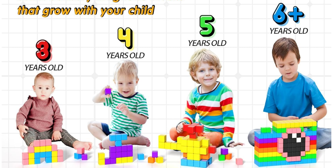
Image: This image shows children from toddlers to older kids interacting with the magnetic blocks, highlighting the product's versatility and appeal across different age groups (3-8 years old).