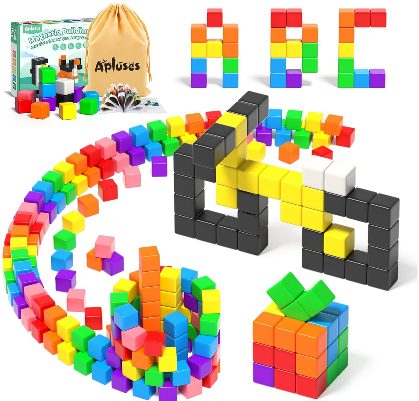
Image: The complete set of 54 magnetic blocks, showcasing their vibrant colors and potential for building various structures like letters and abstract shapes. The packaging and a storage bag are also visible.