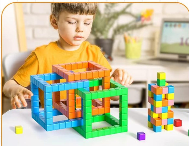
♥ Inspire 3D Imagination