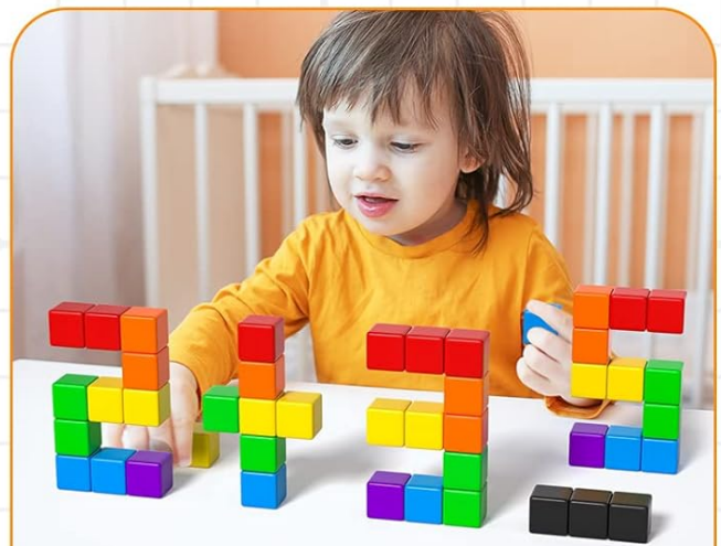
♥ Digital Computation