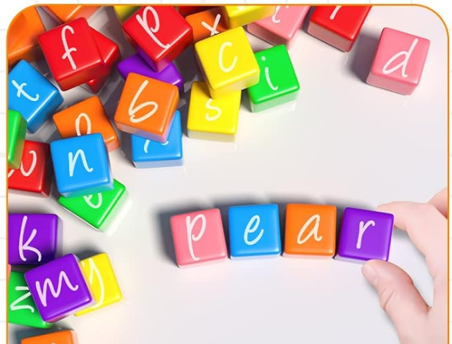
♥ Word Search Game